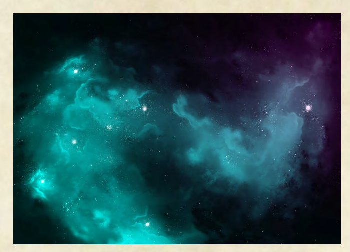
ON THE COVER The stars shine defiantly through the clouds.