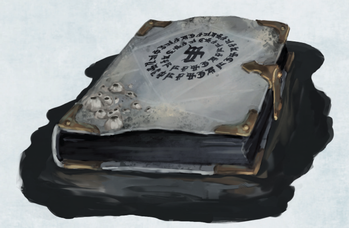
BOOK OF THORNS