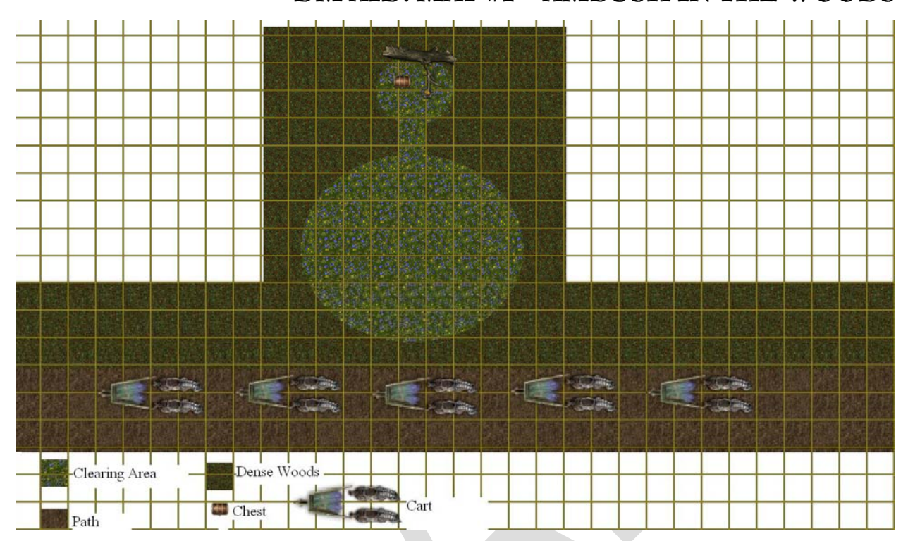
DM AID: MAP #1 - AMBUSH IN THE WOODS