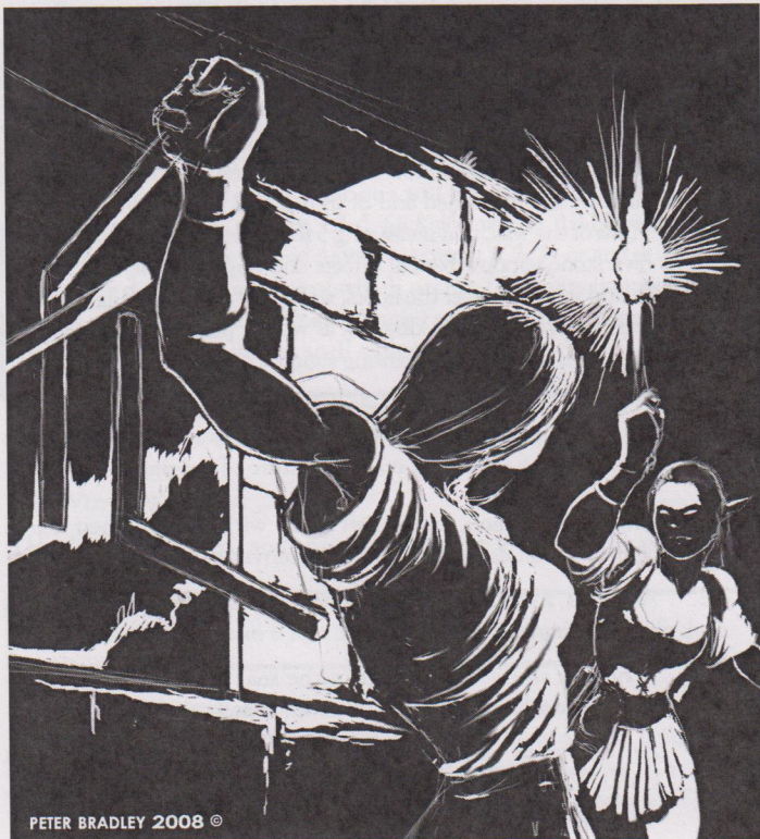
PETER BRADLEY 2008 ©

A massive throne of lapis lazuli dominates this chamber, it rising from a dais of inky black marble with swirls of grey. Behind the throne hangs a gonfalon of purple silk, it embroidered and tasseled with gold thread. Flanking the throne you note arched windows 8 feet wide by 12 feet high, these veiled by diaphanous, pale green curtains. Lumbent balls of light hover inches below the 20 foot peak of this chamber, the north and south verges of which are of 10-foot height.