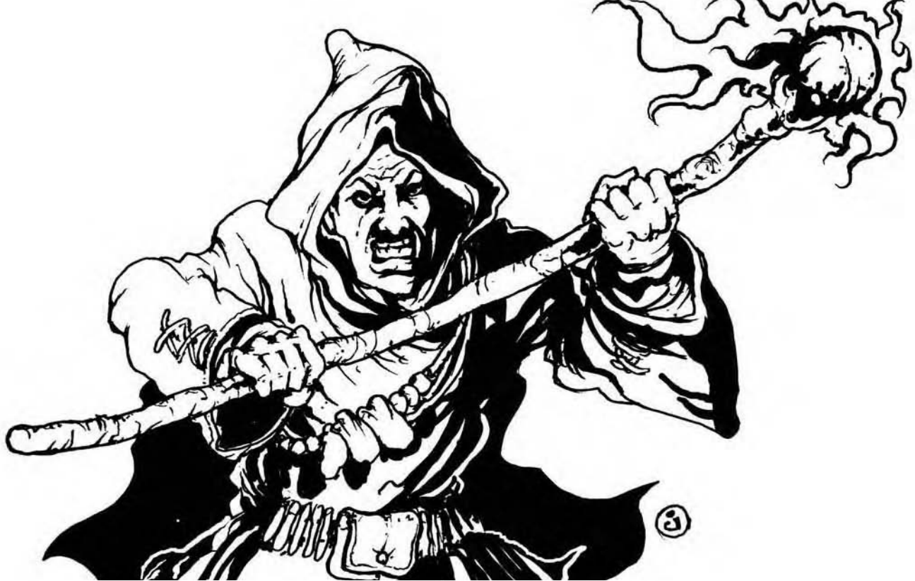
tongues spell (caster level 14th). This ability is always active.