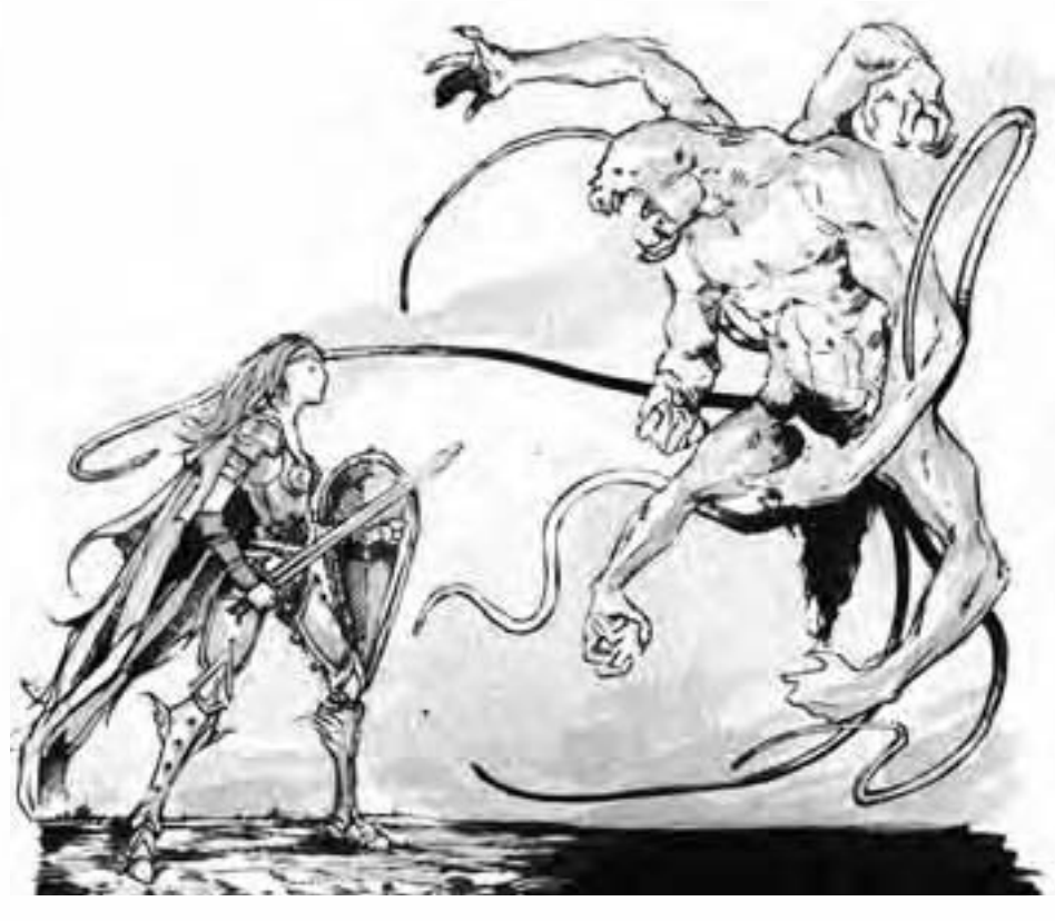
Female Names: Lumin—Zzirta, Willjula, and Aqixan. Common—Talliya, Lucinda, Eveliya.

Adventurers: Luminous typically adventure for one reason: to fight the forces of evil. Luminous often join good-aligned adventuring companies or knightly orders to gain allies in their struggle.