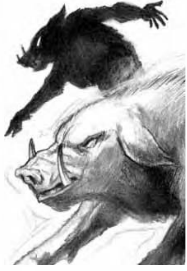
Special: Must be a devout, respected follower of Buer. This usually involves having completed some special quest or service for the cult.