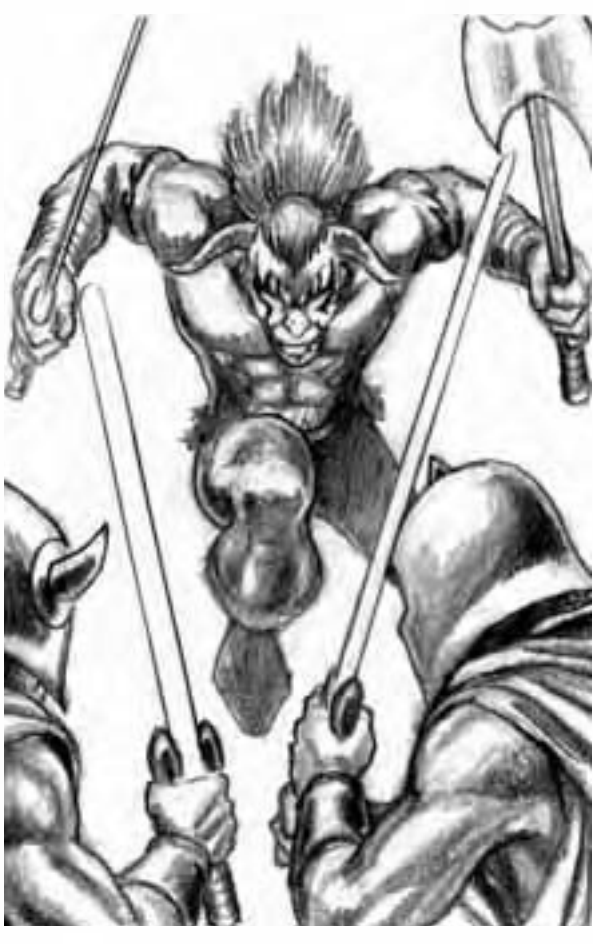
leave with only a vague goal—such as redeeming a dishonorable name—in mind.

Rebels usually have no choice but to leave their clans. They are outcasts who, for one reason or another, don't fit into uthuk society. Most common outcasts are those who either reject their clan's interpretation of Y'llan or reject their society altogether. Uthuk drifting toward a good alignment usually fall into this latter group.