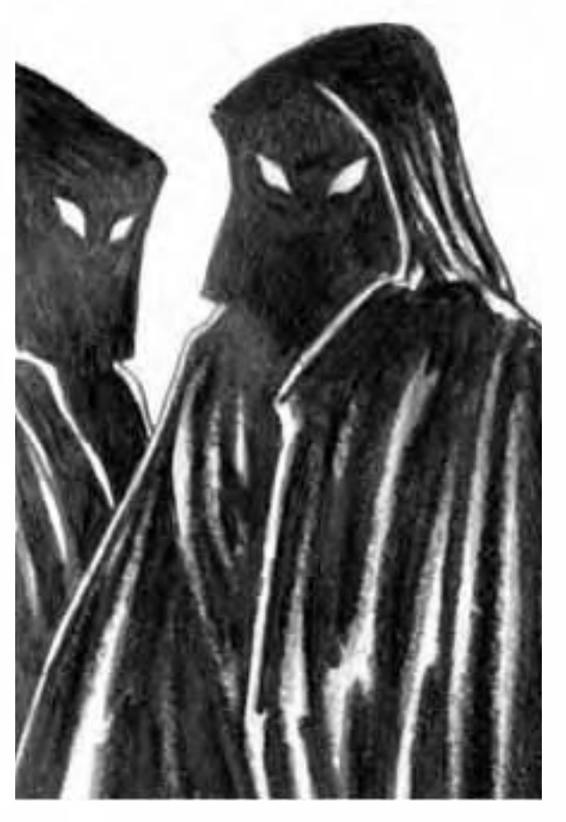
improved balance, athletic ability, and stealth even in human form.