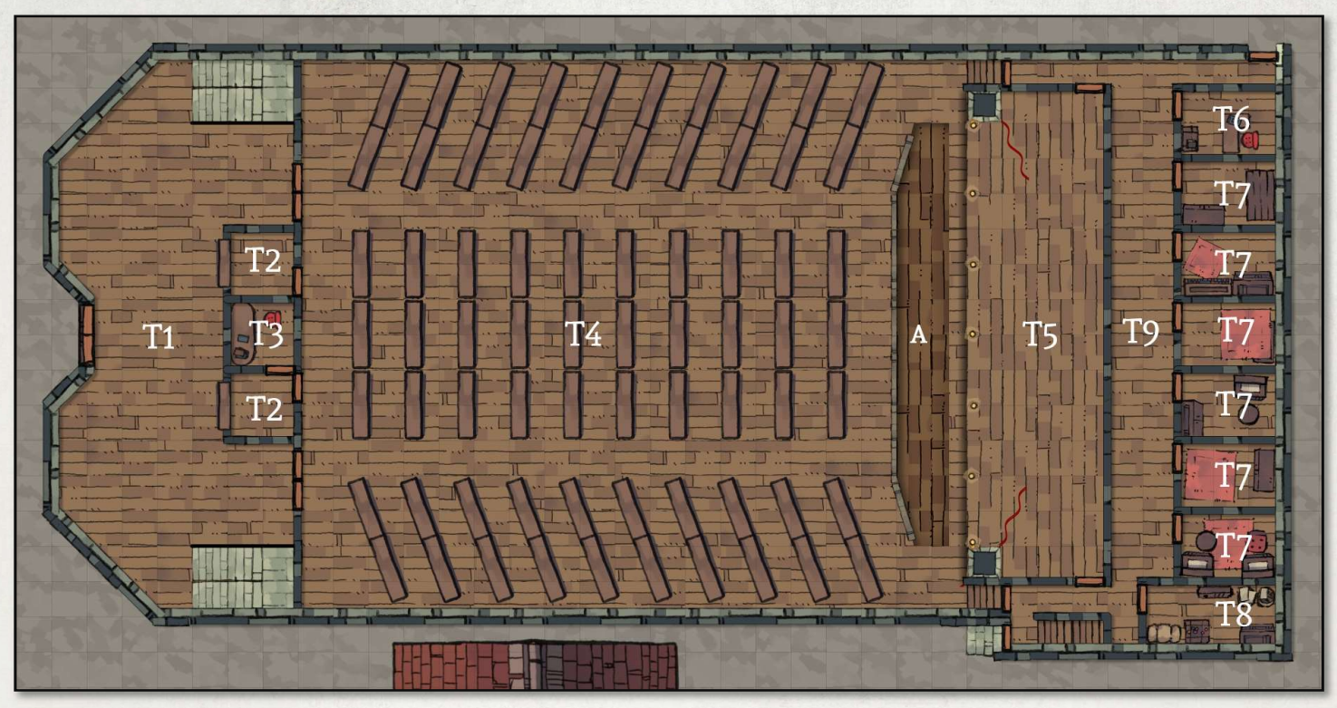
Map 1 – Lightsinger Theater Main Level