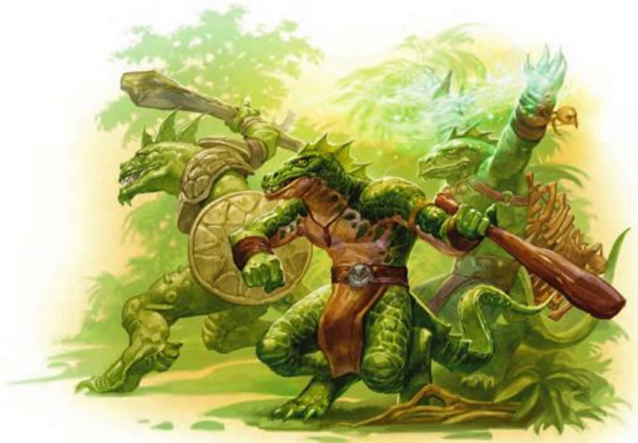
(Left to right) poison scale myrmidon, savage, and magus