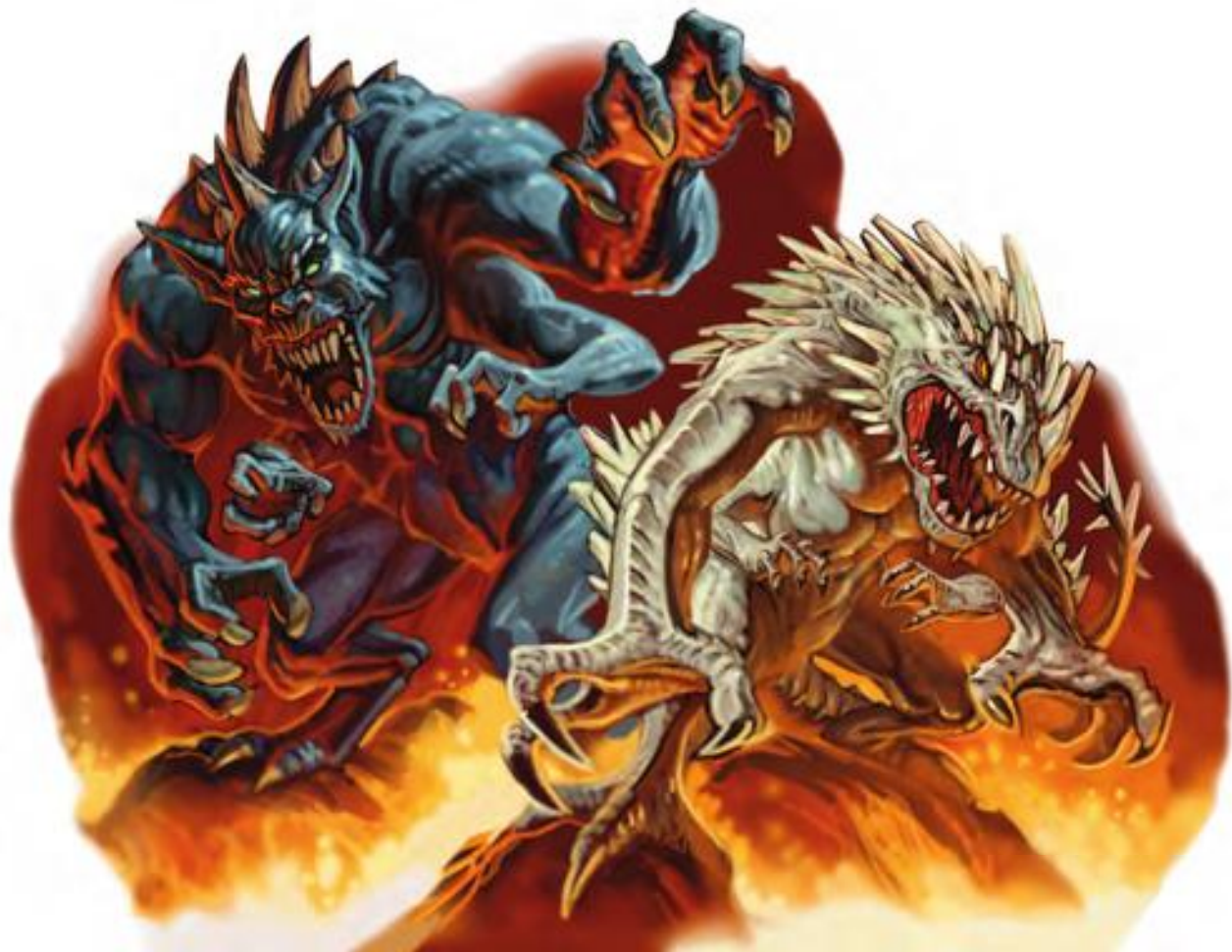
(Left to right) abyssal eviscerator and bloodsweep demon