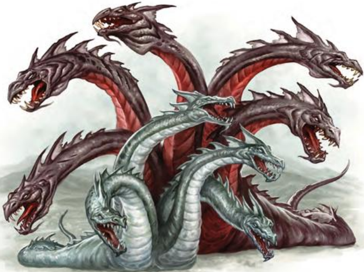
(Back to front) heroslayer hydra and razor hydra

A CREATURE OUT OF LEGEND, the heroslayer hydra earned its name from the heroes who fell to its fangs.