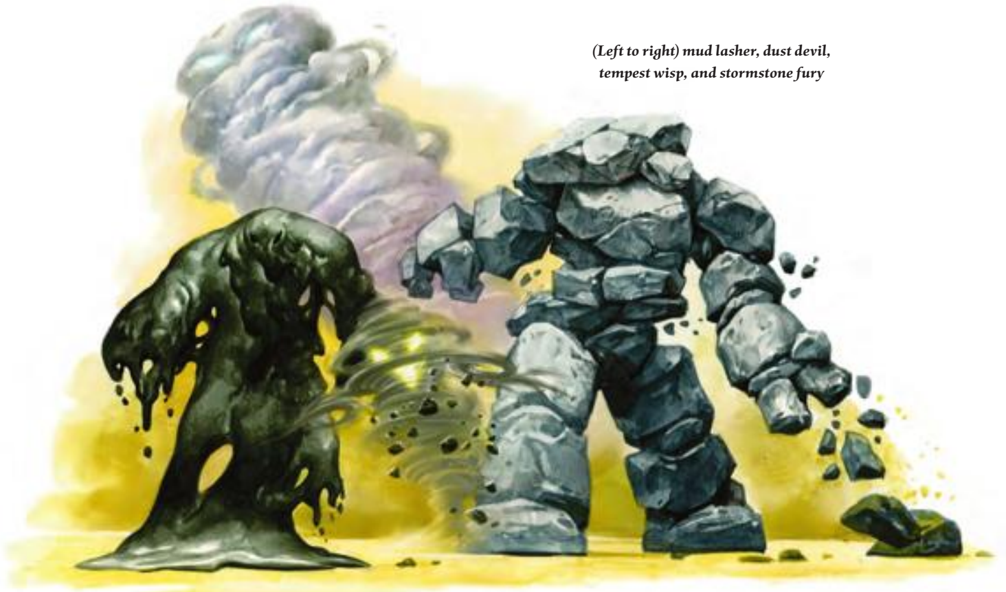
(Left to right) mud lasher, dust devil, tempest wisp, and stormstone fury