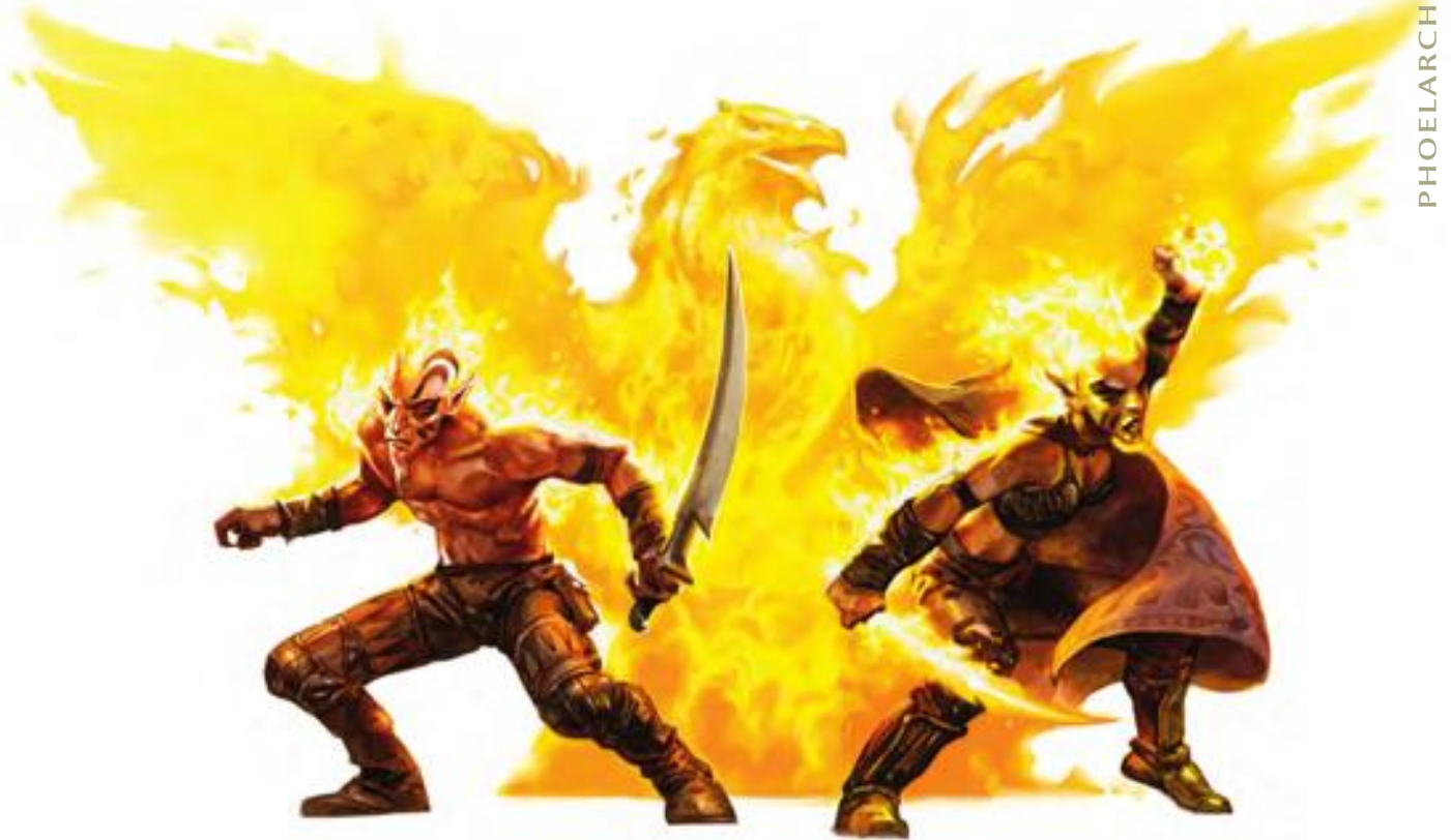
(Left to right) phoelarch warrior, phoera, and phoelarch mage