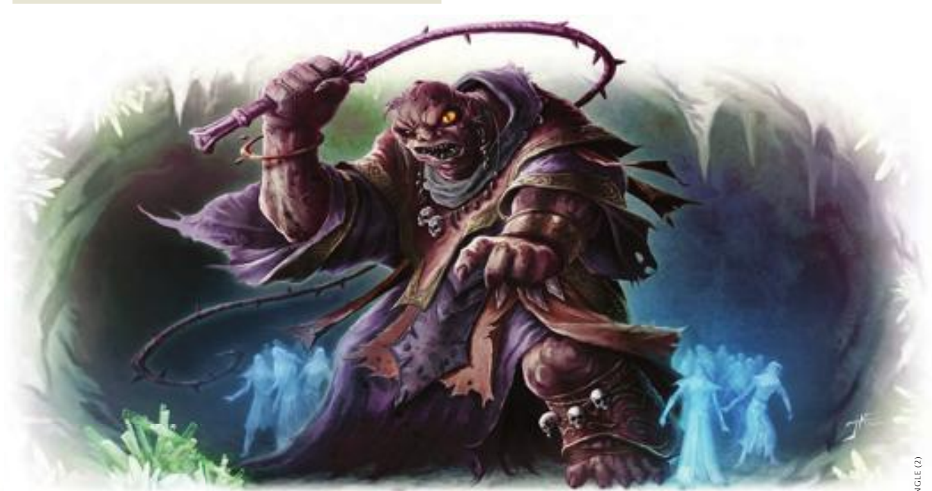
Fomorian ghost shaman

↗ Evil Eye (minor; at-will) Ranged 5; +20 vs. Will; the target treats the fomorian cackler as invisible (save ends).