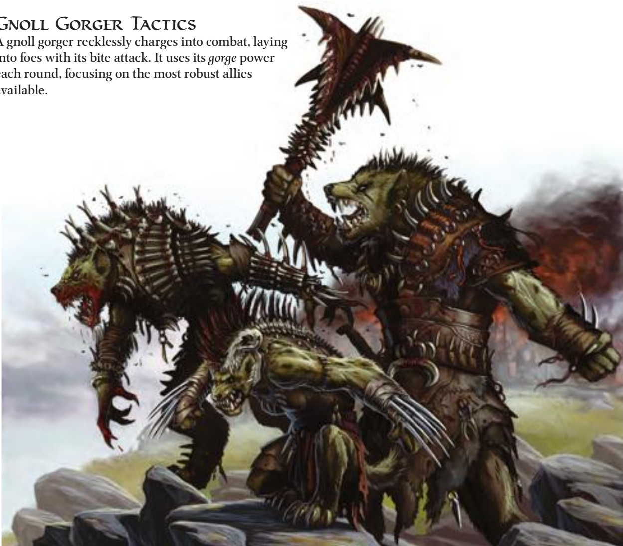
(Left to right) gnoll gorger, deathpledged, fang of Yeenoghu