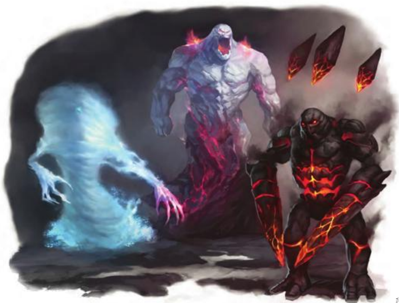
(Left to right) windstriker, chillfire destroyer, and flamespiker

Arcana DC 18: A chillfire destroyer combines the power of fire with the strength of elemental ice. This dangerous mix results in a deadly explosion when the creature is slain. Both fire archons and ice archons seek to recruit chillfire destroyers for their forces, sometimes coming into conflict as a result.