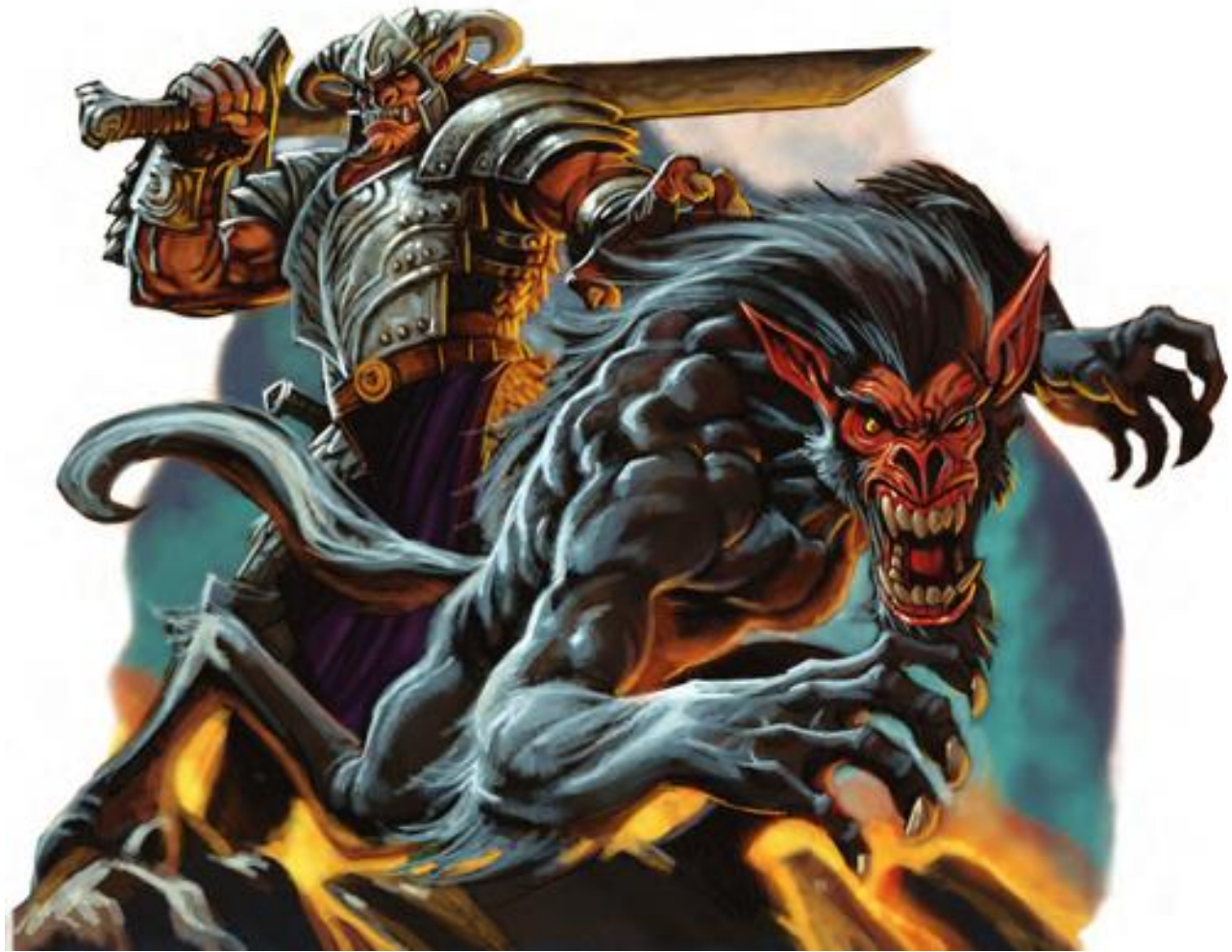
Barghest battle lord in hobgoblin form and in wolf form