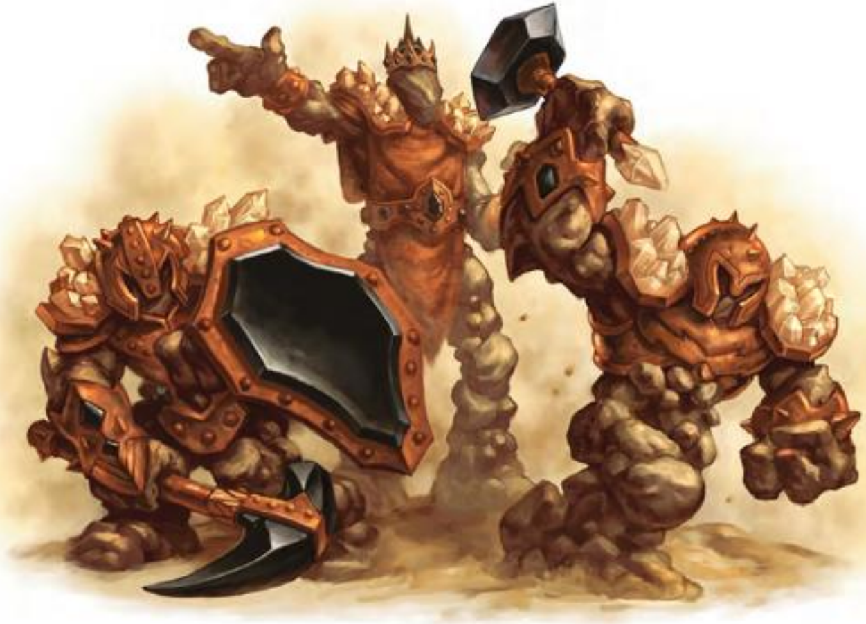
(Left to right) earth archon seismic striker, ground rager, and rumbler