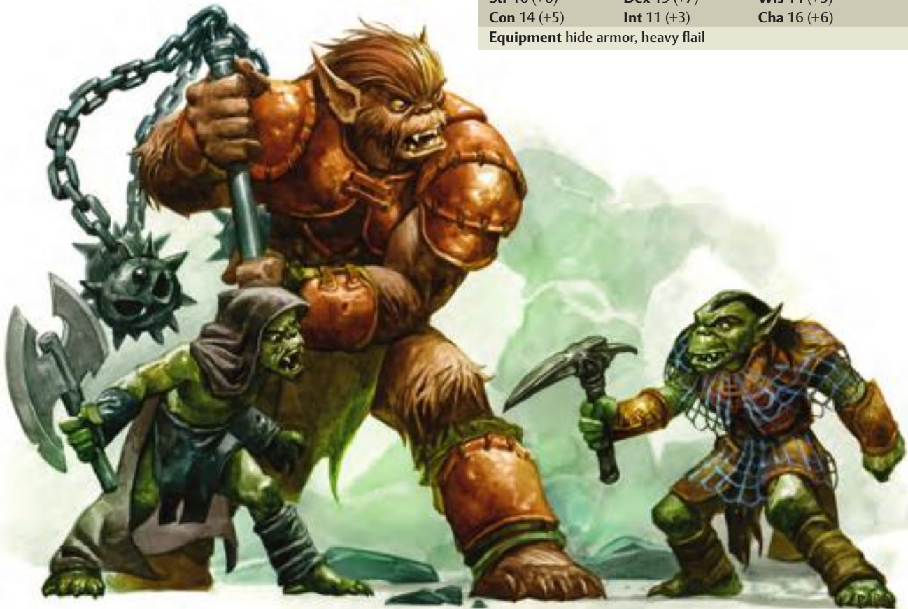
(Left to right) goblin acolyte of Maglubiyet, bugbear wardancer, and Lolthbound goblin