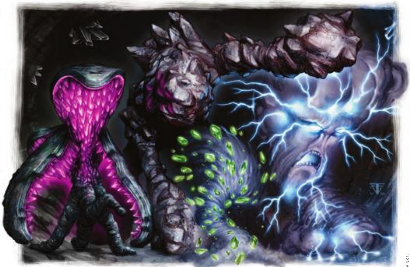
(Left to right) geonid, rockfist smasher, shardstorm vortex, and windfiend fury

Close burst 2; +16 vs. Reflex; 1d10 + 5 thunder damage. Effect: The windfiend fury teleports to any space adjacent to the burst's area of effect.