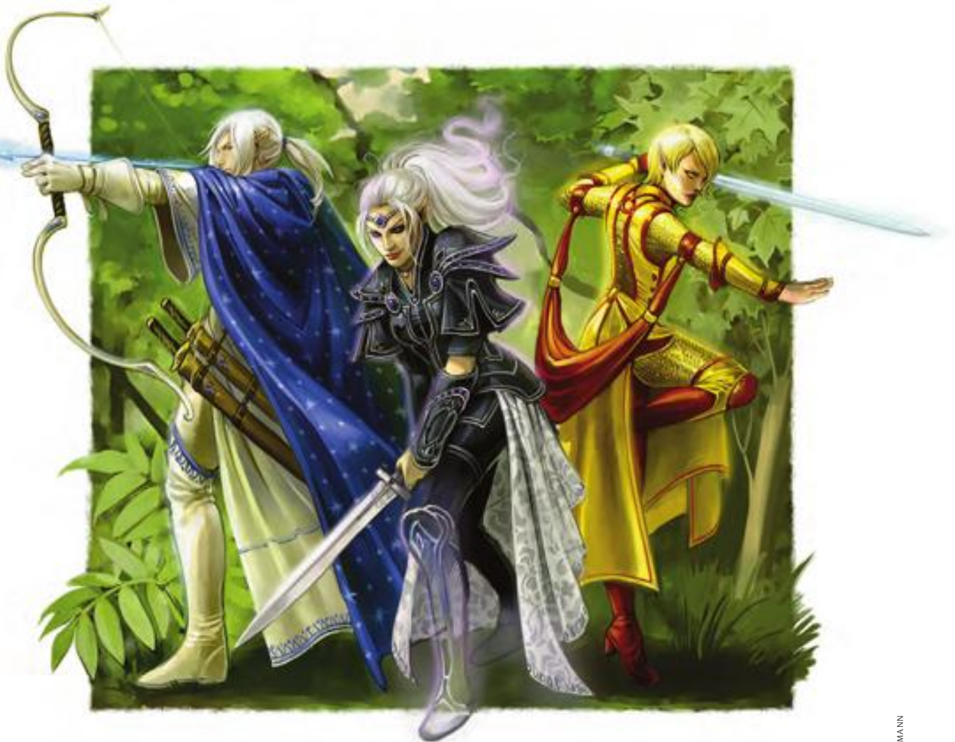
(Left to right) eladrin arcane archer, core of mischief and strife, and bladesinger

Arcana DC 17: Arcane archery is more than just a combination of magic and skill at arms. It is a complete fusion of two arts, its secrets known only to the eladrin.