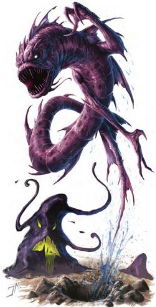
Kazrith and rupture demon