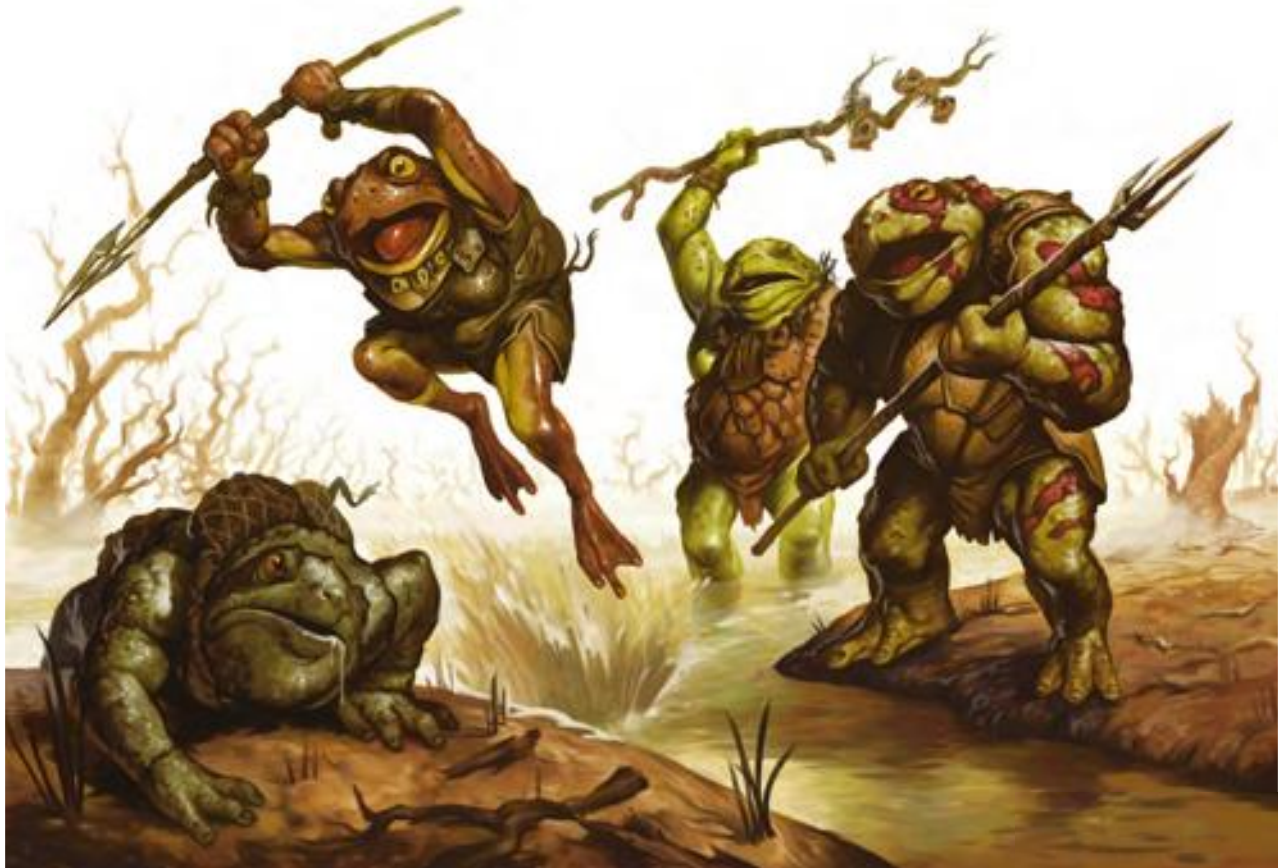
(Left to right) bullywug croaker, twitcher, mud lord, and mucker