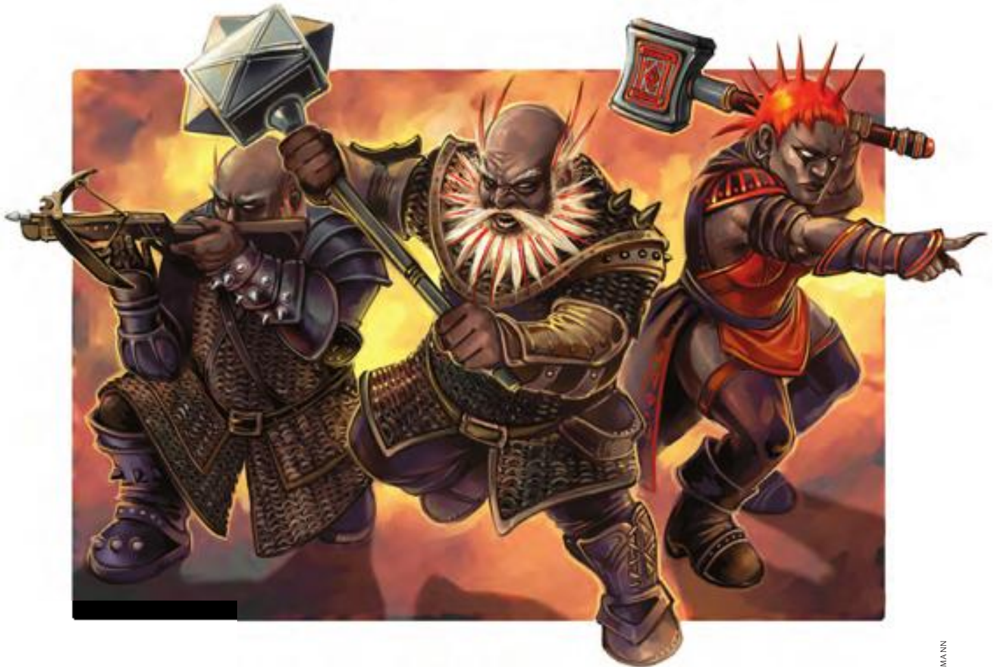
(Left to right) duergar scout, shock trooper, and theurge