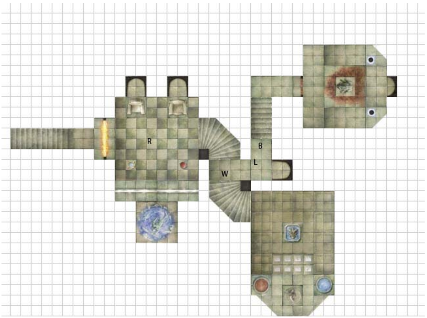
ENCOUNTER 3: ESCAPE!