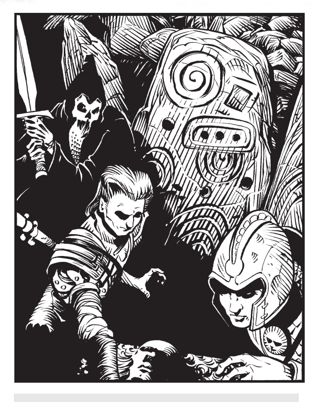
the figure on Red Horse Hill. Atop its lid is the stone figure of an armored man lying full length, his hands still clutching the pommel of a greatsword that extends all the way to his feet.

Creatures: This is Saithnar's tomb, but the warlord is not inside it. Instead, he waits quietly in a secret alcove just off the stairs. Discovering the secret door to his hiding place requires a careful Search (DC 30) of the right-hand wall of the stairway. Otherwise, he waits until the intruders are gathered around his tomb before stepping out behind them to demand that they explain why they have come (see Development, below). If the characters sneak in and immediately begin prying off the lid of the tomb, holy symbols at the ready, he does not bother to parley but simply attacks from behind with surprise, calling forth the two additional wights lurking in the curved passageways behind each archway.