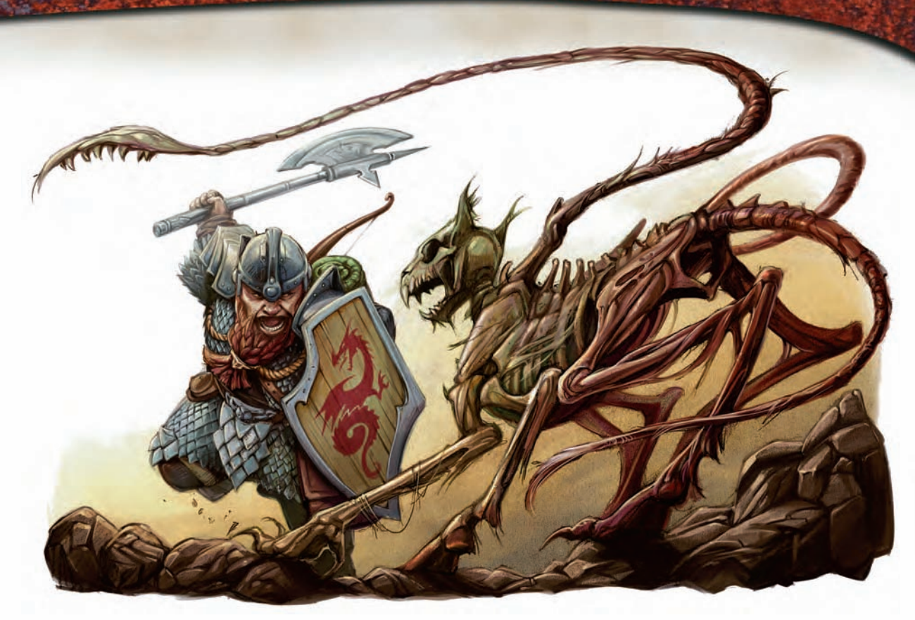
Tordek uses Cometary Collision to close quickly with a displacer beast skeleton

Benefit: If your familiar holds the charge for a touch spell, it does not provoke an attack of opportunity for entering an opponent's square.