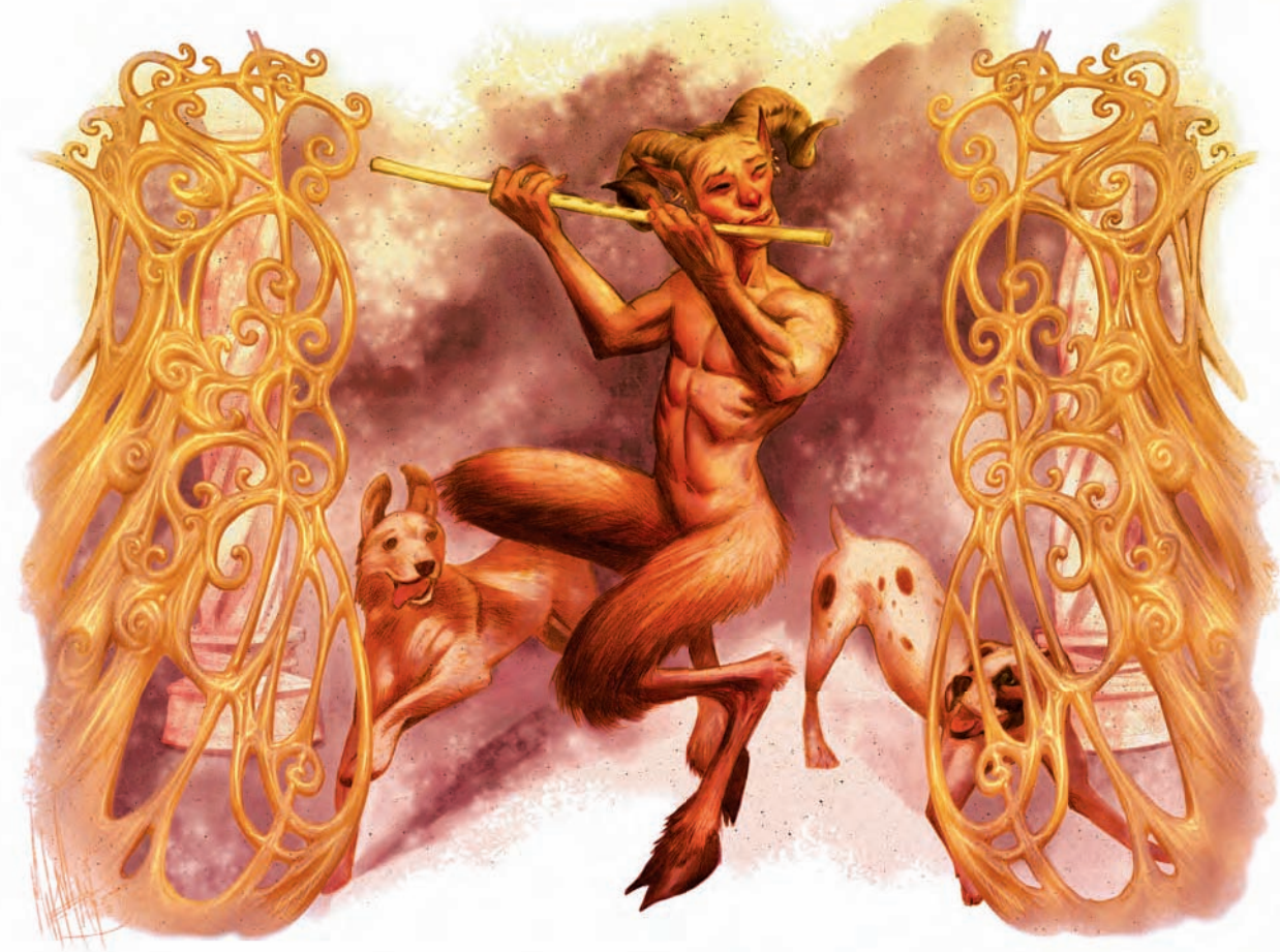
Fauldwick the satyr, trapped on the Lost Isle until the end of time

Fauldwick has lost track of how long he has lived on the Lost Isle. Over the centuries, loneliness has driven him quite