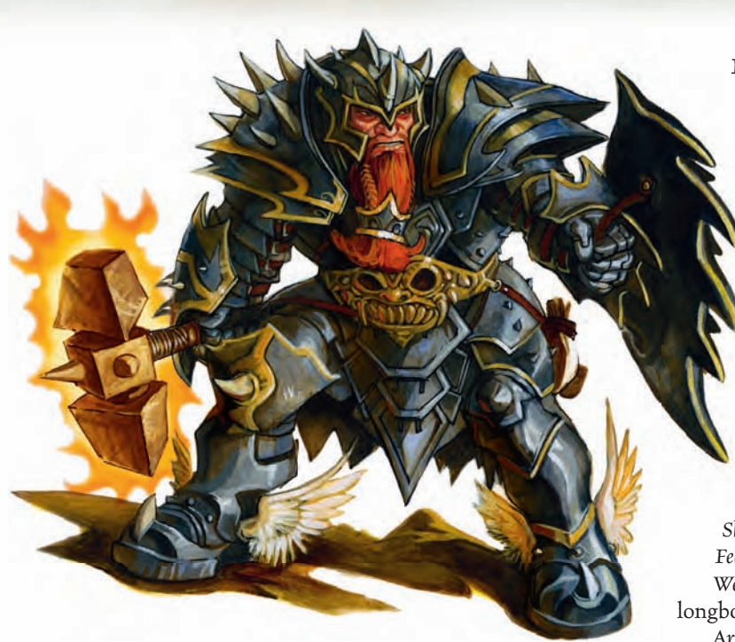
Tordek Brighthammer, Warchief of the Iron Halls

turn, you gain a +2 dodge bonus to AC. This bonus improves to +4 at 11th level and to +6 at 16th level.