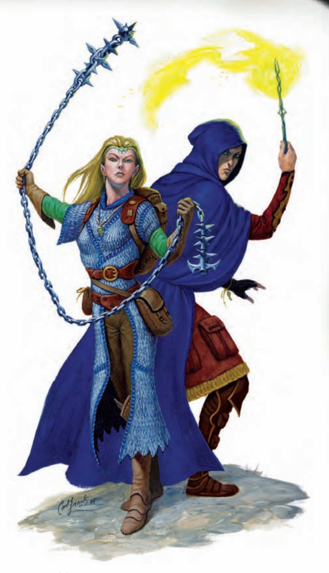
The half-elves of Sharulhensa are dedicated to preserving ancient lore

The reward of Sharulhensa affilation—access to the magic pools—is great, but earning affiliation with Sharulhensa is