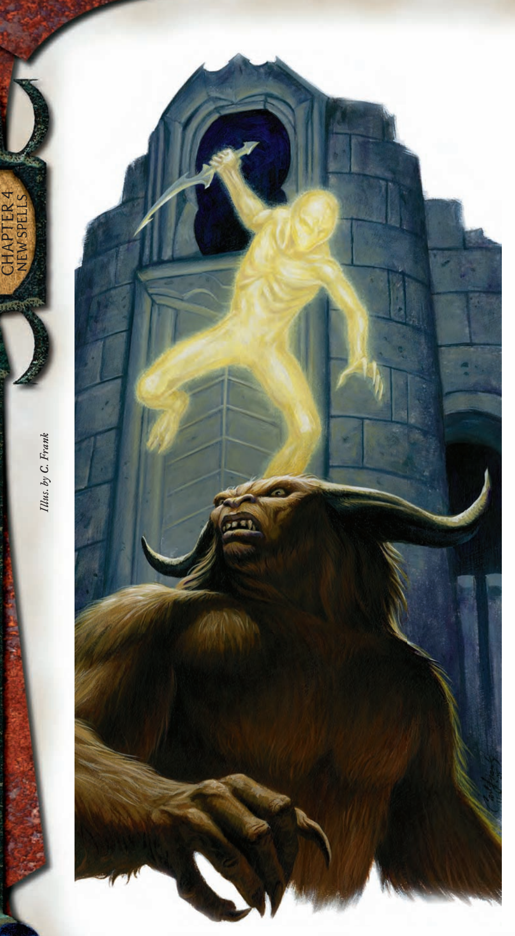
A luminous assassin prepares to dispatch its target

it to attack another creature if the originally targeted creature still lives and is within the spell's range.