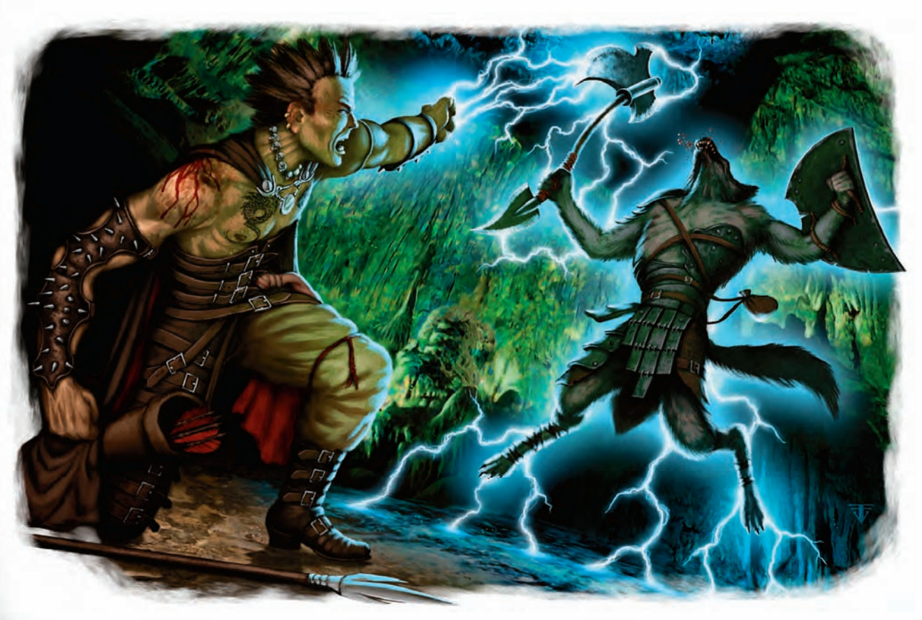
Hennet strikes down a gnoll with the electric vengeance spell

When you cast this spell, specify an energy type (acid, cold, electricity, fire,