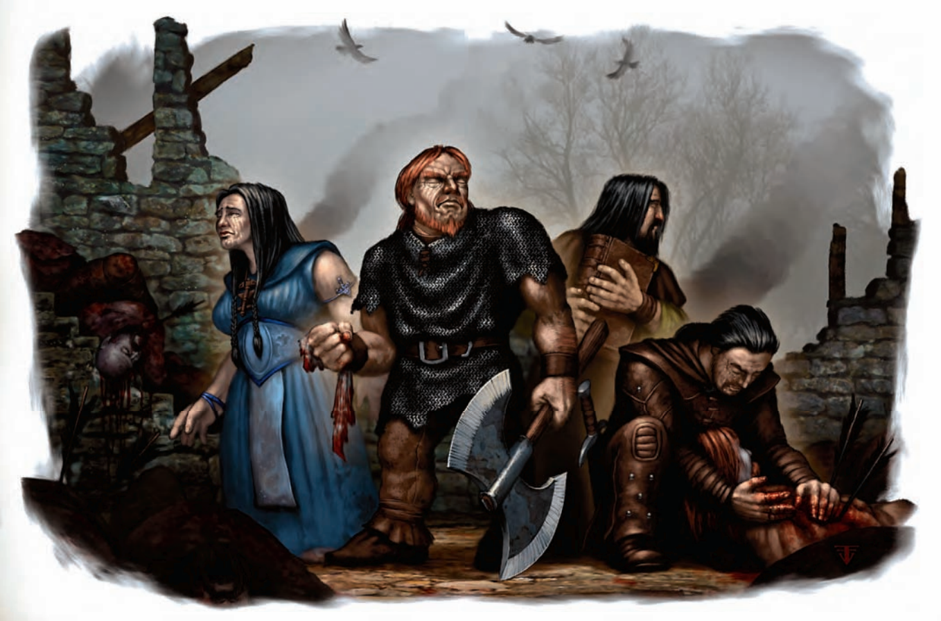
Four young dwarves vow vengeance against those who destroyed their stronghold

This background works especially well for a party whose members all belong to the same race, such as a group consisting solely of dwarves, elves, or halflings. Such a shared racial heritage can add yet another interesting dimension to your games. For instance, suppose you and the other players jointly decide that your dwarf characters all came from the same stronghold. Life changed for all of you when a horde of mind flayers and their minions boiled up out of the underground and overwhelmed your settlement. The dwarves who were not slain outright were enslaved and taken back to the cyclopean