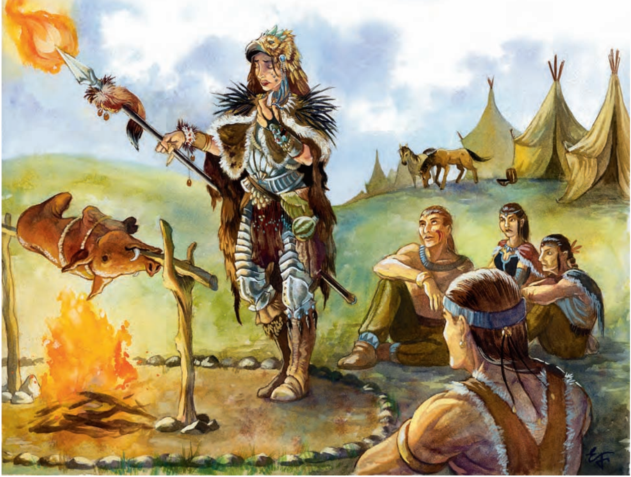
Those of tribal origin band together for the good of all

If you willingly left home, you could have felt a strong sense of wanderlust from an early age. You always wanted to know what lay over the mountains. The outside world seemed