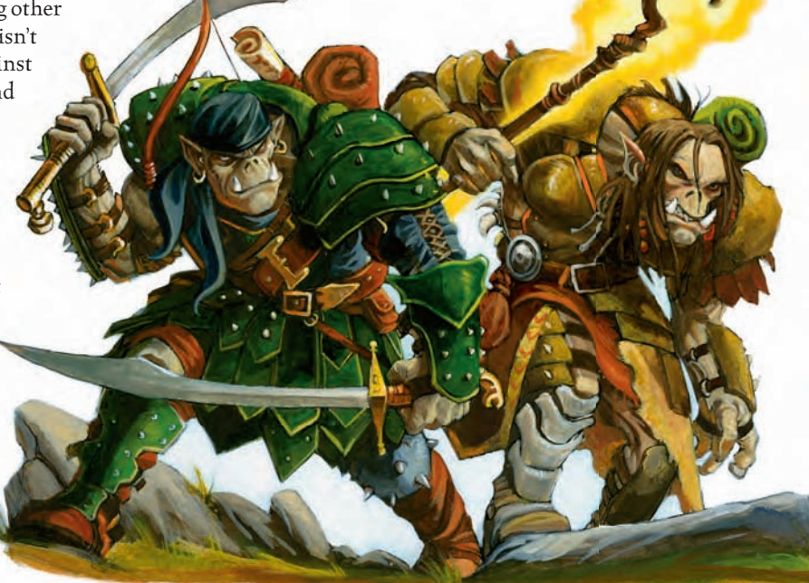
The Bloodfist Tribe wanders the world, searching in vain for an ideal home

When the chieftain deems a Bloodfist member worthy, he directs the shamans to build an earthen lodge. The shamans then use flint knives to cause painful wounds to the halforc the tribe is honoring. Then the bleeding half-orc is enclosed in the Blood Lodge and suffers pain and waking nightmares for a day and a night.