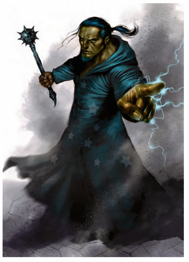
Morthos, warlock of the Ebon Tower

"I've done . . . great evil. Those deeds darkened my soul, and every day I do all I can to erase that stain."