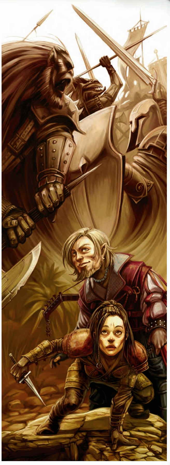
Gimble and Lidda sneak through a phantom battle

The mist is too thin to obscure vision or provide concealmen, but walking through it is hazardous. Each round, a creature that begins its turn in the area of the spell, or that enters the mist during its turn, is subject to one or more of the following effects