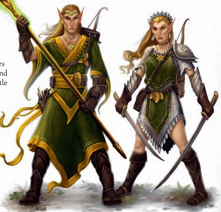
The Elves of the High Forest take part in the Hunt of the Full Moon

Those who reach a new level of status within the Elves of the High Forest attain the new benefits after attending the Hunt of the Full Moon—a combination night-hunt and ritual. The greatest hunters among the elves take you on an all-night hunt for elusive game. The target is traditionally a half-fey white stag, but sometimes the elves hunt more dangerous quarry by necessity or for variety. During the night, they teach you specialized techniques in perception, stealth, and moving through the wilderness. Some say the hunters leave the Material Plane entirely and wind up hunting mystical game among the fey of Arborea. You'll return in the morning exhausted, but with the sharper perceptions and peerless camouflage of the greatest elf hunters.