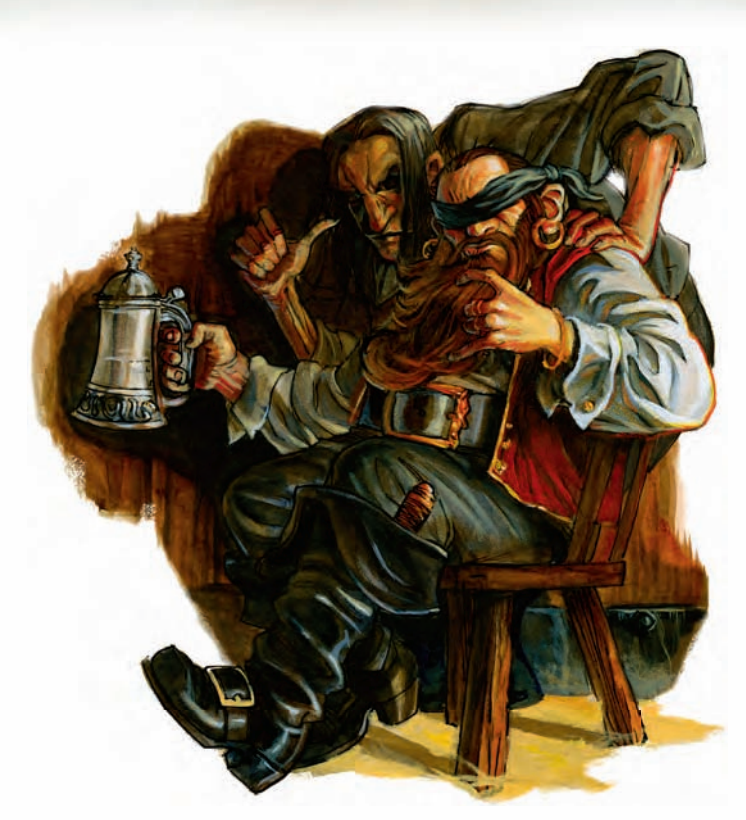
Eyeless Errol listens to a suggestion for the Restenford Guild's next job