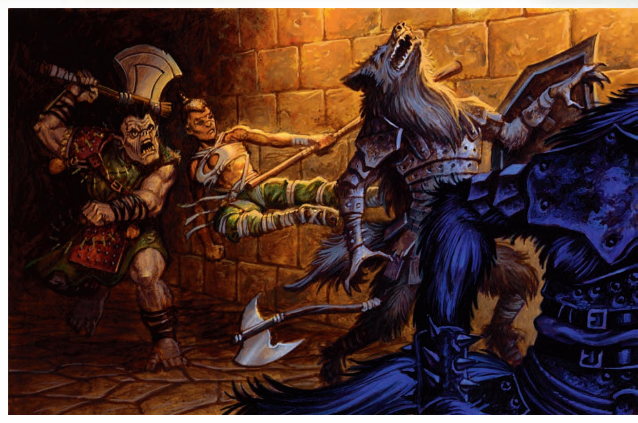
Warrior types let it all hang out in combat

and great class features, the ranger can also work to improve his combat prowess against specific types of foes. However, he lacks the versatility of the standard fighter because he must focus on a single combat style. If you follow the archery combat path, the party's expert should support the cleric's necessarily broader role as a melee combatant. Conversely, if you follow the two-weapon path, both the arcane spellcaster and the expert need to build up their ranged arsenals.