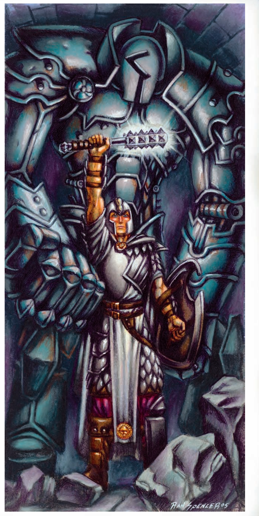
Jozan summons an iron golem

The subject of this spell becomes dizzy as the ground seems to drop away beneath its feet. The subject must succeed on a DC 10 Balance check at the start of each turn to take a move action.