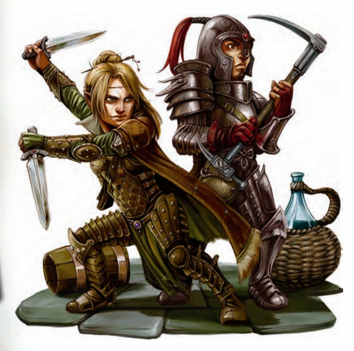
The gnomes of the Golden Helm Guild make fine weapons and armor and they're capable of using them

Background, Goals, and Dreams: The Golden Helm Guild is a network of expert master crafters that spans dozens of gnome communities, making fine armor, weapons, and other gear for the greatest heroes of the gnomes. But the Golden Helm is no mere blacksmithing guild. It focuses on