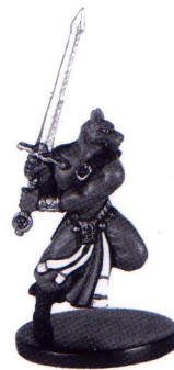
HOUND ARCHON 7 OF 80