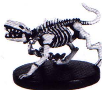
WOLF SKELETON 57 OF 80