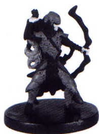
ELF ARCHER 21 OF 80