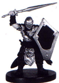
MAN-AT-ARMS 10 OF 80