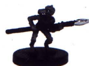
KOBOLD WARRIOR 48 OF 80