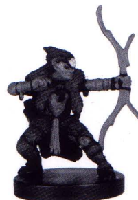
WILD ELF BARBARIAN 30 OF 80