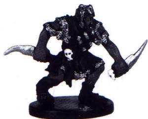
HALF-ORC ASSASSIN 65 OF 80

All trademarks, including character names and their distinctive likenesses, are properties of Wizards of the Coast, Inc. (C) 2003, Wizards.