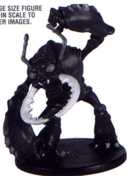
UMBER HULK 78 OF 80

LARGE SIZE FIGURE NOT IN SCALE TO OTHER IMAGES.