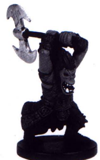
ORC BERSERKER 73 OF 80