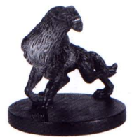
BARGHEST 39 OF 80