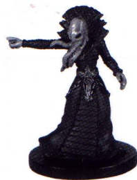
MIND FLAYER 50 OF 80