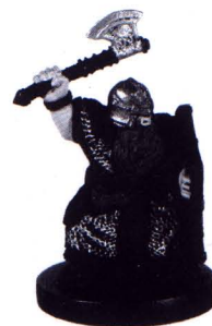
DWARF AXEFIGHTER 3 OF 80