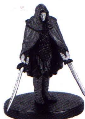
HUMAN WANDERER 25 OF 80