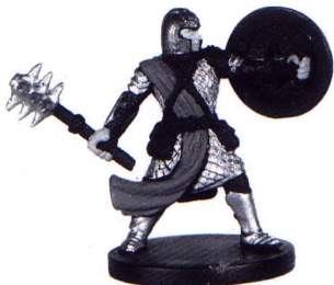
JOZAN, CLERIC OF PELOR 14 OF 80