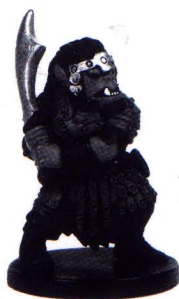
ORC WARRIOR 75 OF 80