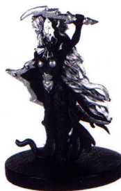
DROW CLERIC OF LOLT 61 OF 80