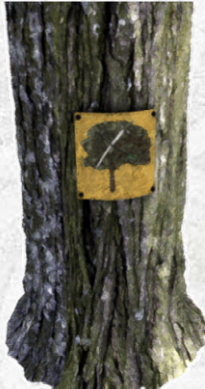
Insignia of the Scourge of Eaerlann, pinned to a tree

50 – 100 gold per day, depending on the job.