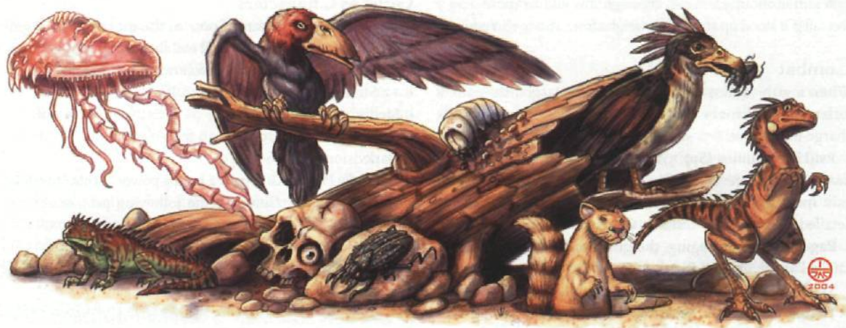
Familiars (left to right): Floater, Critic Lizard, Kes'trekel, Speckled Hurrum, Mulworm, Jankx, Ramphor, Z'tal.

psionic powers that are likewise soothing for creatures who keep them as pets.