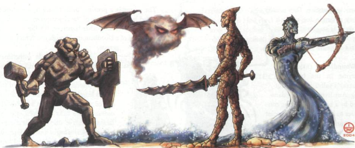
Low-Level Summonables (left to right): Cinderbrute, Cloudscout, Sandknight, Wavearcher

toward the trainer. Training a friendly cilops requires six weeks of work and a DC 25 Handle Animal check.