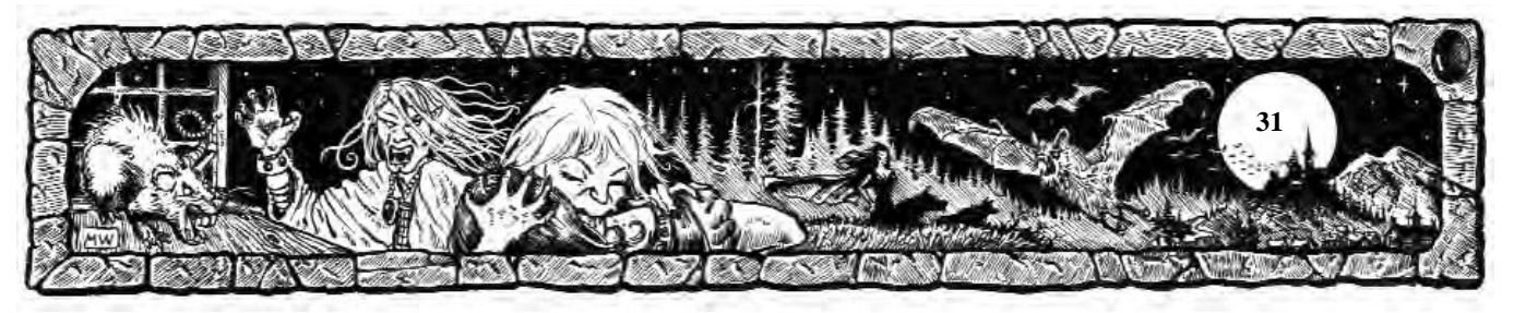
Balance is all. And there are a lot more living than undead.