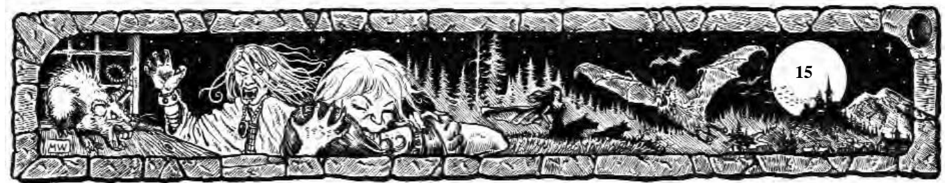
I joined them. Now I can beat them.