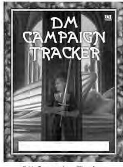
DM Campaign Tracker GMG9700 $4.99

Complete Guide Series Drow GMG3006 $11.00 Rakshasas GMG3005 $12.99 Dragonkin GMG3008 $14.99 Also available: liches, beholders, treants, wererats, doppelgangers, and more!