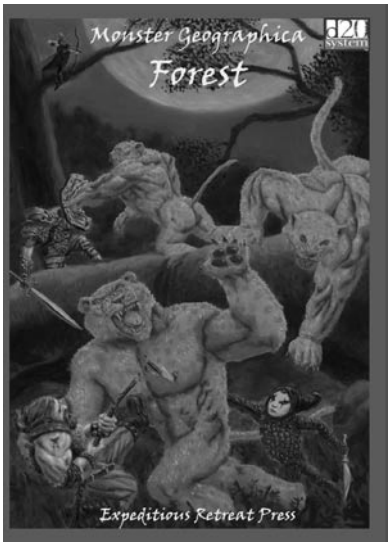
Coming in April 2005

XRP3002 Monster Geographica: Underground XRP3003 Monster Geographica: Marsh & Aquatic