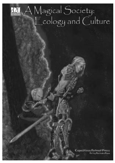
"This is a must have for home brewers and people who want their worlds of fantasy to seem real."