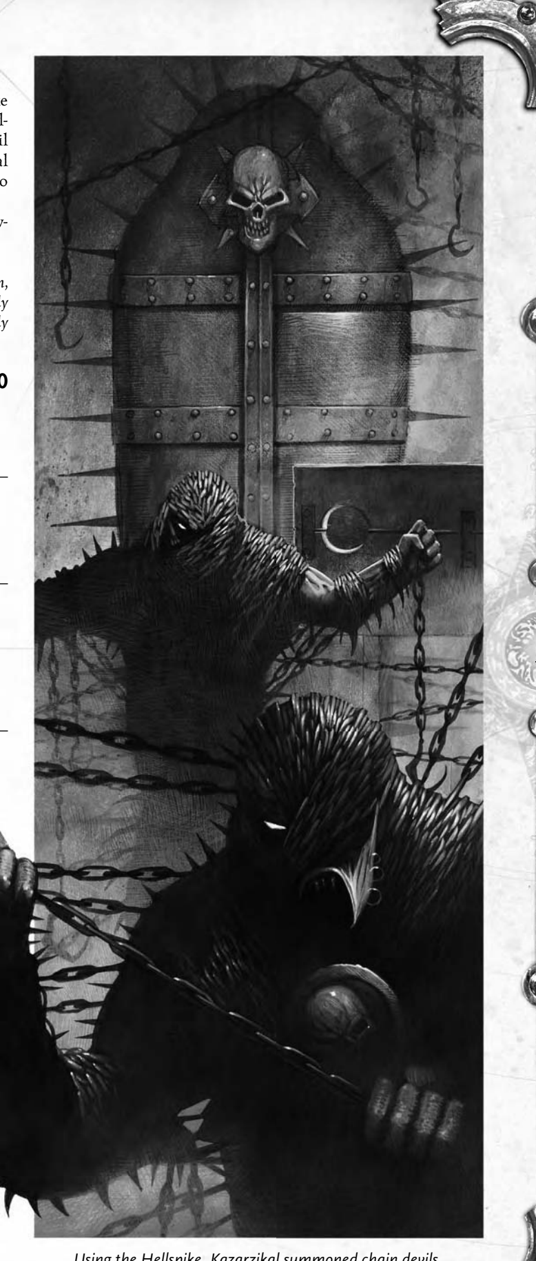
Using the Hellspike, Kazarzikal summoned chain devils to defend his keep

Creatures: In an act of cruel irony, Zencelada the chain devil has been partially transformed into a chain herself. She is furious at her imprisonment and eager to attack any creature she can reach, except for other chain devils. Her lower body is a thick iron chain connected to a massive iron ring in the center of this chamber; however, she has enough slack to move anywhere in her room