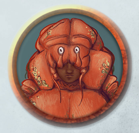
KOURA, SHAMAN OF THE ALDANI TRIBE

In stark contrast to these ruffians are aldani shamans. Magic is uncommon and mistrusted by the aldani, due to their curse. However, the few shamans among their people demonstrate its usefulness. Simple spells such as mold earth, druidcraft, and shape water are used to manage their aquaculture complexes and villages by performing more dexterous tasks than claws would otherwise allow. You can roleplay Koura, the shaman, as a wise and caring individual, who acts for the good of the community and is able to see outsiders as more than simple