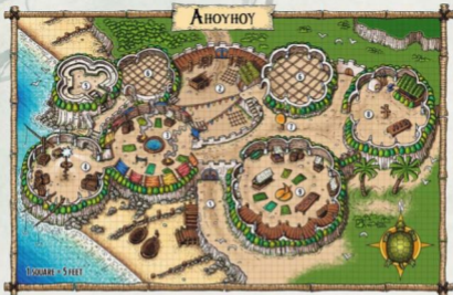
MAP 2: AHOYHOY