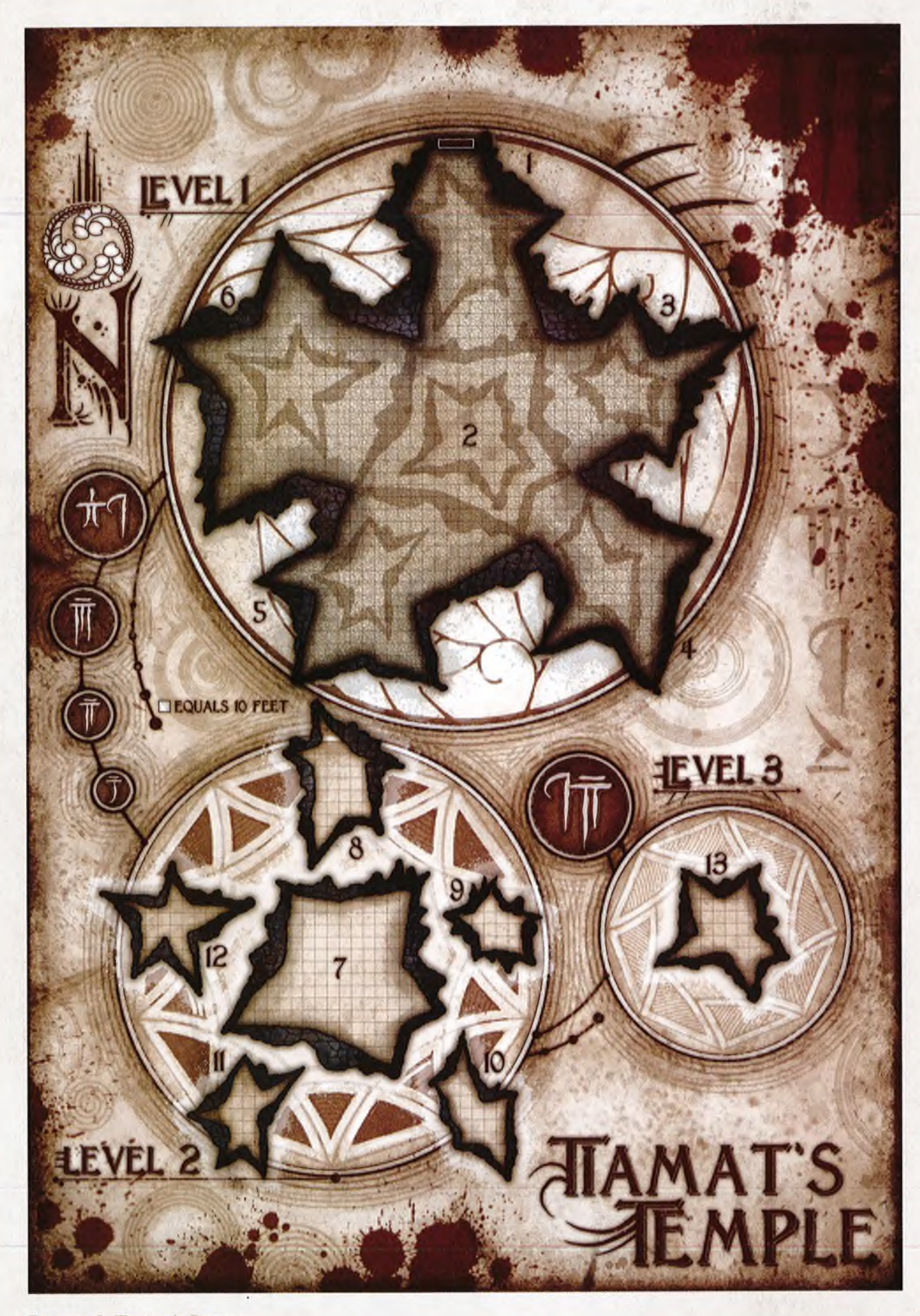
EPISODE 9: TIAMAT'S RETURN