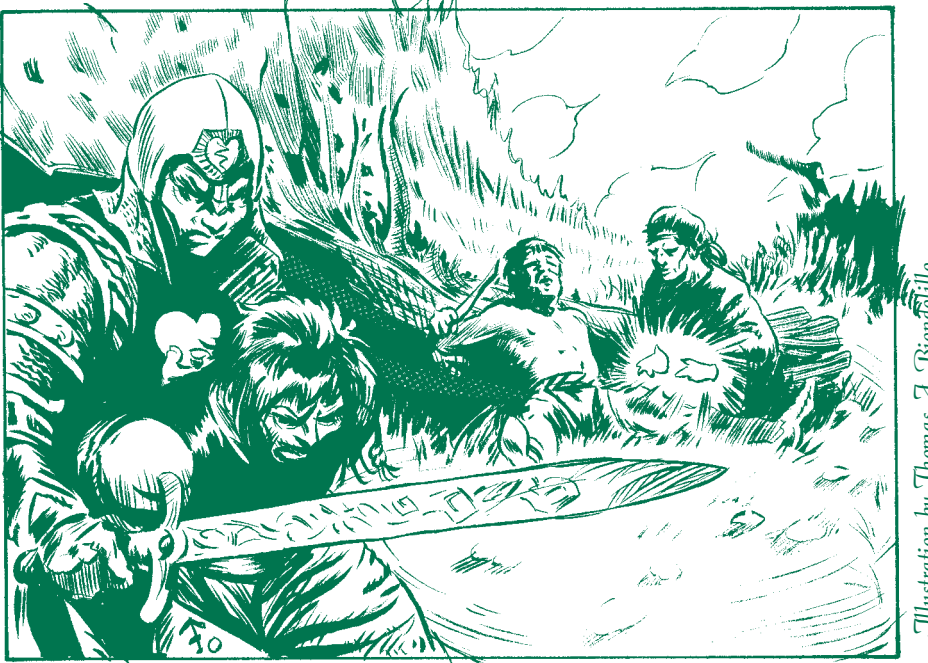
Illustration by Thomas J.

Goldmoon asked that someone within their ranks invent a structure through which the most experienced among them could take permanent command duty or protect the missionaries.