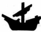
RED STEEL® Swashbuckling Fantasy Setting