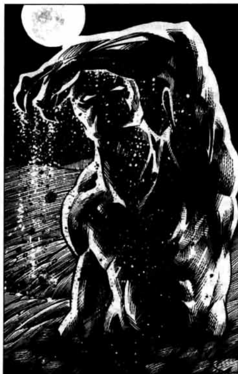
Sand Warriors: AC 5; MV 15; HD 2; #AT 1; THAC0 18; Dmg 1d10; SW Take double damage from water-based attacks; SZ M.