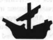
RED STEEL® Swashbuckling Fantasy Setting