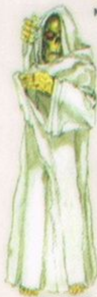
EYE OF FEAR AND FLAME