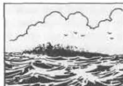
Island exploration entries, p. 17