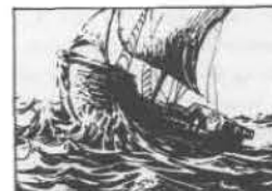
Voyage entries, p. 25