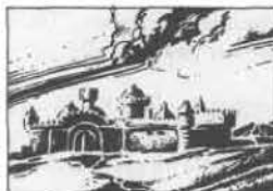
Specularum entries, p. 12