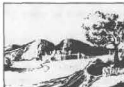
Urban entries, p. 16