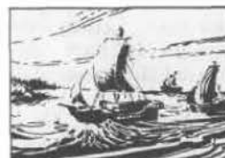
Trade route entries, p. 23