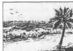
Coastal entries, p. 22