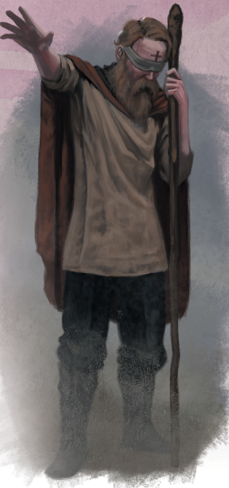
a Dozen SHOCKING BETRAYALS • PAGE 11

To make things a little more complicated, you can introduce Ekizian to the heroes in an earlier session, perhaps introducing him as a beggar who the adventurers take pity on. Each time they return to the city, they may encounter the man, who eventually starts to share rumors and information with the group. Such a build-up will make the betrayal all the more surprising for the heroes on the night the man leads them into the alley.