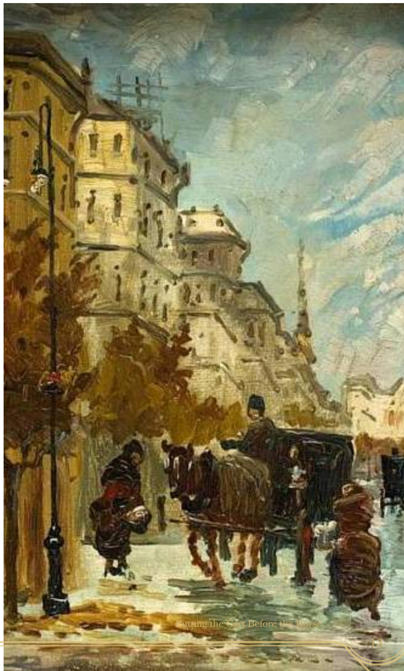
Putting the Cart Before the Horse

If the PCs get 200 feet ahead of their pursuers, they can shoot down a narrow alley and escape their pursuers. If their pursuers incapacitate the PCs before they can escape, the PCs are captured (see Conclusion).