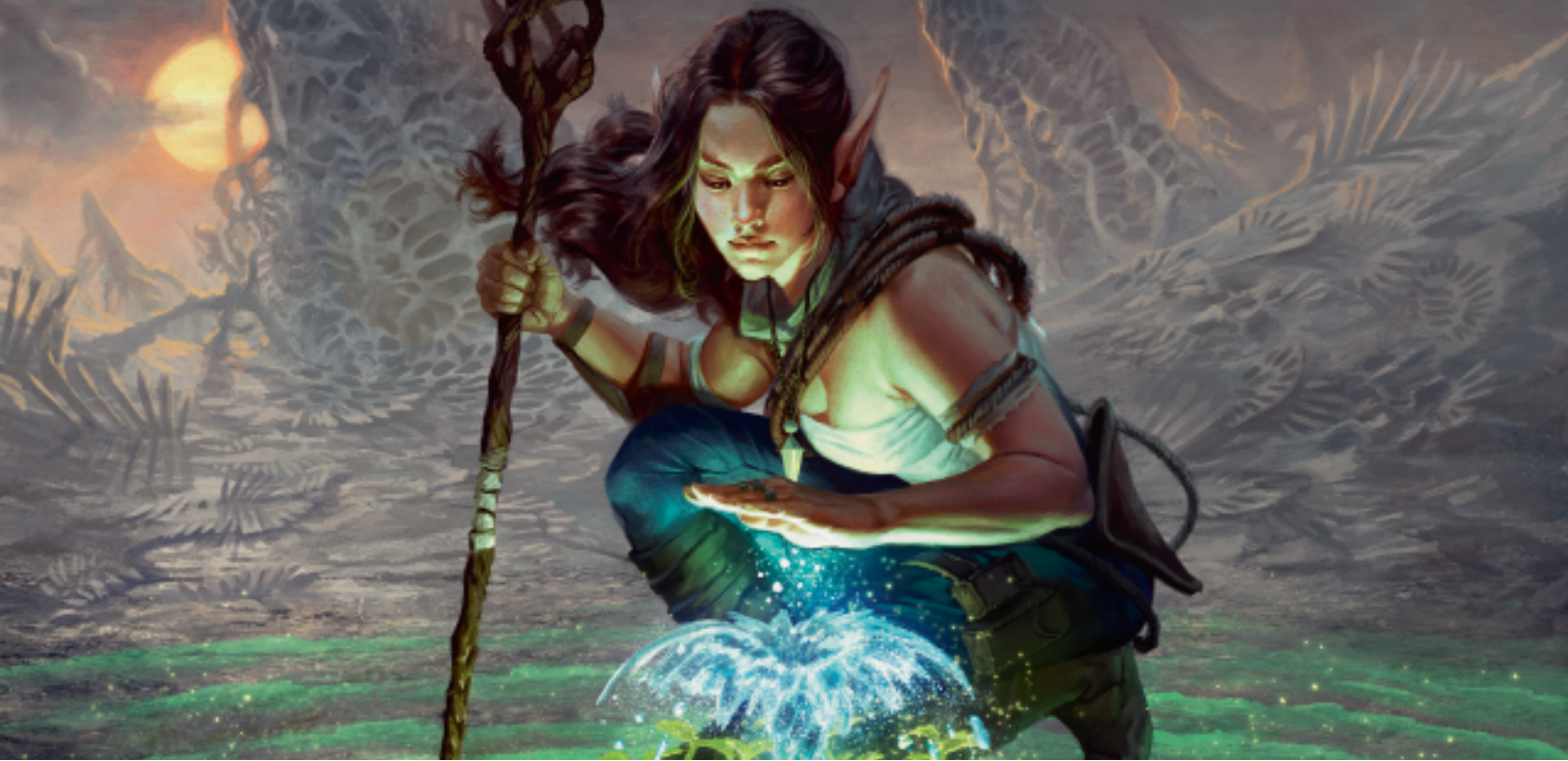
Lifespring Druid © William Murai

other parts of Zendikar as hundreds of far-flung clans. Tajuru elves are the most open to people of other races, seeing their skills and perspectives as valuable new tools for survival. The Tajuru are also more open to new lifestyles, be it living in a mountaintop citadel or roaming grassy plains.