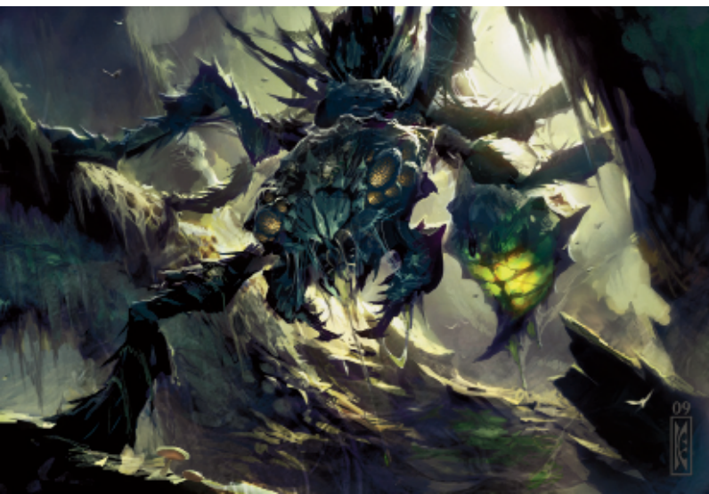
Caustic Crawler by Raymond Swanland

The black mana that brews and festers in Zendikar's swamps infuses a wide variety of natural animals, creating large, deadly vermin—rats, bats, insects, scorpions, and spiders that spread death and decay with their bites, stings, or caustic saliva. The swamps of Guul Draz are home to many such creatures, from the enormous heartstabber mosquitoes (best represented with stirge statistics) to giant scorpions large enough to hold a struggling vampire in one claw. The gigantic, ant-like caustic crawlers (similar to ankhegs ) shape burrows from stone with their acidic saliva, creating strangely smooth walls easily mistaken for ancient construction. Gloomhunter bats the size of griffins have reservoirs of vaporous mana in their heads, causing their bite to tear at the spirit as well as the flesh. These and other creatures can be built from the offerings in appendix A of the Monster Manual .