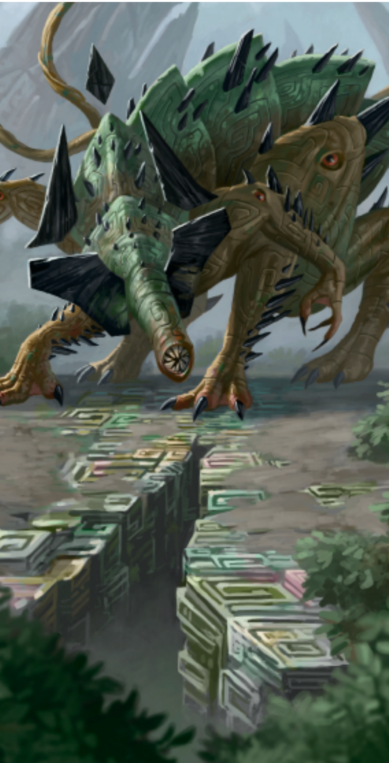
Eldrazi Mini © Craig J. Spearling

The best way to represent Eldrazi in D&D terms is to adapt a variety of monster statistics to reflect the diversity of these creatures. Almost any demon