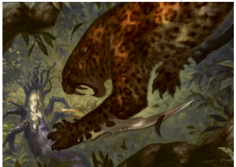
Scythe Leopard ▶ Winona Nelson

Timbermaws dwell in the hollow trunks of strange floating trees, emerging with deadly speed when prey wanders near. (The grick statistics can represent a timbermaw, adjusting its stone camouflage trait to hide it in the woodlands.) And at least two varieties of great cat (similar to the saber-toothed tiger ) sport enormous blades jutting back from the forelegs, which help them cut through heavy undergrowth and take down much larger prey.