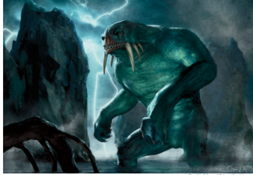
Shoreline Salvager

A gomazoa might be represented by the roper statistics in the Monster Manual , with a flying speed of 10 feet in place of its walking and climbing speeds.