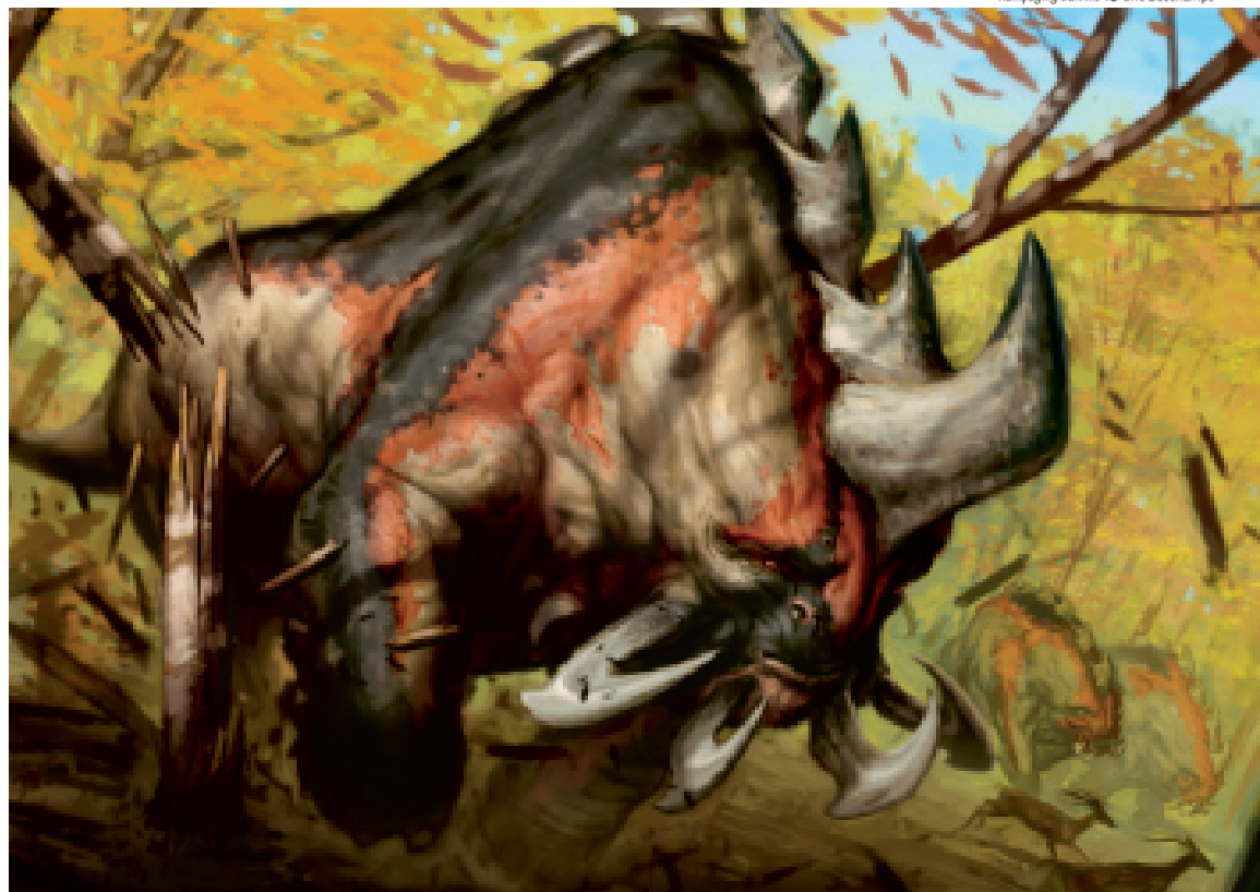
Rampaging Baloths Eric Deschamps

Basilisks are six-legged lizard-like reptiles with large horns and long tails. A creature that meets the gaze of a basilisk turns instantly to stone. They are common in the wooded regions of Guul Draz as well as the Turntimber forest of Ondu. Use the basilisk statistics in the Monster Manual for Zendikar's basilisks.