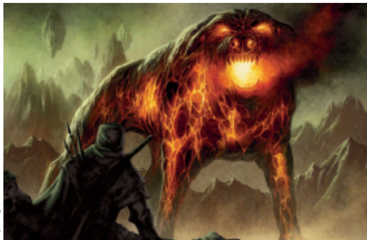
Hellfire Mongrel

Avatars are rare beings similar to elementals. They are aspects or projections of a larger, abstract power, which might be anything from the looming shadow of death to the soul of Zendikar itself. These powerful beings can be represented by some of the most powerful monsters in the Monster Manual —a demilich , perhaps, or an empyrean , or even the tarrasque .