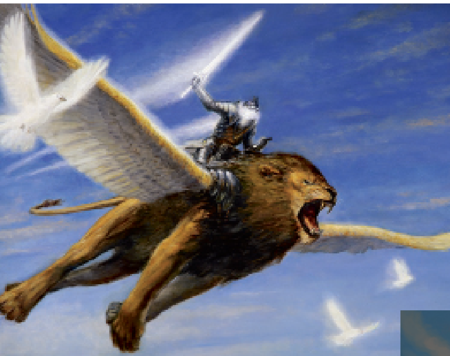
Archon of Redemption © Steven Belledin