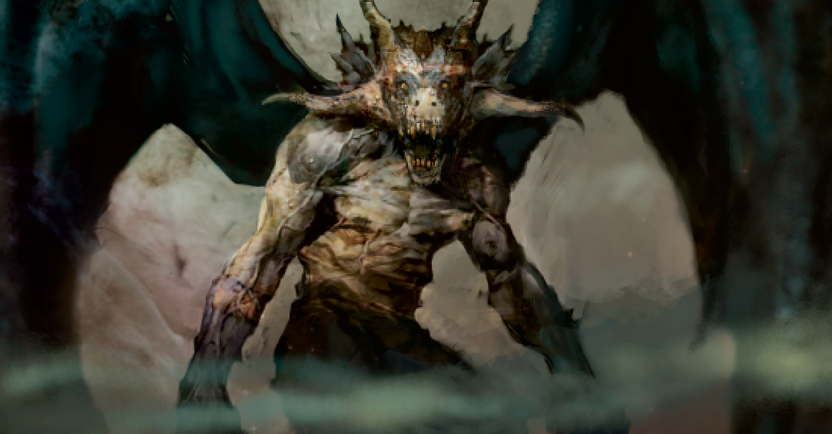
Pestilence Demon by Justin Sweet