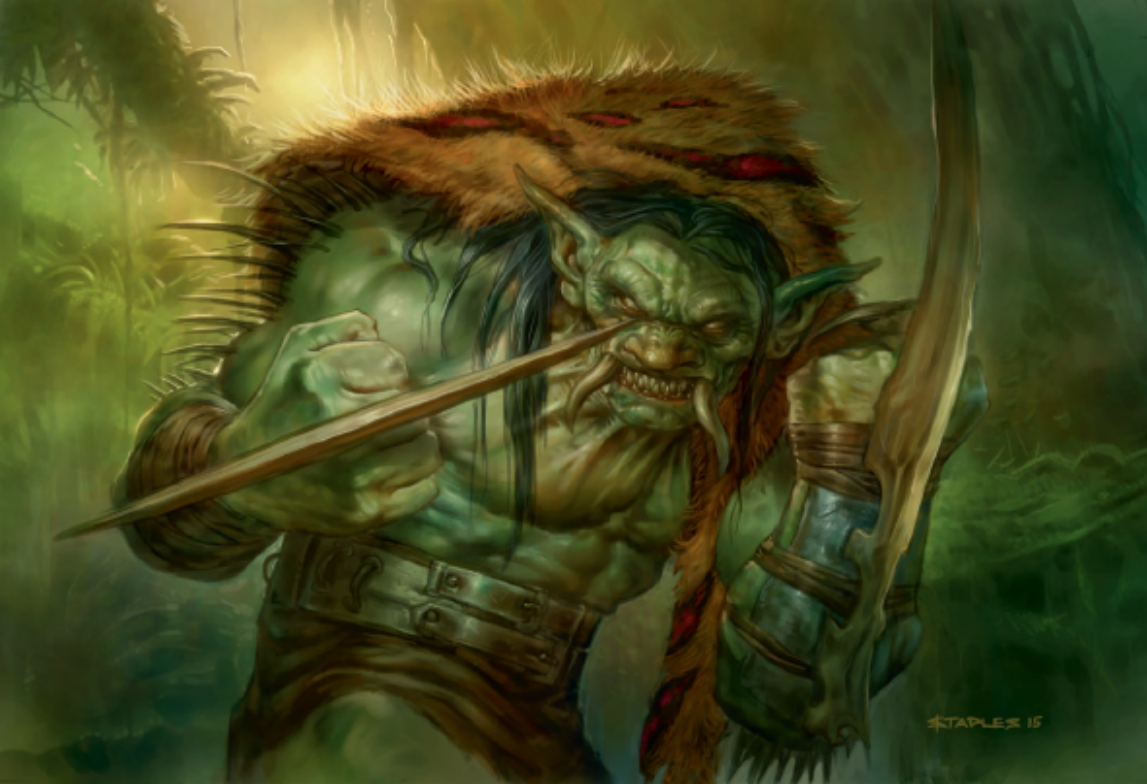
Harvester Troll Greg Staples