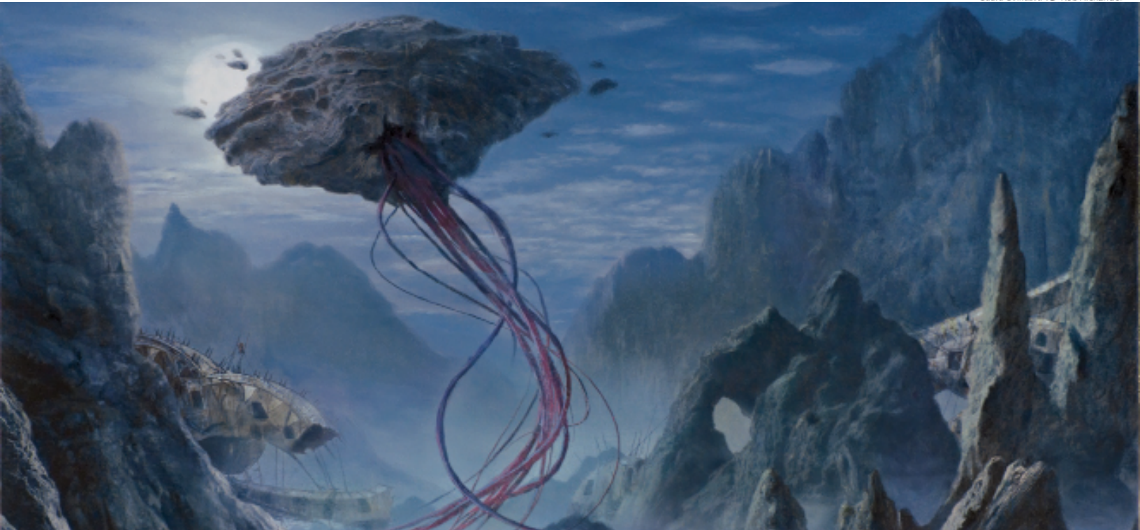
Guard Gomazoa

The oceans, bays, and swamps of Zendikar are home to a variety of aquatic creatures that are at least as deadly as those on land, including monstrosities that can face the largest Eldrazi on almost equal footing. Given the dangers of Zendikar, even mundane animals such as octopuses, frogs, turtles, crabs, and crocodiles can grow to tremendous size (using the appropriate statistics from appendix A of the Monster Manual ). The crabs of Ondu, the crocodiles of Guul Draz, the tortoises of Tazeem, and the octopuses of the deep sea (of which Lorthos the Tidemaker is but one giant specimen) are examples of these aquatic monstrosities. Enormous shoal serpents—sometimes compared to “a reef that runs aground on ships”—are a persistent danger to vessels along the Onduan coast. The plesiosaurus in the Monster Manual can represent these serpents.