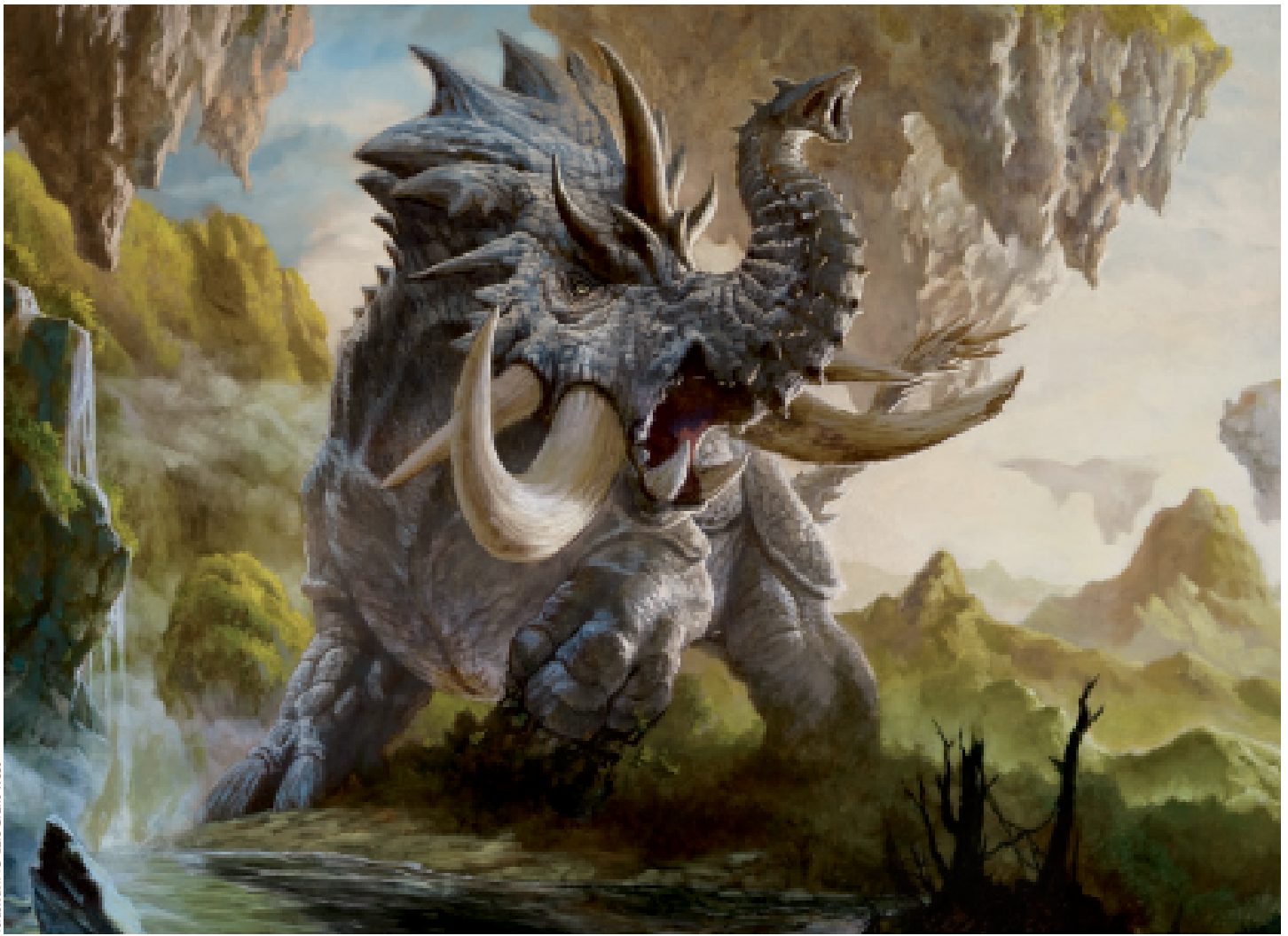
Terastodon ▶ Lars Grant-West