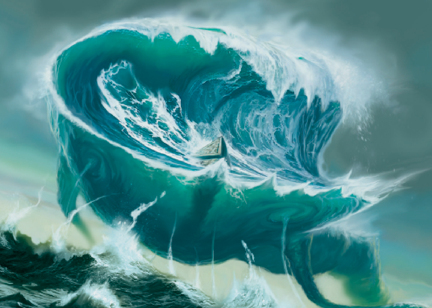
Living Tsunami ▶ Matt Cavotta