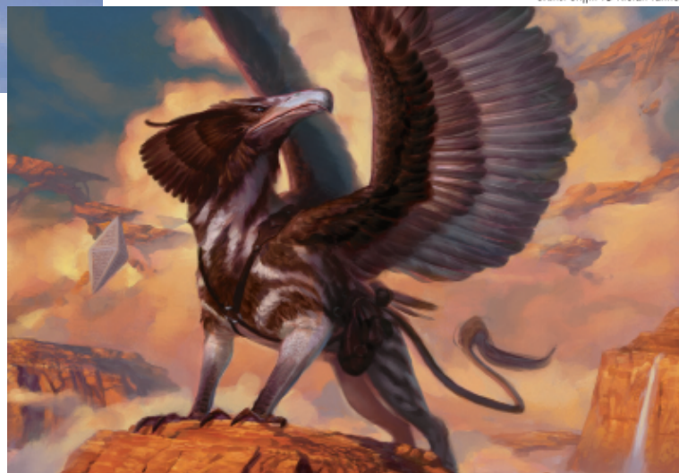
Courier Griffin

Zendikar's griffins are much like D&D's griffons (aside from the spelling) and hip-griffons.