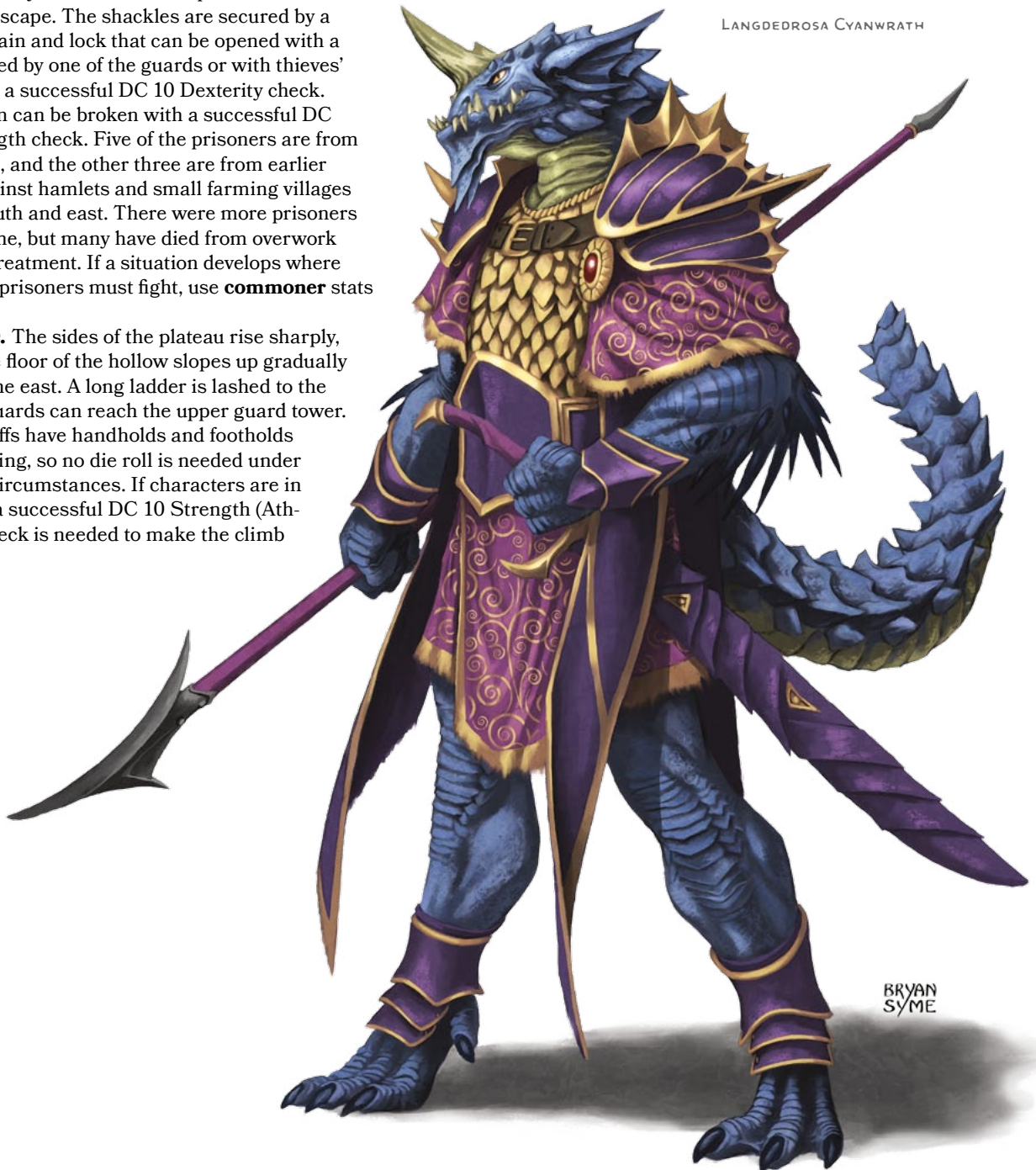
LANGDE ROSA CYANWRATH

Tents. The raiders live in circular huts made from closely spaced wooden or bone poles covered in hide, mud, and sod. Huts vary in diameter from 10 feet to 25 feet, and in height from 5 feet to 10 feet. (Symbols on the map represent clusters of tents.) Those in the mouth of the hollow (level 1 on the map) are crudely built and decorated with animal skulls. These are occupied by kobolds. Cultists occupy the huts on level 2, which are sturdier, cleaner, and decorated with painted designs representing dragons. A few tents on level 2 are set