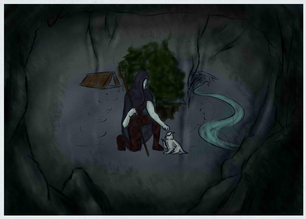
FIGURE 1: NORTH WALL