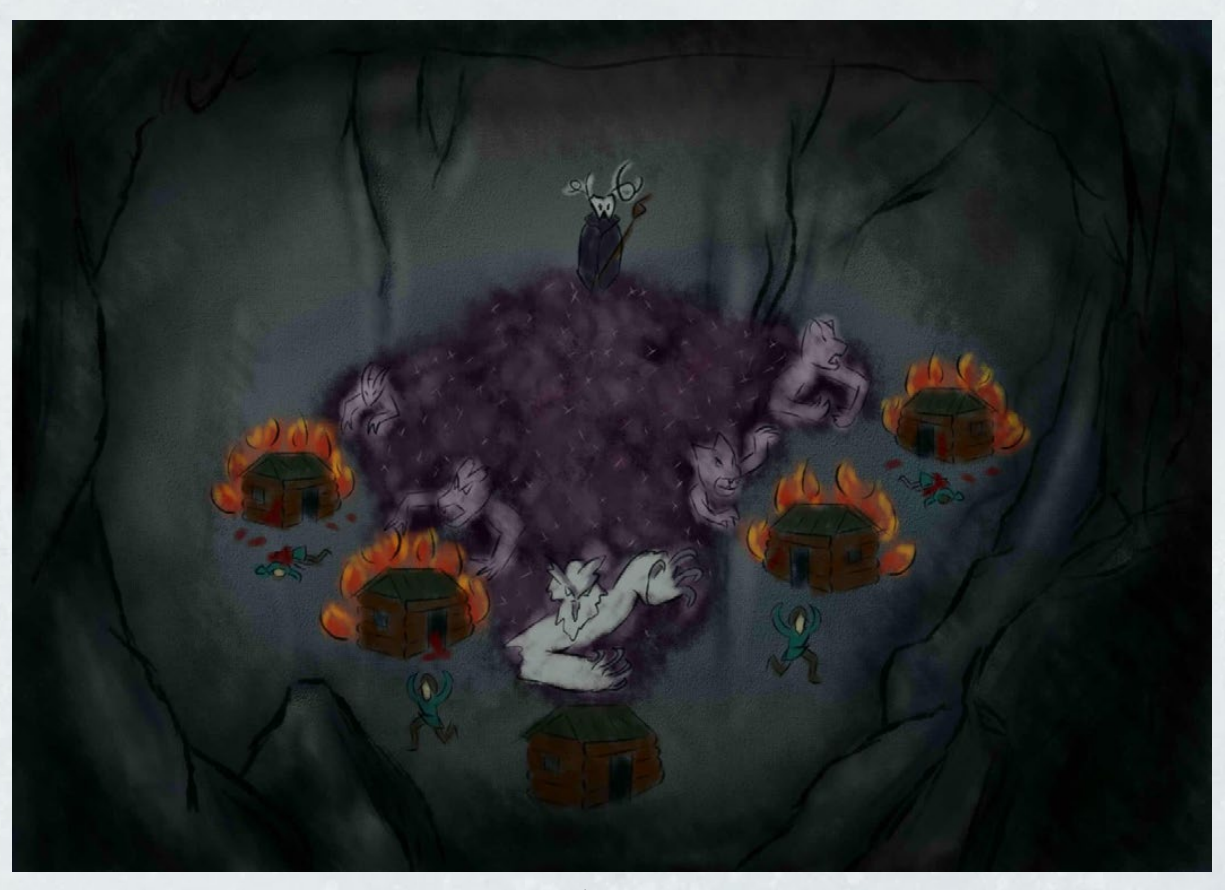
FIGURE 4: WEST WALL