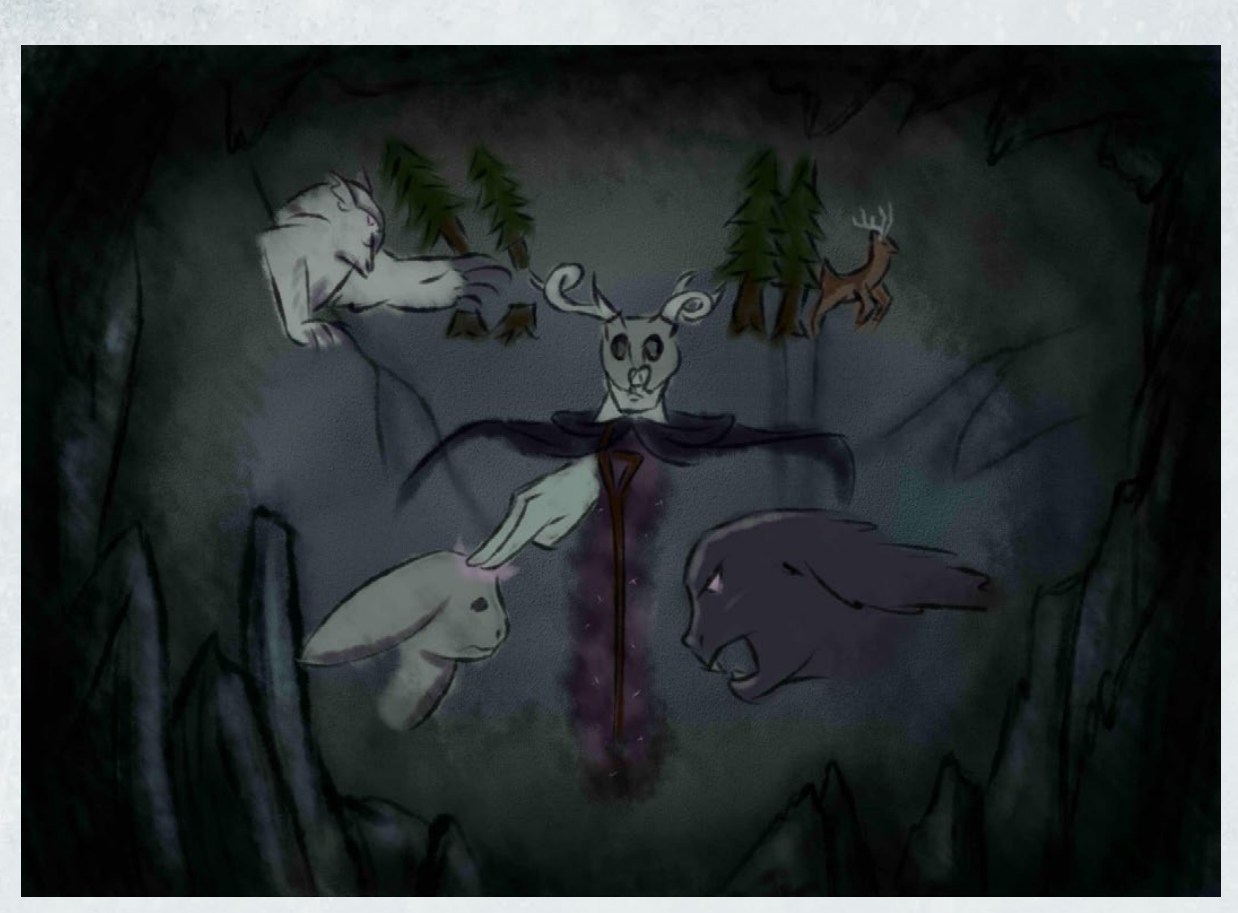
FIGURE 3: EAST WALL