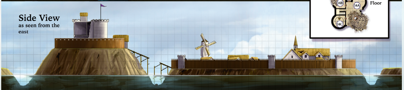
MAP 1.1: NIGHTSTONE