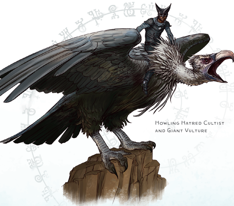
HOWLING HATRED CULTIST AND GIANT VULTURE

The cult fanatics are named Amarath and N'von. They speak for the rest of the group and claim to speak on behalf of Yan-C-Bin as well. Amarath and N'von wish to make contact with a cloud giant and have no interest in dealing with anyone else. If the characters get in the way, the cultists ignore them and call out for master of the tower. If the characters get pushy or turn violent, the cultists attack them.