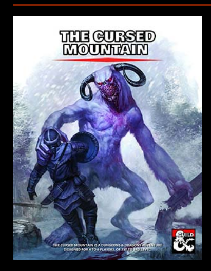
THE CURSED MOUNTAIN