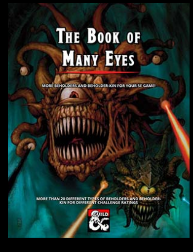
THE BOOK OF MANY EYES