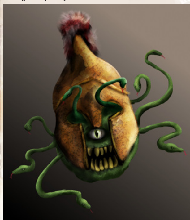
On the cover: A strange snake-headed beholder dons a helmet and prepares for battle in this painting by Vall Syrene.