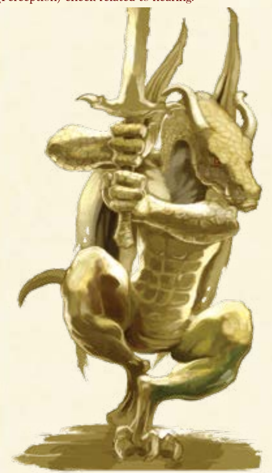
24 5TH EDITION ROLEPLAYING

ENHANCED HEARING: Gnomes have keen ears, often likened to those of a fox. No one knows whether this is due to gnome physiology, or if it is because gnomes are such close observers of their environment. Gnomes receive advantage on any Wisdom (Perception) check related to hearing.