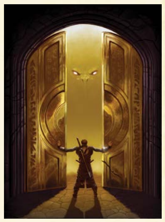
PLAYERS GUIDE TO AIMRDE C7

The spell requires a relic of a hero of the caster's faith; the hero must have died honorably. The hero must be dead, so using the relic of one who has been resurrected will not work.