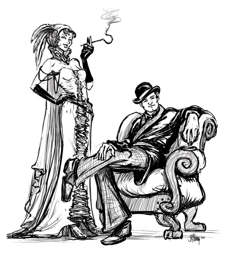
Hit Points at Higher Levels: 1d8 (or 5) + Constitution modifier per socialite level.

Hit Points at 1st Level: 8 + Constitution modifier