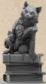
Sonya, Maine Coon Fighter