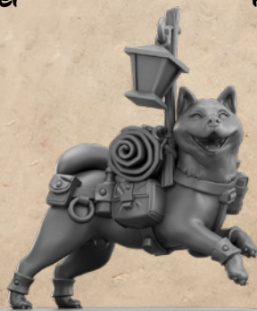
Kai, Shiba Inu Ranger