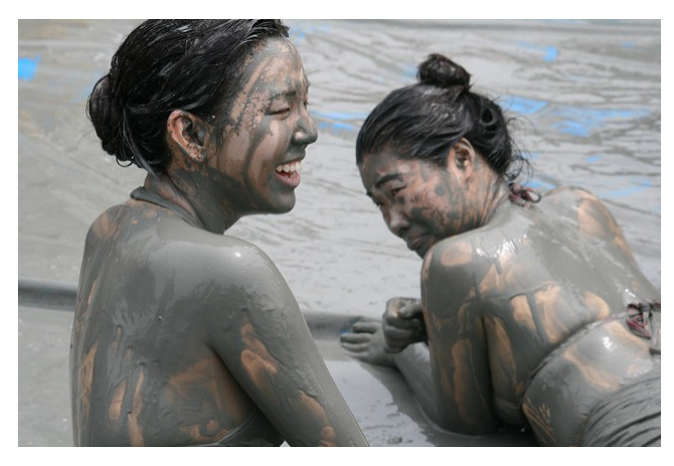
A given culture may use wrestling train, entertain, or solve disputes. Mud wrestling can be as formal or informal as the occasion calls for. Matches can be central events of tournaments, festivals, or weekend antics.

At the GM's option, "no magic" may be more a guideline than a rule. In this case, the crowd may not notice or mind when spellcasters use spells to enhance their own wrestling capabilities (such as mage armor, barkskin , and enhance ability ). Crowds may even cheer appropriate and thrilling supernatural feats, such as enlarge/reduce , Divine Smite, or Wild Shape!