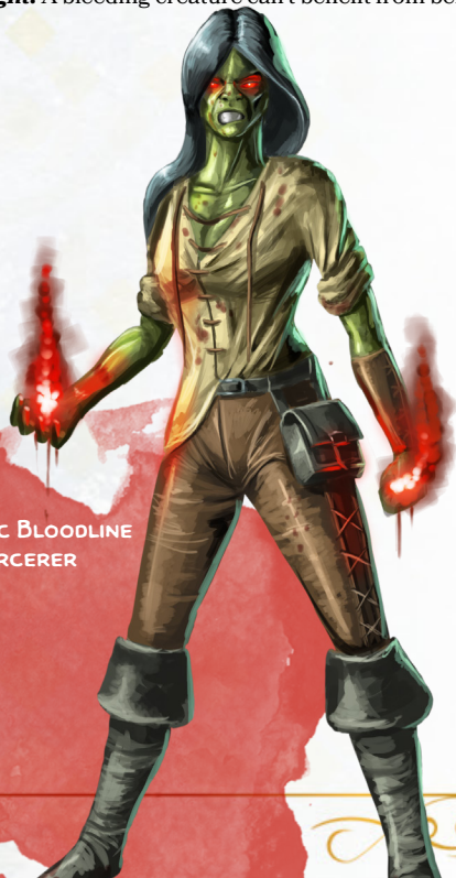
VAMPIRIC BLOODLINE SORCERER

Sanguine Sight. A bleeding creature can't benefit from being invisible to you.