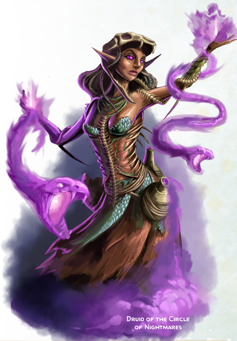
DRUID OF THE CIRCLE OF NIGHTMARES

Withering. You cause the target to dream of dust and the slow decay of time. The target must make a Wisdom saving throw. On a failed save, roll a d10. The target ages a number of years equal to the number rolled and you take the same amount of necrotic damage. This damage can't be resisted or reduced in any way.