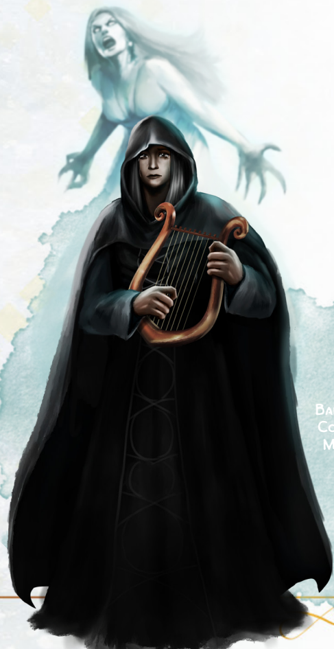
BARD OF THE COLLEGE OF MOURNING

Once you use this feature, you can't use it again until you finish a long rest.