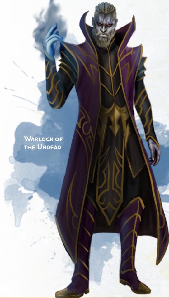
WARLOCK OF THE UNDEAD

While your pact skull is on your person, icy breath routinely escapes from behind its single row of teeth. While holding the skull, you can cast revivify by expending a warlock spell slot, vaporizing the skull in the process. If a creature is brought back to life in this manner, its eyes glow with a subtle green tinge for 24 hours.