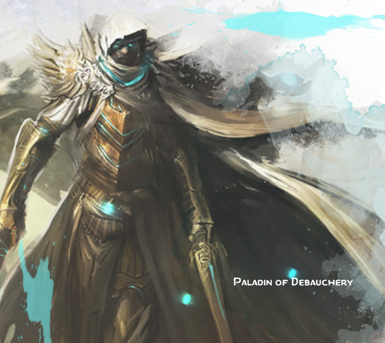
PALADIN OF DEBAUCHERY

Beginning at 27th level, when under the effects of your Channel Divinity: Viciousness, your damage rolls always count as their maximum value, but the damage rolls of creatures that target you also count as their maximum value.