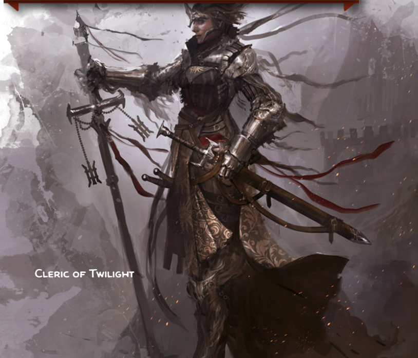
CLERIC OF TWILIGHT