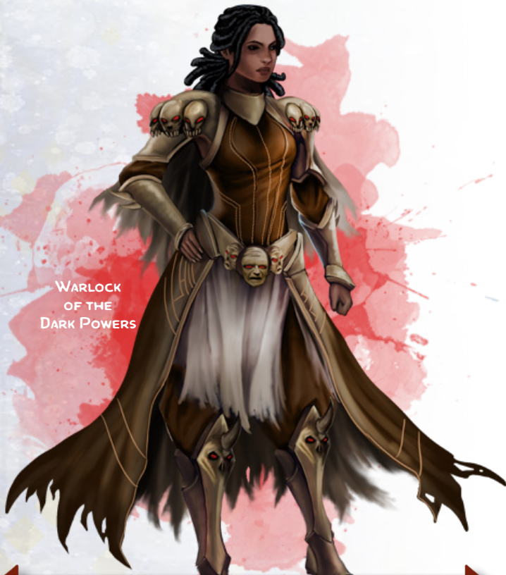
WARLOCK OF THE DARK POWERS

Starting at 25th level, while your pact skull is within 600 feet of you, two tiny, swirling, green embers glow subtly in the center of each of its otherwise hollow eyes. While the embers glow, you can cast flame strike as a 9th level spell centered on the skull without expending a spell slot or material components, causing the skull to vaporize. The resulting flames are green in color.