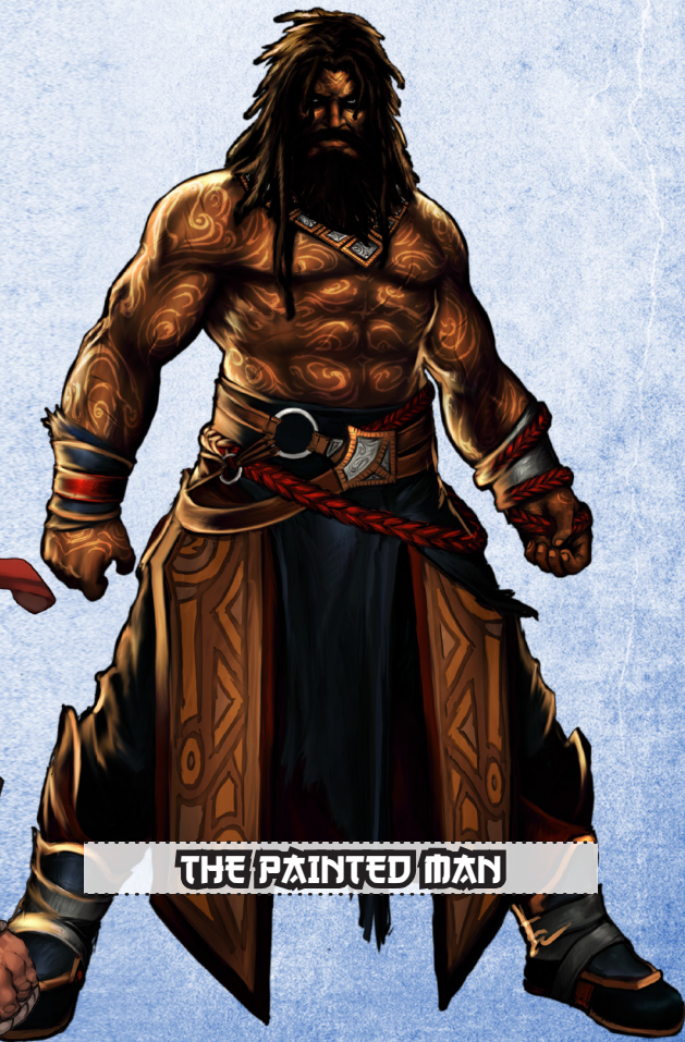
THE PAINTED MAN