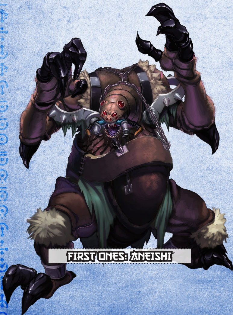
FIRST ONES: ANEISHI

The war escalated too swiftly for the shocked Imperial Senate to stop it. Partisans of the Dominion and the Protectorate both insisted the Senate refrain from