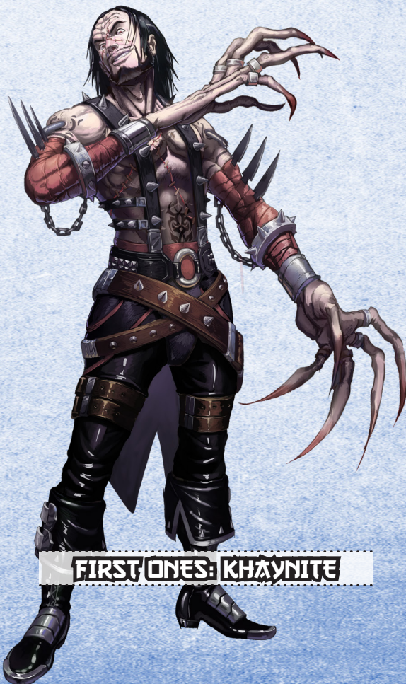
FIRST ONES: KHAYNITE

Another threat came from the tribes of Sametia, which had grown since the end of the Twilight War, honing their fighting skills as mercenaries and partisans. Rebuffed from "civilized" Exodus, they embraced barbarism and united under a code of untrammelled might and savagery. Calling themselves the Janus Horde, they fought amongst themselves for position, but fought all others for vengeance, glory, and plunder.