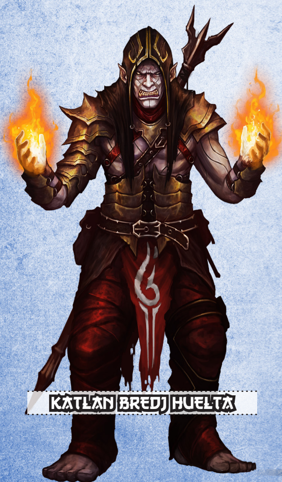
KATLAN BREDJ HUELTA

The armies met south of Baargon. Darai arrayed the core of his in the clearing, keeping the rest of his army hidden to disguise its size. Xoltec threw the brunt of his force against this line, expecting it to fold as others had, but the Baargon infantry and Arman mercenaries held the line. At the same time, Darai sent enuka scouts to fall upon the Xehitoch army's flanks. The Brotherhood fell back in disarray, thinking they were under attack by a larger force. During the retreat, Prince Xoltec was slain and Euhudi was captured.