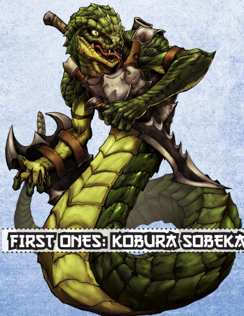
FIRST ONES: KOBURA SOBEKA