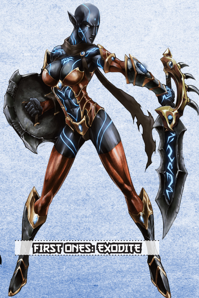
FIRST ONES: EXODITE