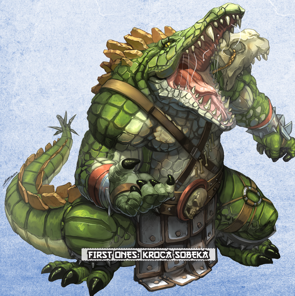
FIRST ONES: KROCA SOBEKA

In 82 AU, Princess Mercy Eland arrived in Qijom. Ranked among Exodus's greatest beauties, she quickly won Prince Malik's affections. The two were as