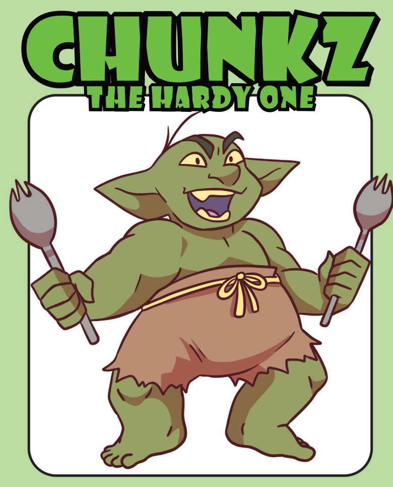
Chunkz is the largest and toughest of the goblin gang, and capable of happily eating anything. He's exceptionally greedy.