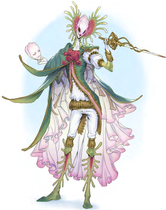
Illustration by Rich Carey