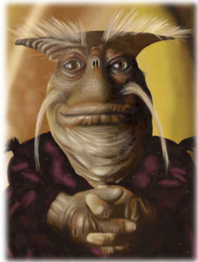
Illustration by Kristy