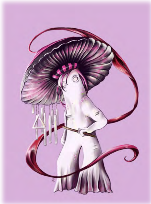
Illustration by Cecelia Collette