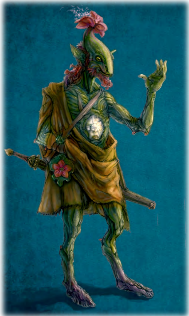
Illustration by Jan Pospisil