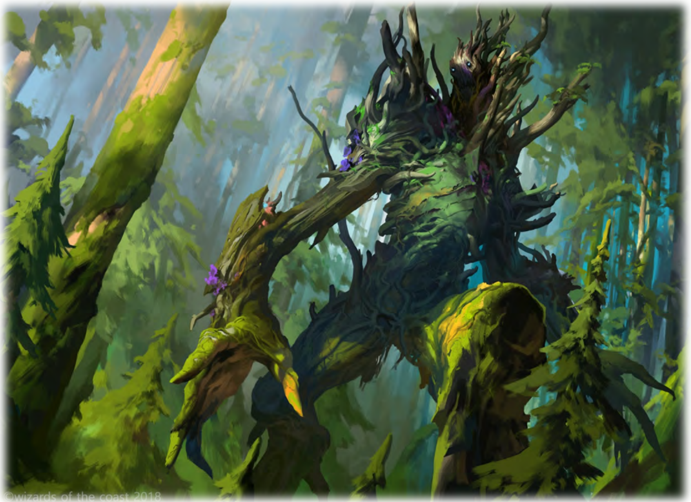
Illustration by Viktor Titov