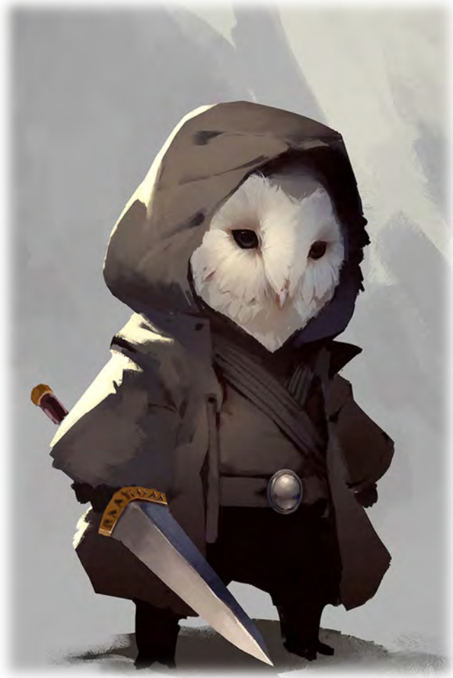
Illustration by Son Trinh