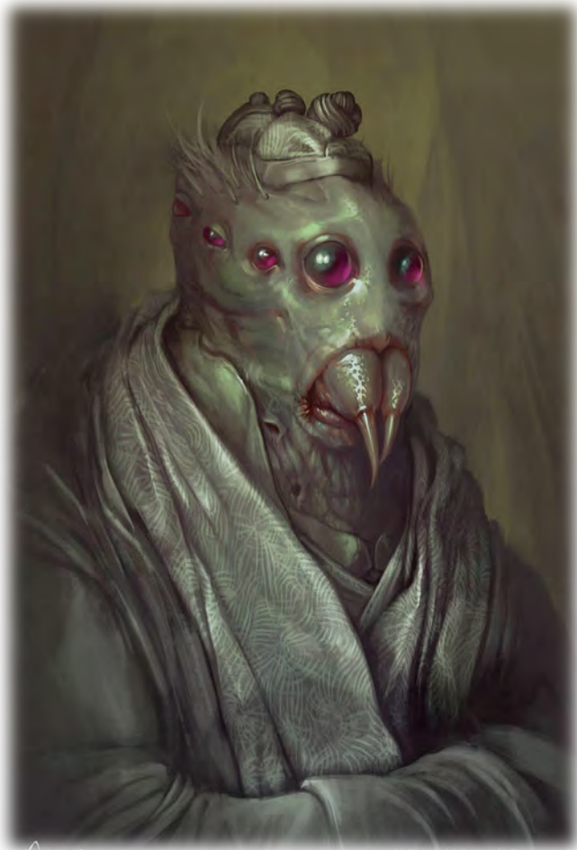
Illustration by Apertus