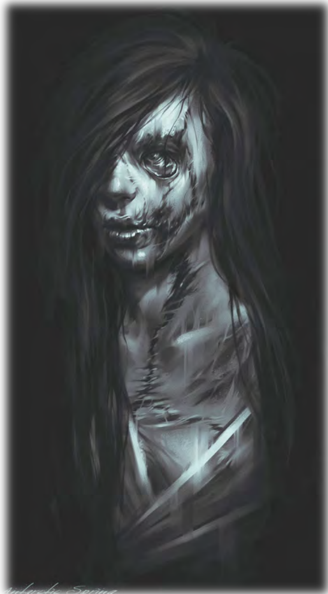
Illustration by Antarctic Spring