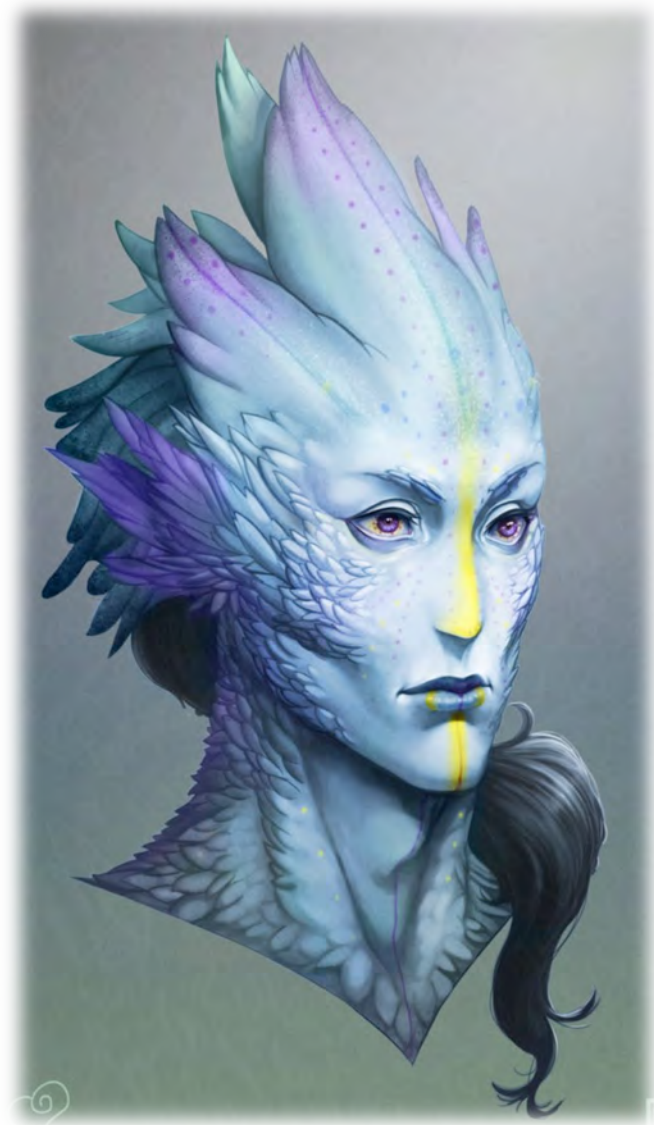
Illustration by Ama & Nova