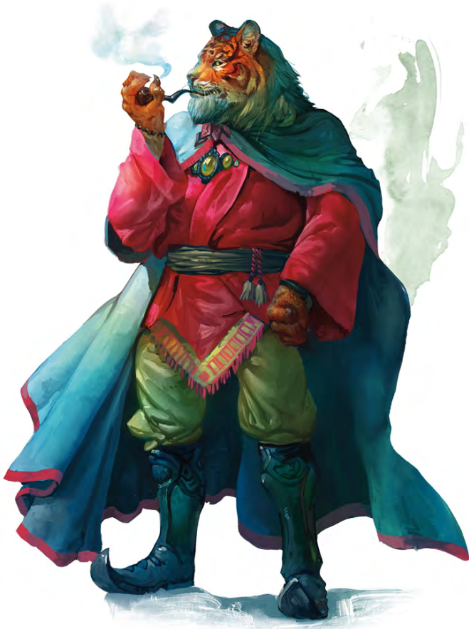
Illustration from the Monster Manual