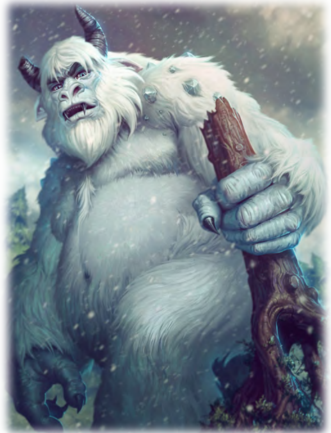
Illustration by Jon Neimeister

Subrace. Choose one of the following subraces: Yeti , or Sasquatch .