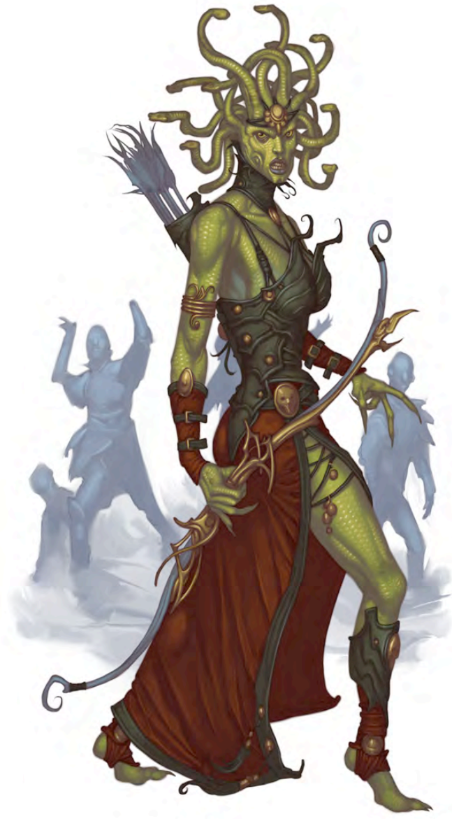
Illustration by R.K. Post