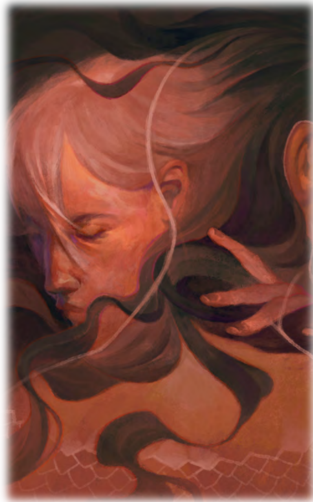
Illustration by Lada Da