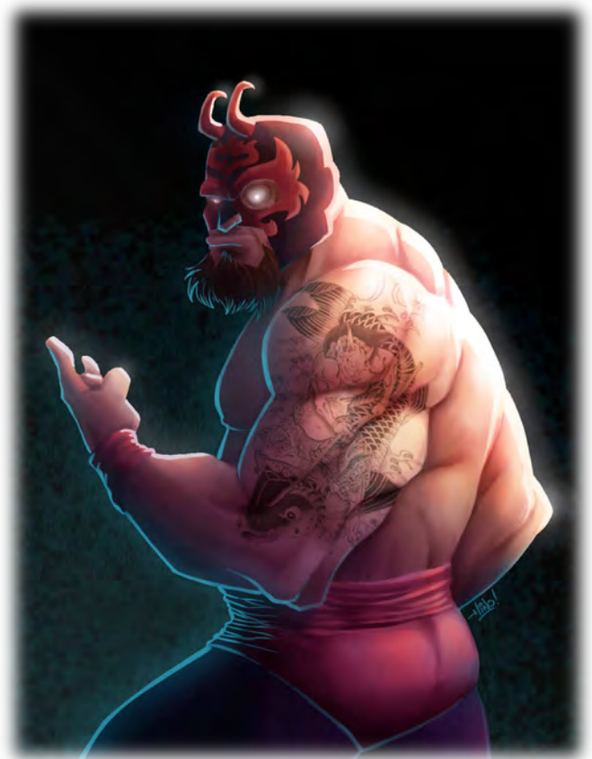
Illustration by El Hino

At 17th level, you gain the ability to make a devastating flying suplex against a creature you are grappling. When you finish a Flurry of Blows and are grappling a creature, you can spend 1-9 additional ki points to making a flying suplex with one creature you are grappling. Upon impact, the creature you are grappling takes 2d10 force damage per ki point spent.