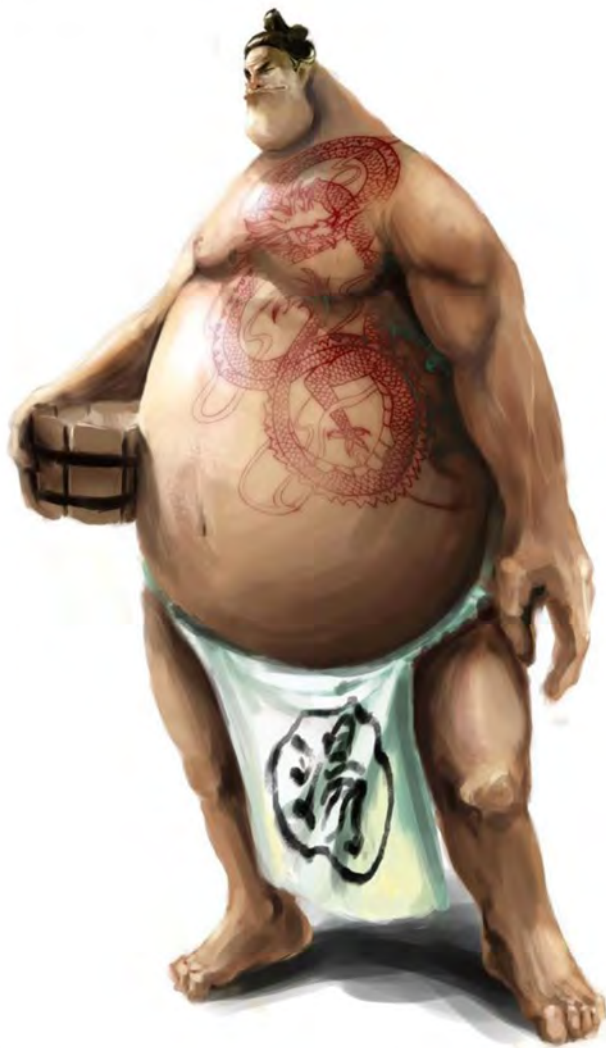
Illustration by Kobe Sek