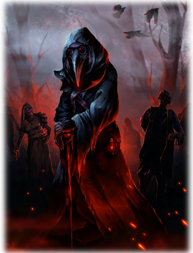
Illustration by Ilona Tsybal

Additionally, the Foresight spell becomes a cleric domain spell for you.