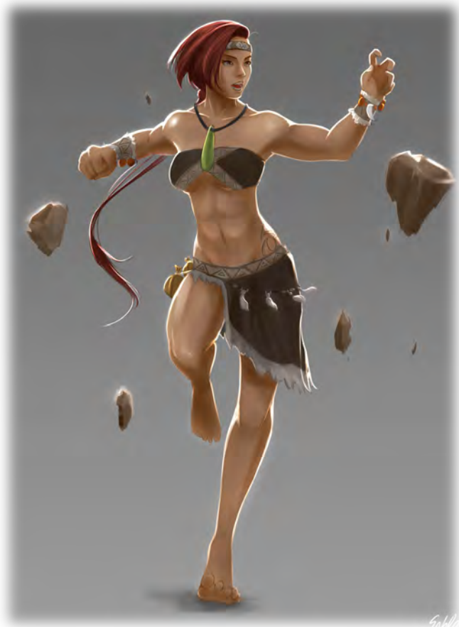
Illustration by Apipol (Sahlea) Chongjiamjit