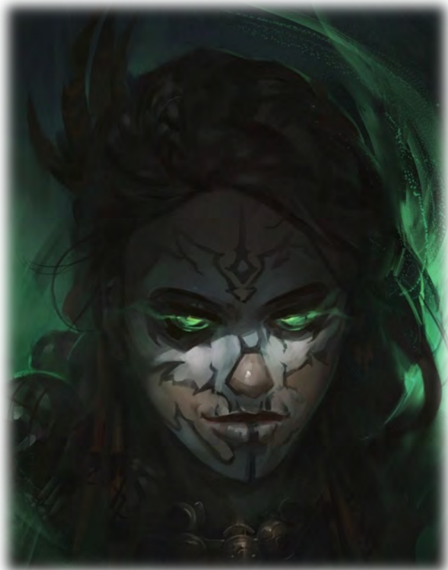
Illustration by Rafał Górnika

Once you use this ability, you can't use it again until you complete a long rest.