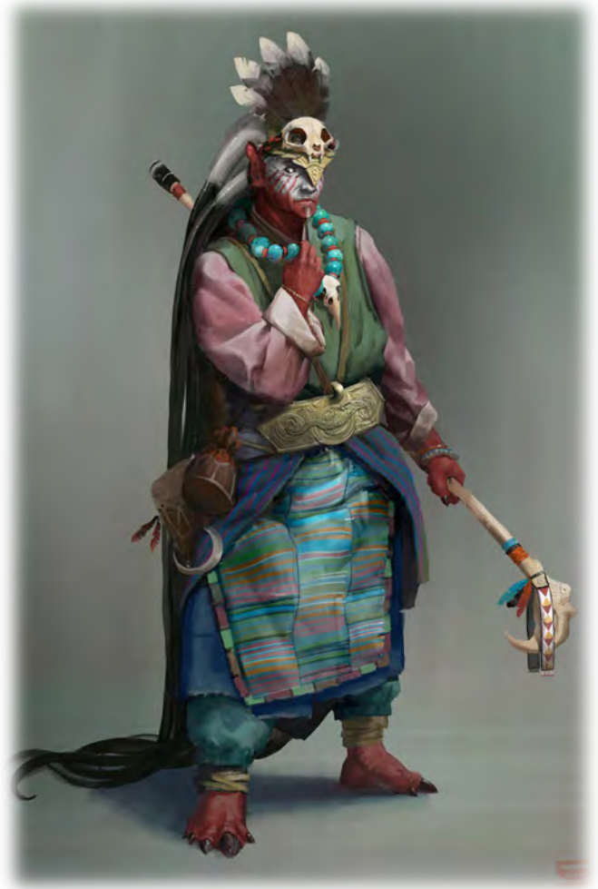
Illustration by Luc de Haan

Additionally, you can proficiency in one weapon of your choice. Usually, this is an important symbolic weapon of your people.