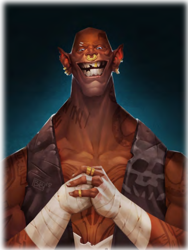
Illustration by Brad Boedeker