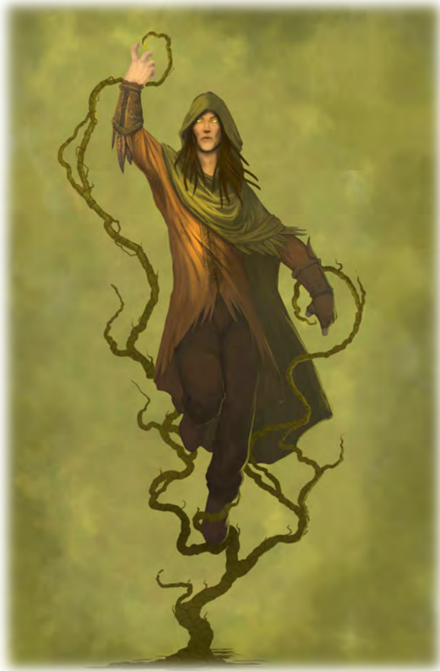
Illustration by Angelo Bortolini