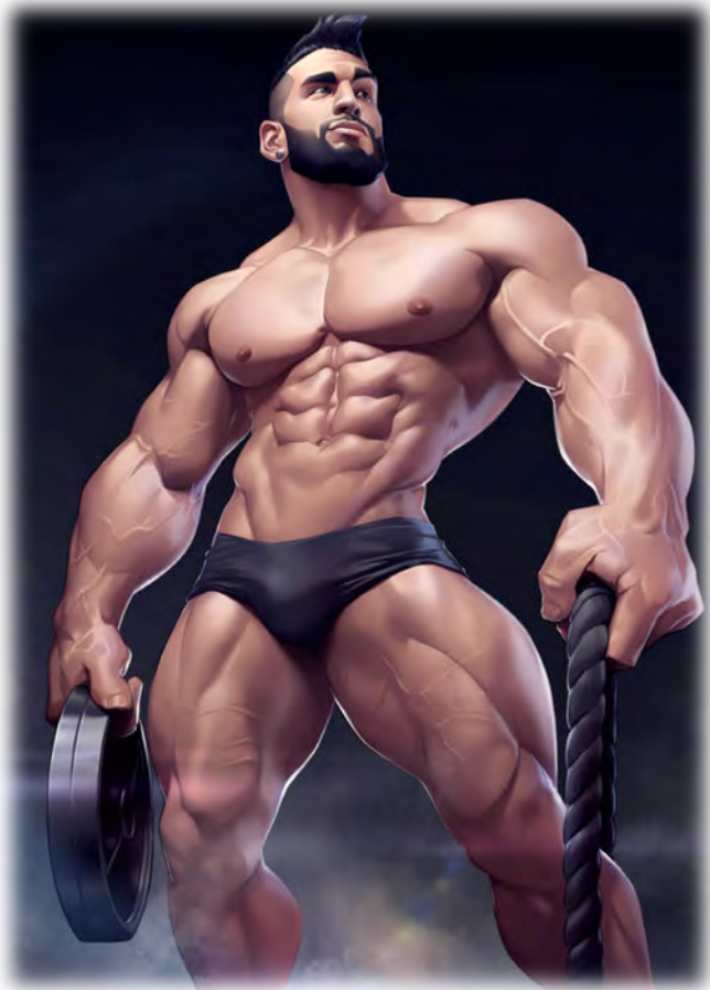
Illustration by Silverjow