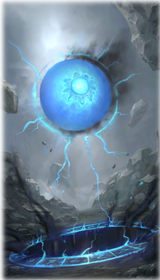
Illustration by Jordy Knoop