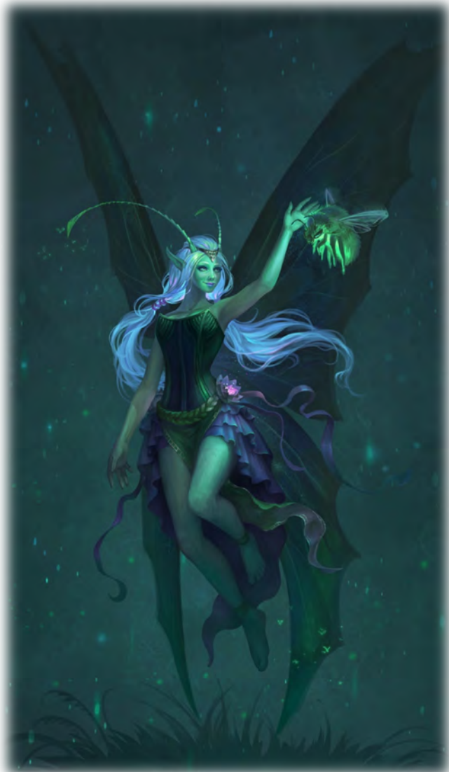
Illustration by Elvira Shatunova

At 17th level, you can make the most of a nearby opponent's failures. When a creature misses you with an attack, you can use your reaction to attack it with a Crush 'Em weapon you are holding. If it hits, you can choose to immediately perform one Low Blow against your attacker, without expending a use of them.