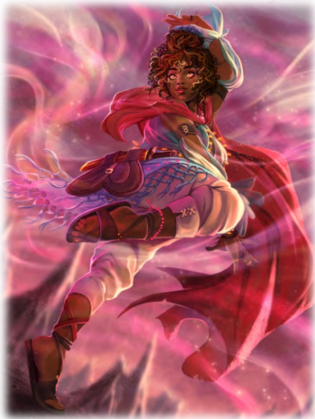
Illustration by Giovana Stiliano

A dancer's music and kinetic energy can be infectious, and others bound up in their spell find themselves dancing along with the them.