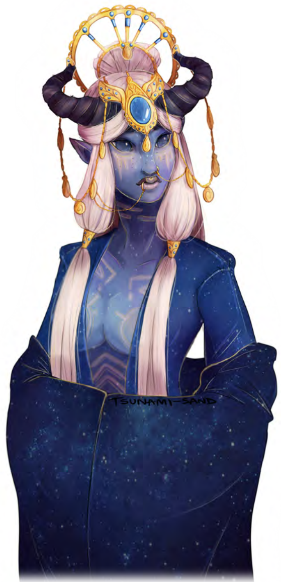
Illustration by Tsunami - Sand