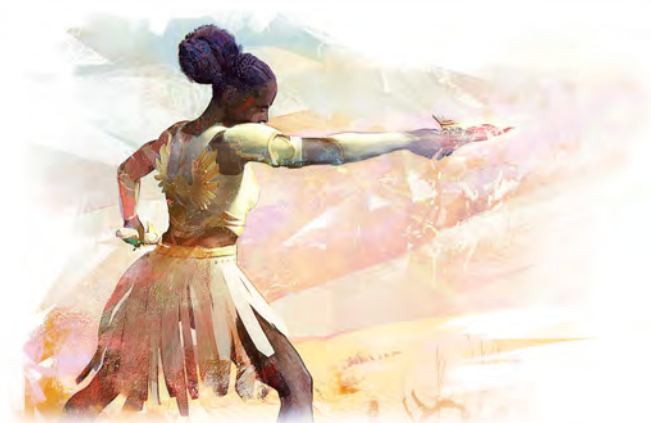
Illustration by Mohammad Qureshi