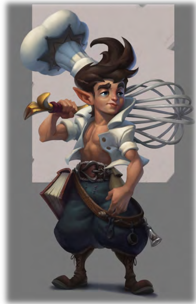
Illustration by Servando Lupini