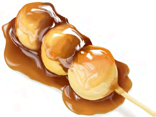
Illustration by kkzt

Conjure Barrage Create Food and Water Fireball Haste Tiny Servant XGE