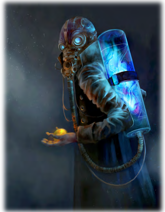
Illustration by Werecat Way

You can maintain a sense of magnetic north and the passage of time, even across the border planes: The Ethereal and Feywild and Shadowfell. You can always find your way back to where you entered the plane you are in.