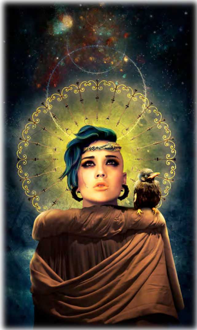
Illustration by itznikki530