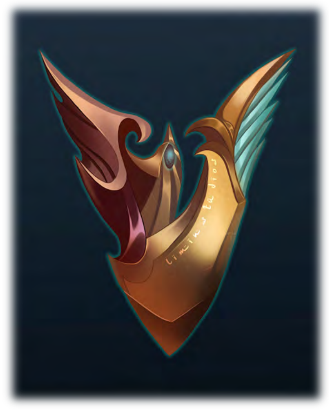
Illustration by Limin Studio