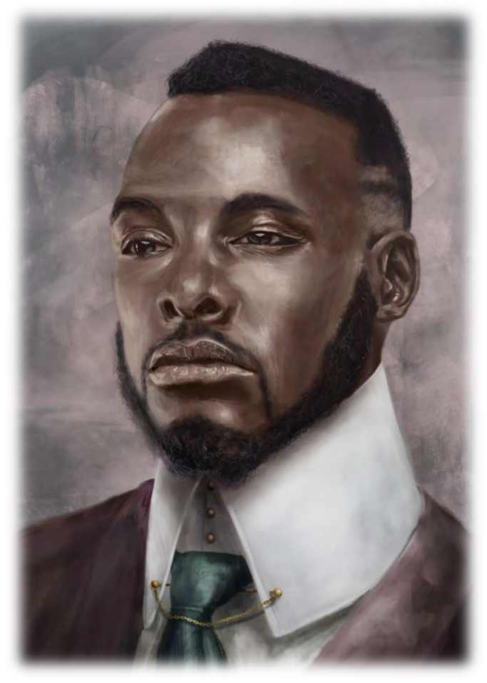
Illustration by Tom Sharp