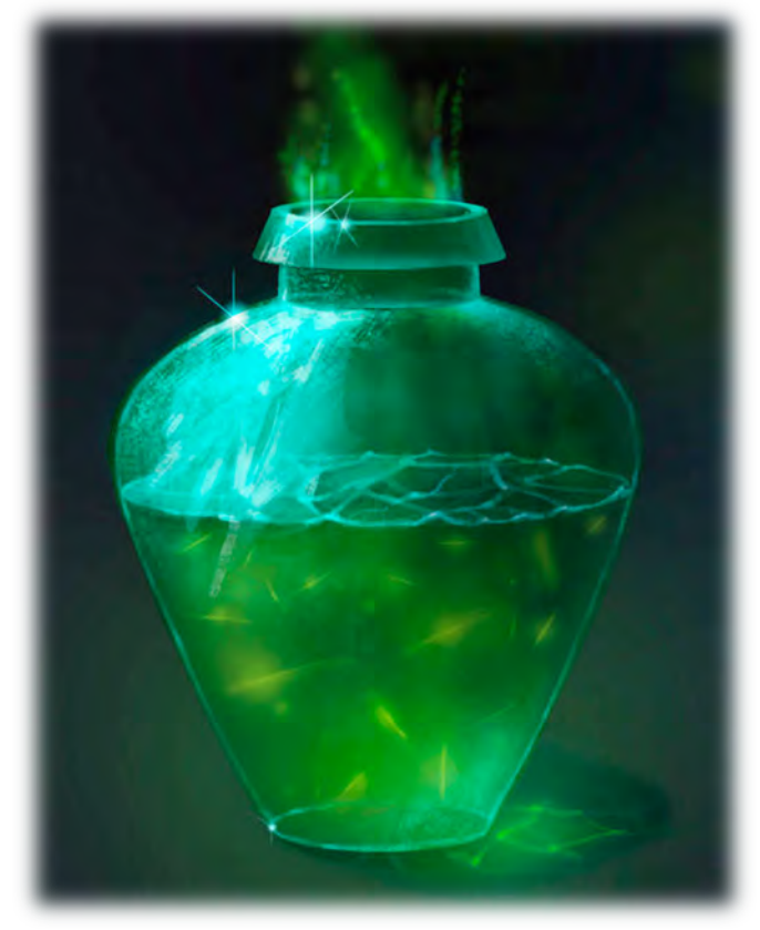
Illustration by Vertry