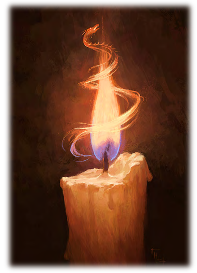
Illustration by Harkalé Linaï