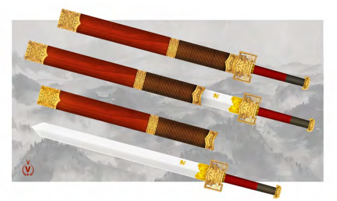
Illustration by Максим Студеникин