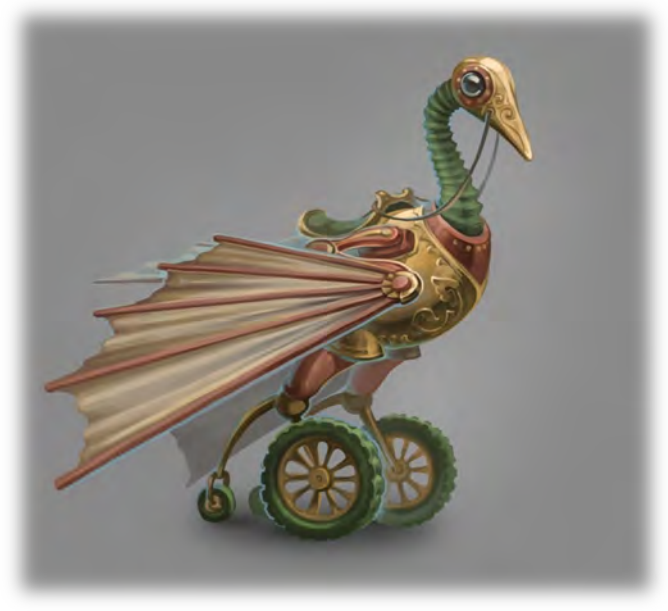
Illustration by Elvira Shatunova