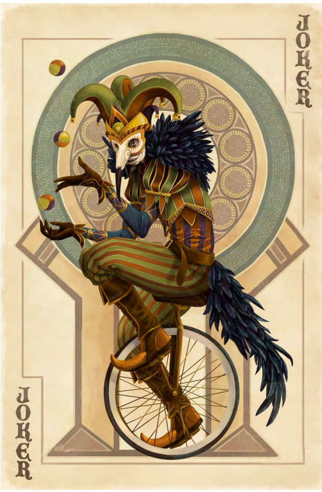
Illustration by Alix Branwyn

You know, I can't even recall where I came across the damned thing. Near as I can remember, it just showed up in my pocket one day.