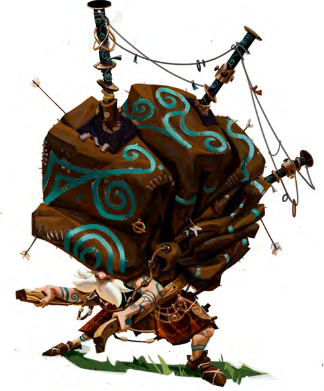
Illustration by Tom McLean

A large wooden spoon with a small red crystal affixed to the end of the handle. When the spoon is placed into a bowl or cauldron, speaking its command word will cause the spoon to autonomously mix and stir the contents at your direction. It cannot stir with more force than the Mage Hand spell is able to generate, and it ceases to function if removed from its assigned bowl or container.