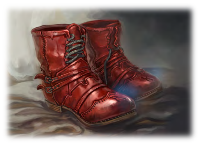
Illustration by Inkary

Windy Servant. As an action, you can spend 6 ki points to create an Air Elemental. You concentrate, as if concentrating on a spell, and for the duration, you are in complete control of the elemental, which takes its turn immediately after yours. If your concentration is broken, the elemental disappears. You can maintain concentration on the elemental for up to 1 hour, after which it dissipates. The DM has the elemental's statistics.