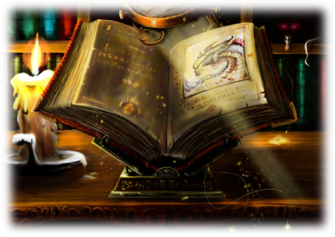
Illustration by gailee

If the avian construct is reduced to 0 hit points, it can be repaired with 50g of materials, 1 hour of labor and a successful DC 15 check made with tinker's tools.