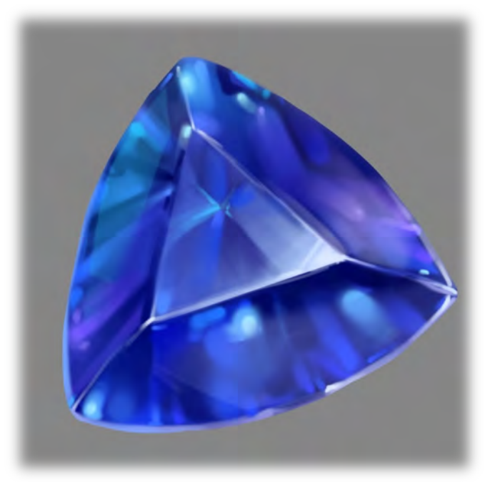
Illustration by Oxana Zelenskaya

The ring can be attuned to a single cantrip the wearer knows, increasing any damage it deals by 1.