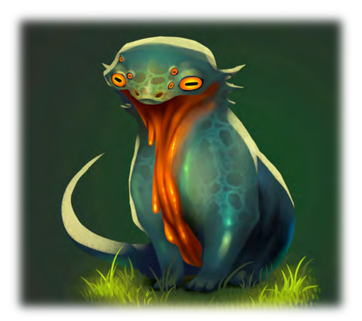
Illustration by Melody Nejad