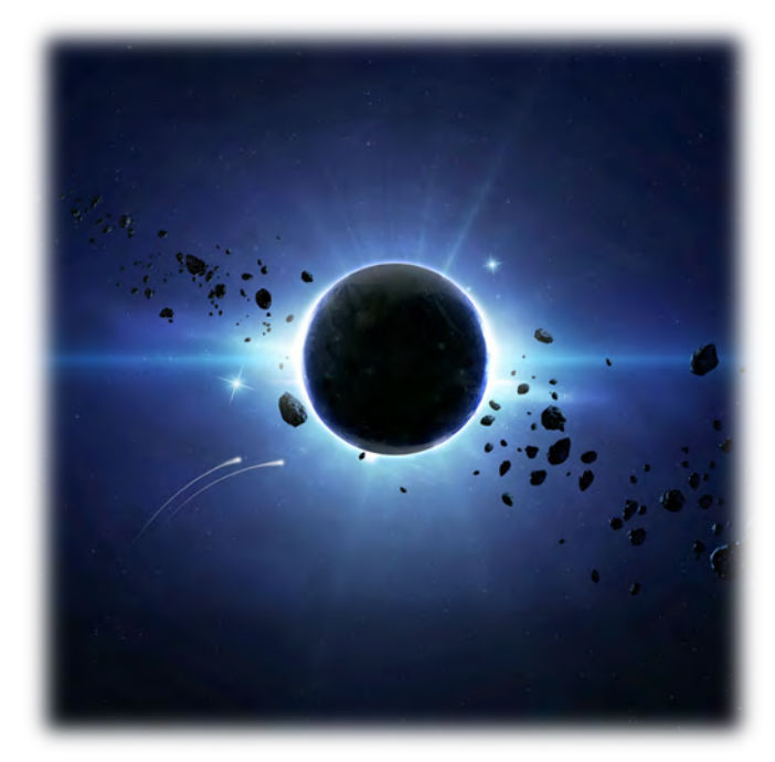
Illustration by Robert Katke

At Higher Levels. When you cast this spell using a spell slot of 8th level or higher, the radius of the cylinder increases by 30 feet and the height increases by 10 feet for each slot level above 7th.