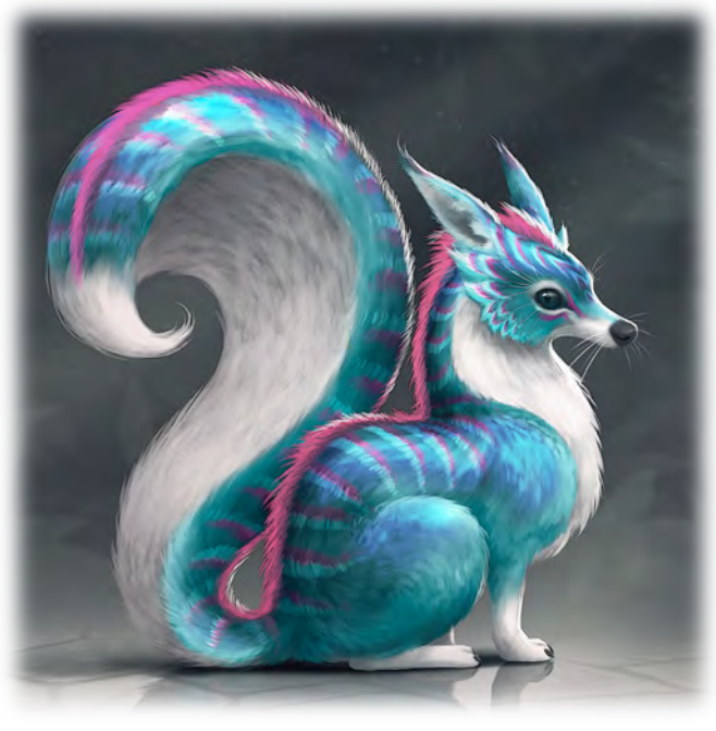
Illustration by Michelle Tolo

Bite. Melee Weapon Attack: +2 to hit, reach 5 ft., one target. Hit: 2 (1d4 - 1) piercing damage.