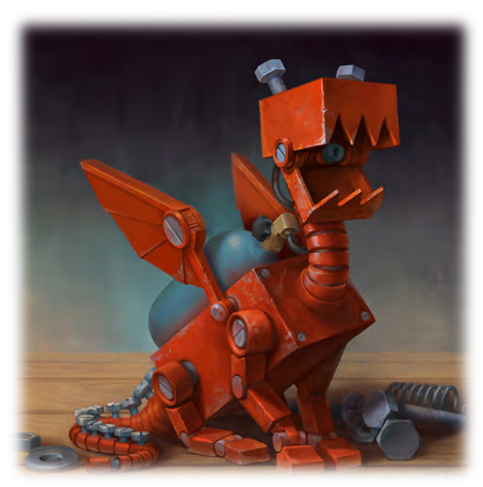
Illustration by Yigit Koroglu

Flame Jet. The mechanical wyrmling exhales fire in a 20-foot line that is 5 feet wide. Each creature in that line must make a DC 11 Dexterity saving throw, taking 10 (4d4) fire damage on a failed save, or half as much damage on a successful one.