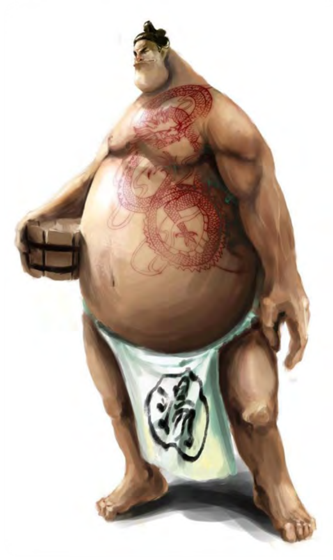
Illustration by Kobe Sek