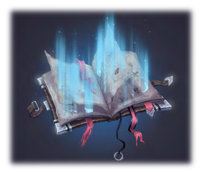
Illustration by Anastasia-berry

Dispense Advice (2/Day). The tome searches the knowledge held within its pages and dispenses helpful advice to a creature within 30 feet of it that can hear it. Within the next 1 minute, the target can roll 2d4 and add the number rolled to one ability check of its choice. It can roll the die before or after making the ability check.