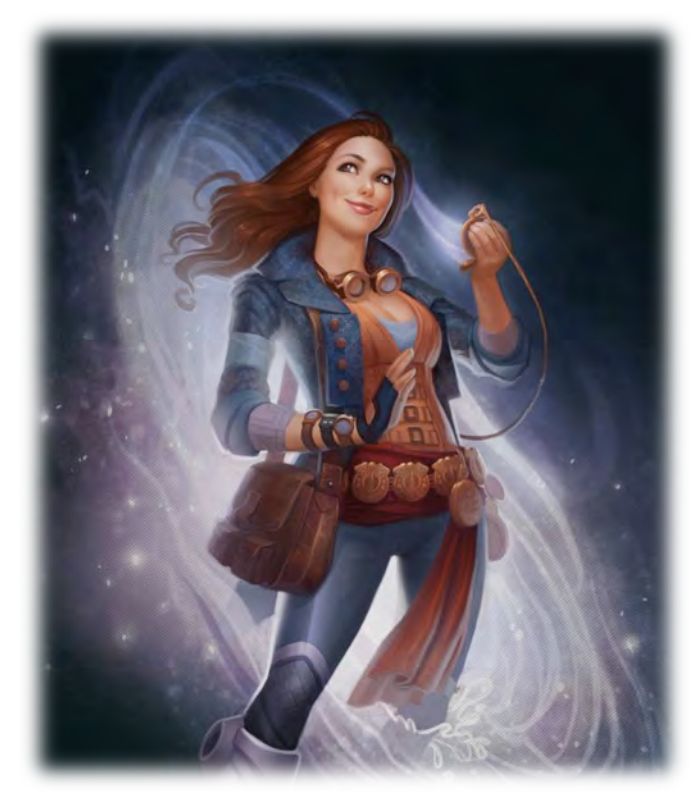
Illustration by Jessica Oyhenart

At Higher Levels. If you cast this spell using a spell slot of 6th level or higher, you move 1 additional turn into the future for each slot level above 5th.