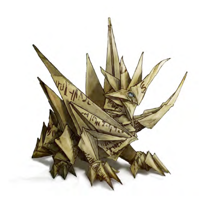
Illustration by Hugo Solis

Sleep Breath (2/Day). The drake exhales sleep gas in a 15foot cone. Each creature in that area must succeed on a DC 11 Constitution saving throw or fall unconscious for 10 minutes. This effect ends for a creature if the creature takes damage or someone uses an action to wake it.