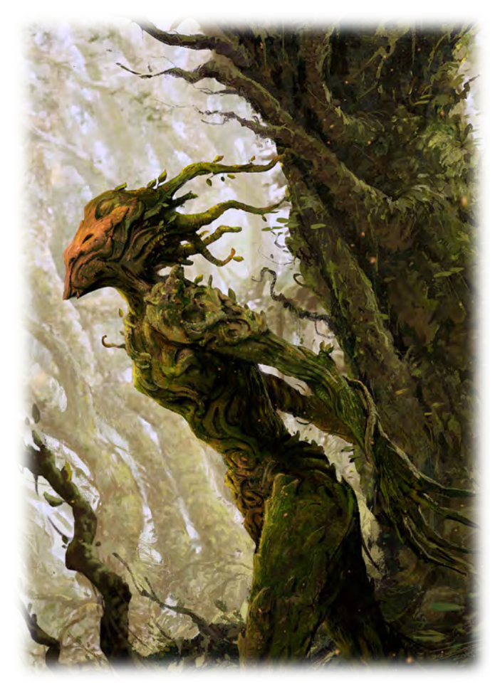
Illustration by Alexandru Negoiță