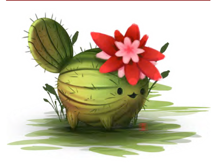
Illustration by Julia Kvavidze

Create Water (1/Day). The cactoor can create up to 1 gallon of clean water within 5 feet of itself.