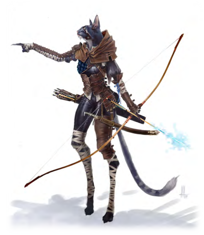
Illustration by David Cornish

The moon blade spell is a signature spell of the Moon Domain cleric presented earlier in this document. A DM should consider reserving this spell for characters who have some affinity with the moon (for example, a druid of the Circle of Dreams , a sorcerer whose origin lies in Witchcraft , or a warlock with an appropriate Celestial otherworldly patron).