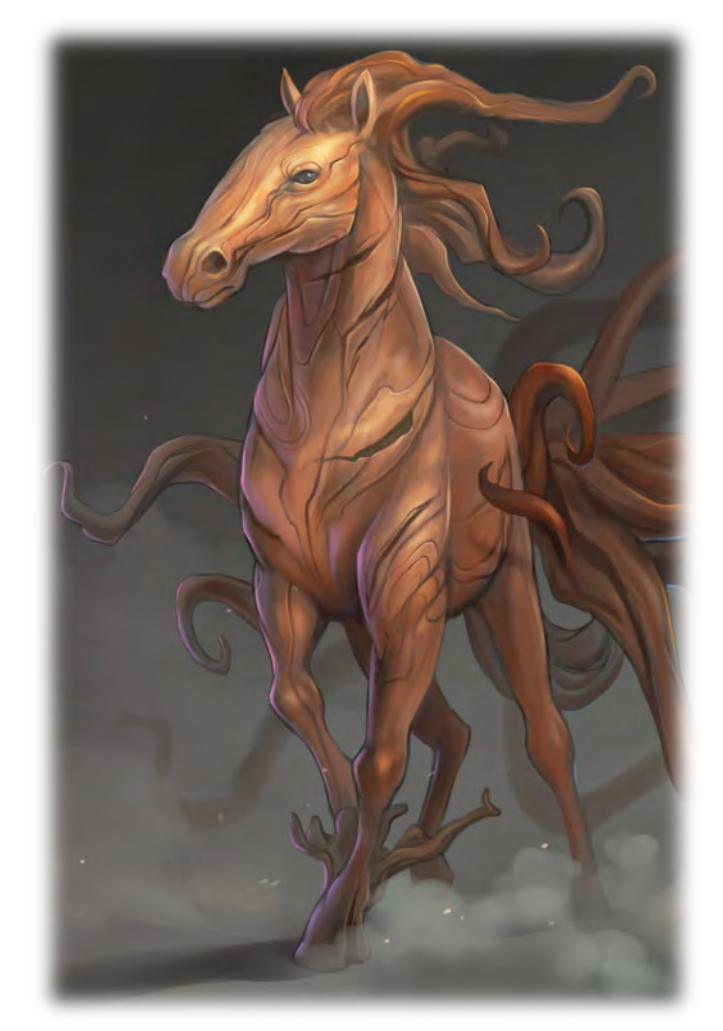
Illustration by Barbora Kovacova

At Higher Levels. When you cast this spell using a spell slot of 4th level or higher, the damage of your poison spit increases by 1d10 and the damage of a weapon you poison increases by 1d6 for each slot level above 3rd.