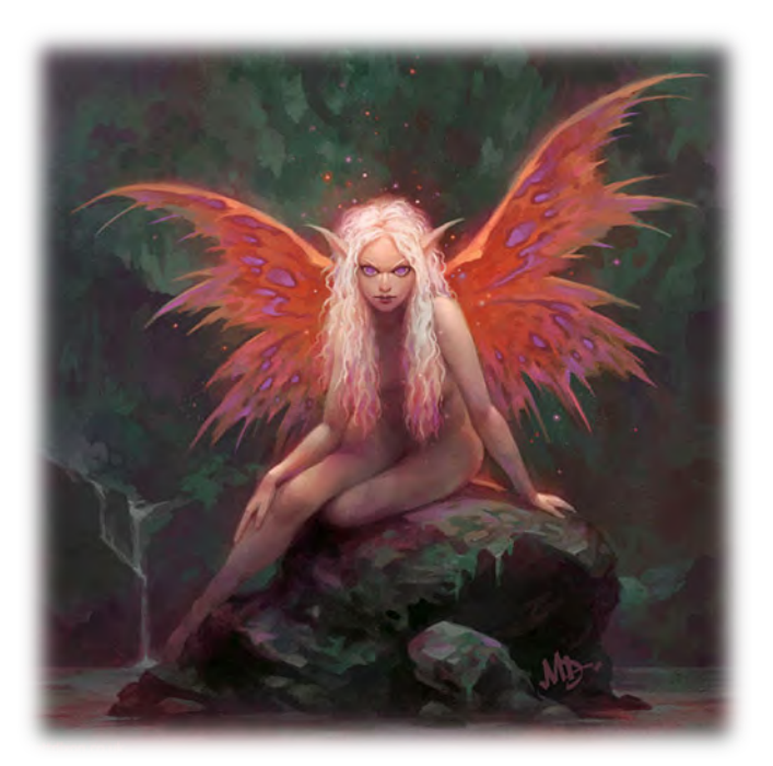
Illustration by Matt Dixon