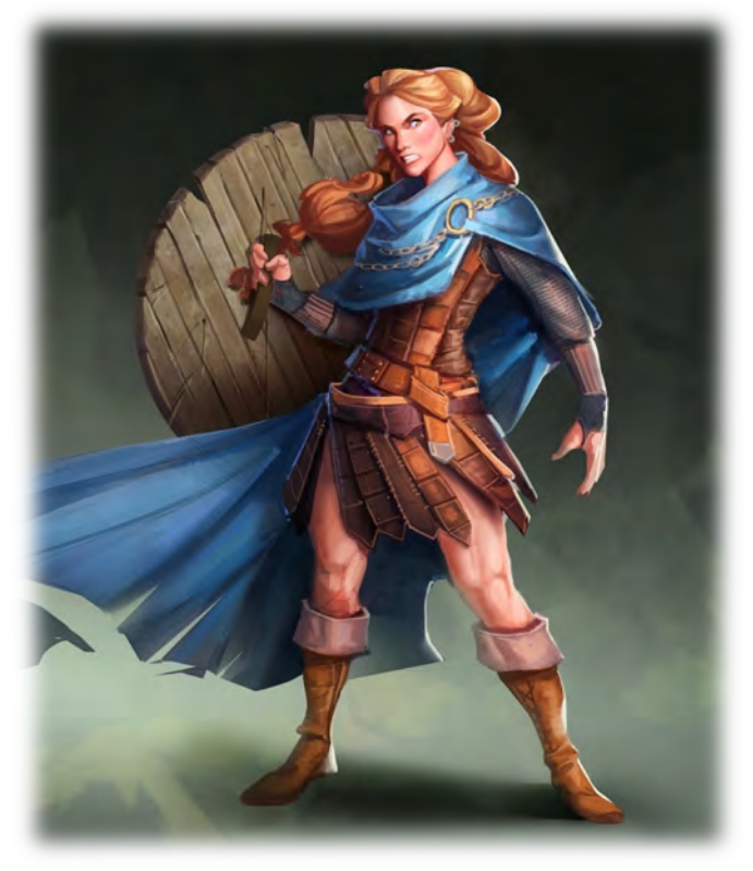
Illustration by Alex Allen

The following items and feats add new options for martial characters who wish to give their character an additional bit of flair or a particular fighting method.