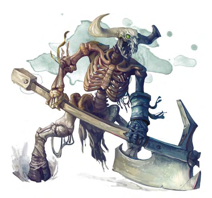
Illustration from the Monster Manual