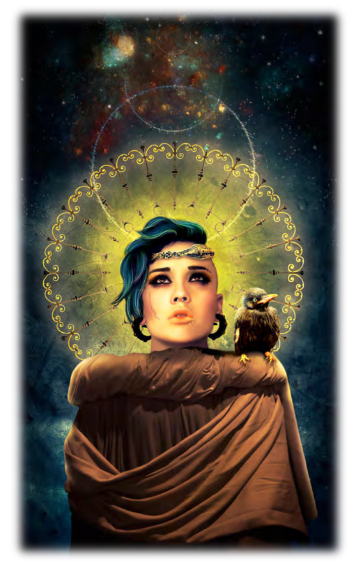
Illustration by itznikki530