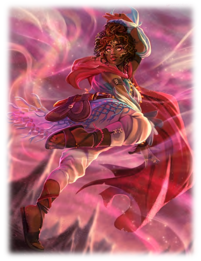
Illustration by Giovana Stiliano