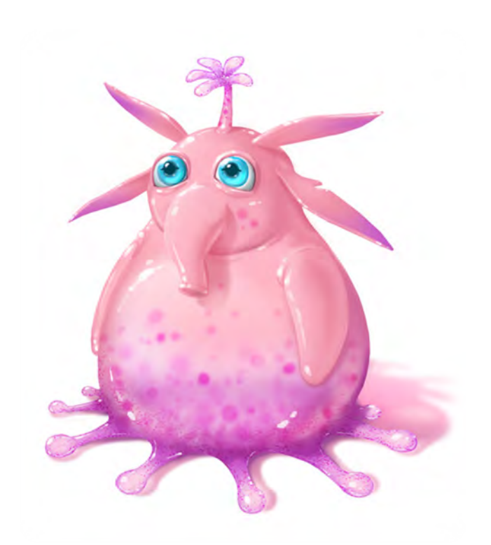
Illustration by Anne-Lise Loubière