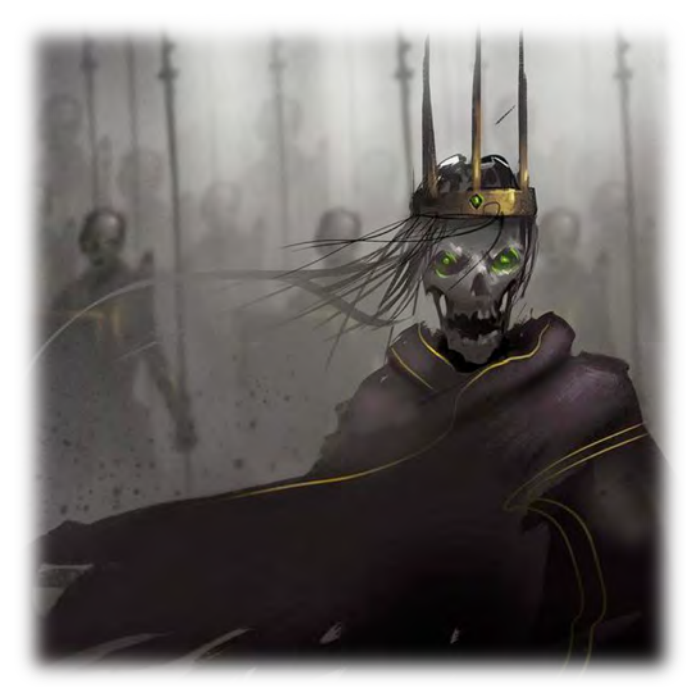
Illustration by Pontus Ullbors

The unconscious command spell might be disruptive to group cohesion, whether the party is the target or the caster of the spell. When adding new mind-affecting spells to the game, ensure everyone playing is comfortable with the idea.