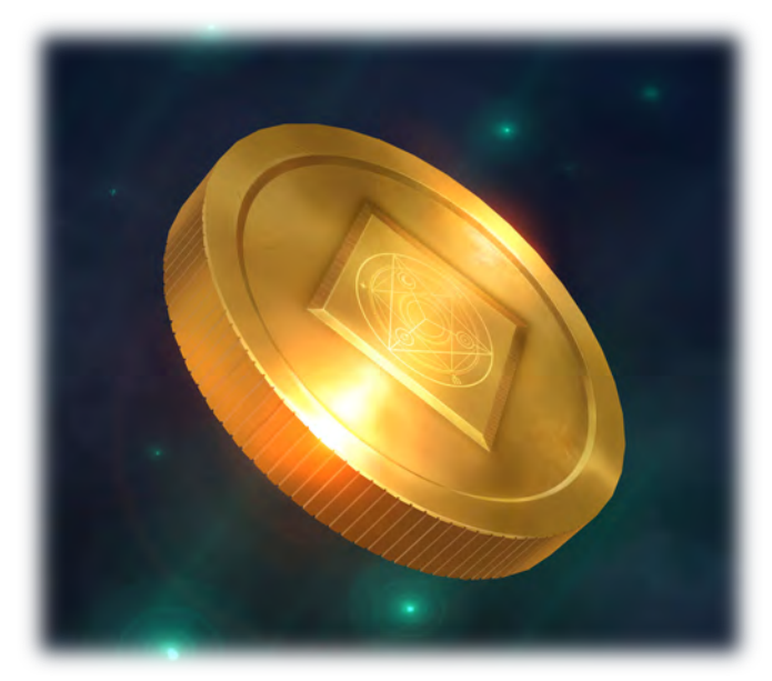
Illustration by Maxim Kaparulin

At Higher Levels. When you cast this spell using a spell slot of 3rd level or higher, the damage for each of its effects increases by 1d6 for each slot level above 2nd. If you use a spell slot of 3rd level or higher, you can target two creatures with the spell. If you use a spell slot of 5th level or higher, you can target three creatures with the spell. If you use a spell slot of 7th level or higher, you can target four creatures with the spell. If you use a spell slot of 9th level, you can target four creatures with the spell.