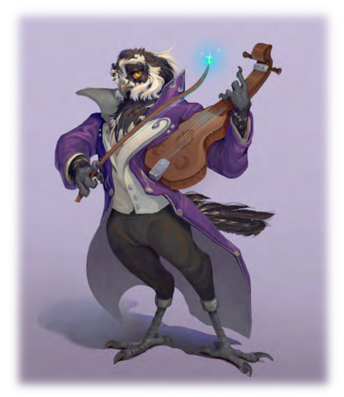
Illustration by Cindy Avelino