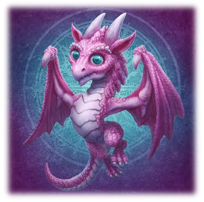
Illustration by Kerem Beyit