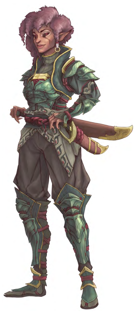
Illustration by David Do

alter fortune (divination) arcane razor (evocation) dazzling strobe (evocation) entropic field (abjuration) euphoric cloud (conjuration) frigid wind (evocation) icy sheet (evocation) invisible trickery (illusion) luck (divination) Melf's unicorn arrow (conjuration) minor glamour (transmutation) misty slash (conjuration) pyroclasm (evocation) roar of waves (illusion) shatterfloor (evocation) synostodweomer (transmutation) telepathy tap (divination) time bomb (evocation) treasure scent (divination) wild flight (evocation) witness (divination, ritual)