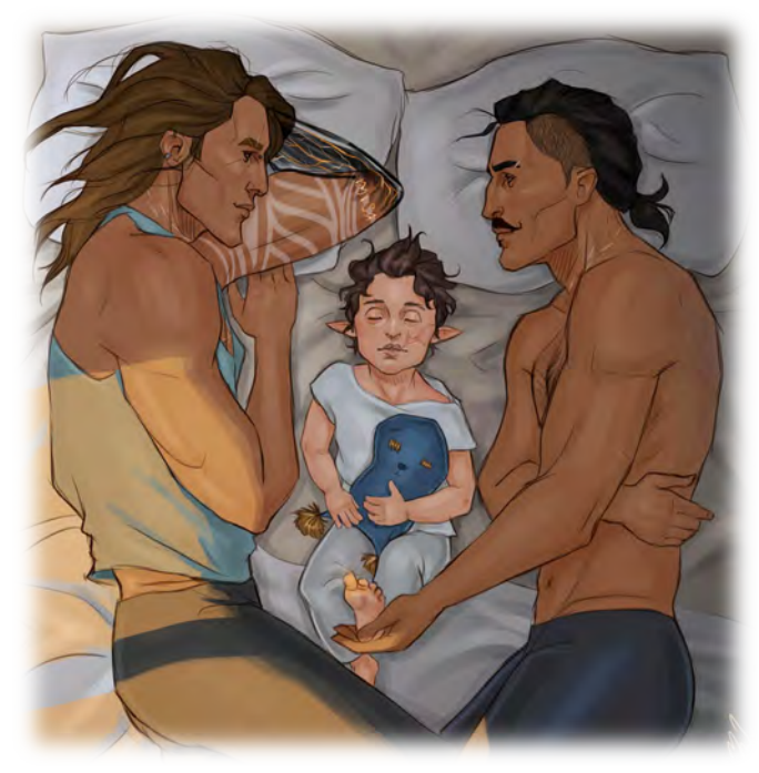
Illustration by Merwild

At Higher Levels. When you cast this spell using a spell slot of 7th level or higher, the spell can incorporate one additional parent whose essence contributes to the child's parentage for each slot level above 6th.