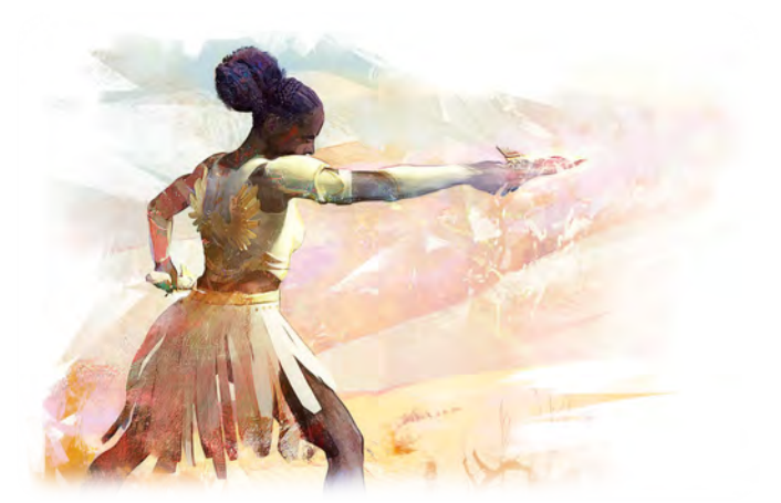
Illustration by Mohammad Qureshi