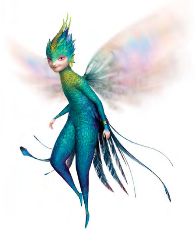
Illustration by Sir Kannario

Fey races, and additional rulings for mechanics, and storytelling considerations for DMs are presented in Old Gus' Errata: Fey Folk. If you're looking for a race to pair this with, or food for thought on bringing this class out of the feywild and into your world, consider giving it a read!