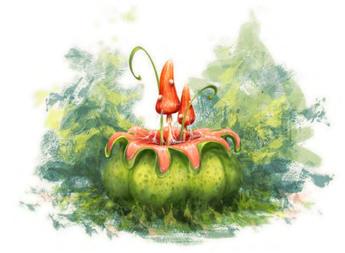
Illustration by Rimma