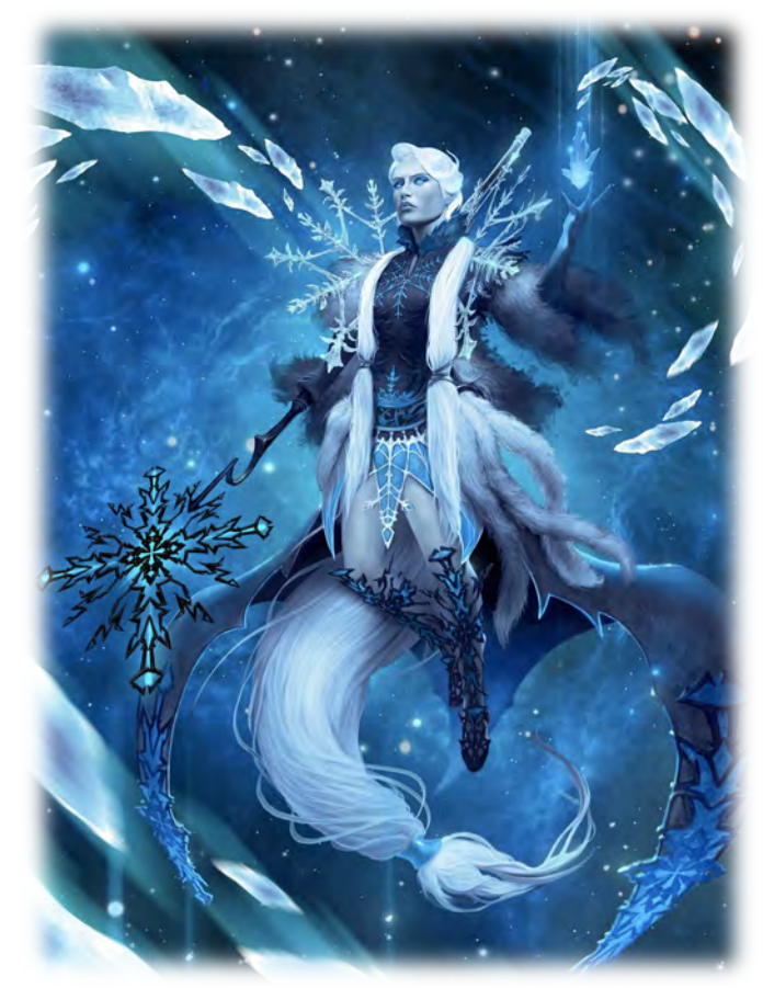
Illustration by Emile Denis

If you cast this spell multiple times, you may have two of its non-instantaneous effects active at a time, and you can use an action to dismiss any effect it has produced.