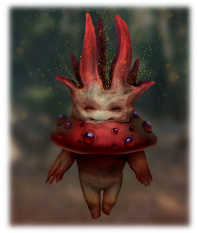
Illustration by Madeline Buanno

Rapport Spores (1/day). A 5-foot radius of spores extends from the sporeling. For the next 1 hour, the spores grant willing creatures with an Intelligence of 2 or higher that aren't undead, constructs, or elemental can the ability to communicate telepathically with one another while within 30 feet of each other.