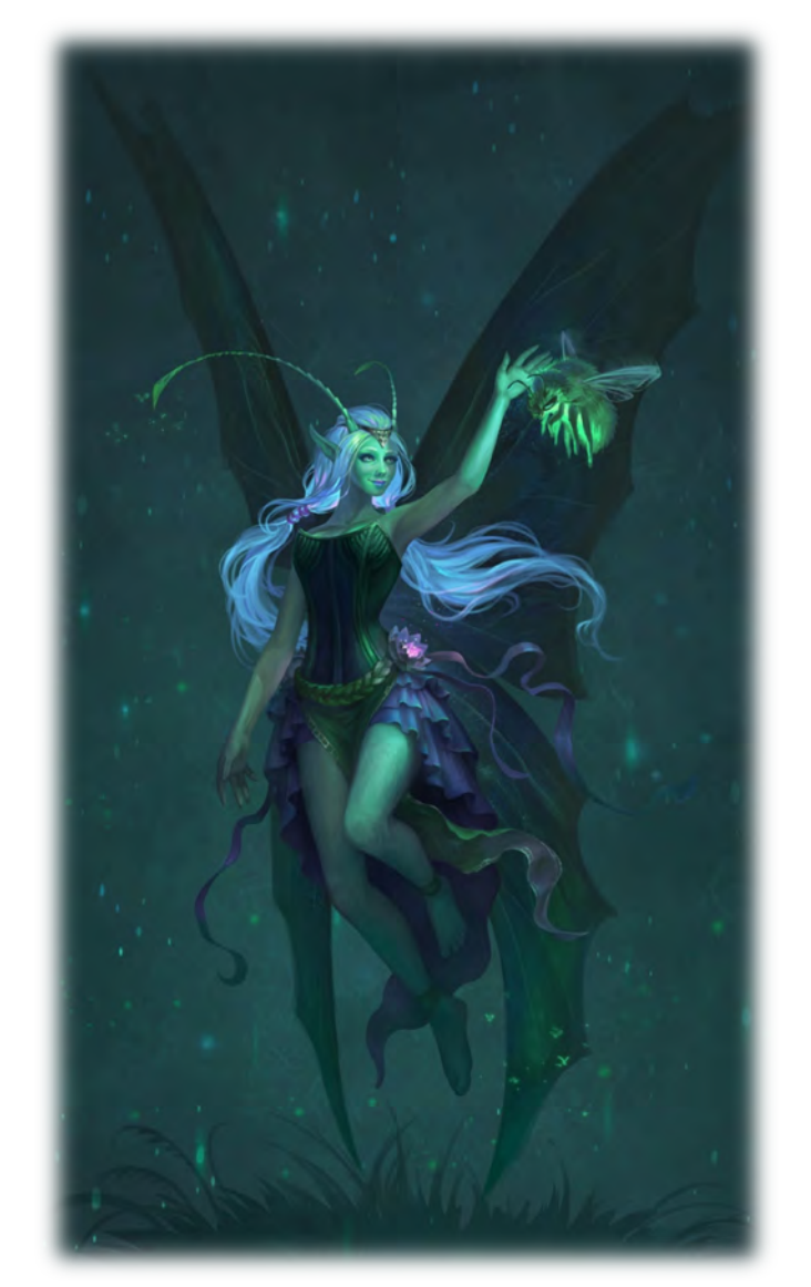
Illustration by Elvira Shatunova