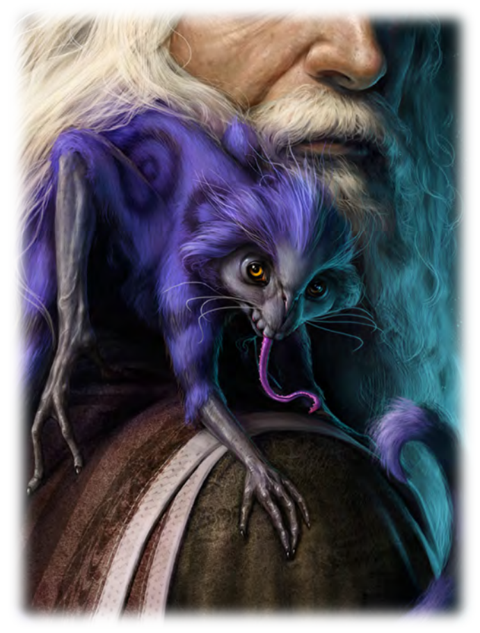
Illustration by Jarrod Owen