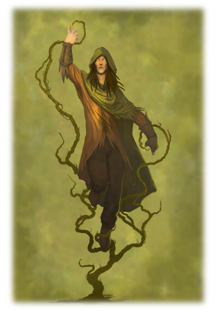
Illustration by Angelo Bortolini