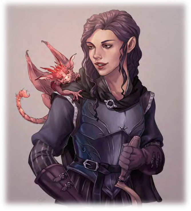
Illustration by Rachel Denton