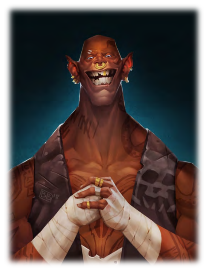
Illustration by Brad Boedeker