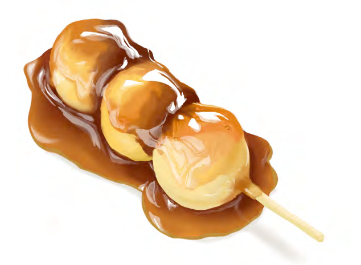
Illustration by kkzt

conjure barrage create food and water fireball haste tiny servant <sup>xCE</sup>