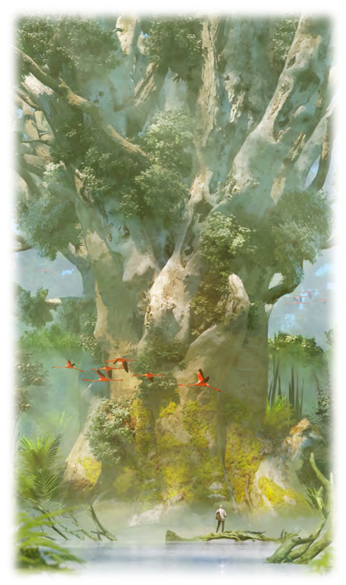
Illustration by Torben Weit

The tree may have called upon you to make a journey deep through its roots – perhaps even to another world entirely, where you are needed. The journey for a world tree warlock never ends, and the entirety of the multiverse is open to you, wherever life and trees are present, at your patron's direction.