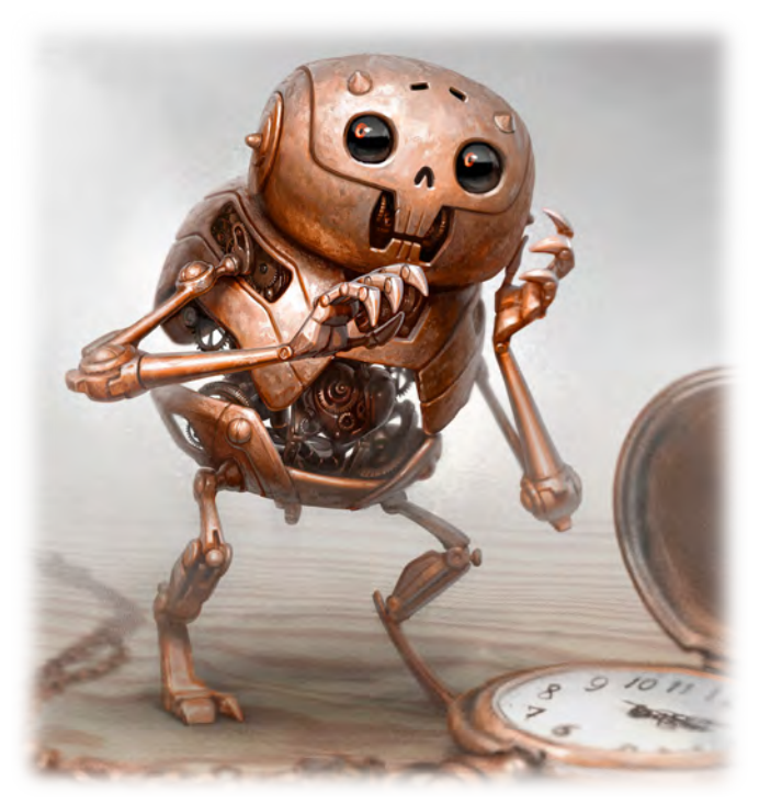
Illustration by George REDreev

Beam. Ranged Spell Attack: +3 to hit, range 10/20 ft., one target. Hit: 3 (1d6) force damage.