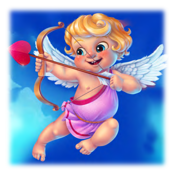
Illustration by Slotopaint