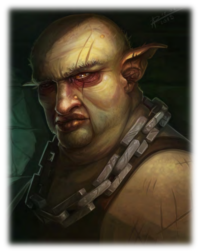
Illustration by Ann-Ka Raab

Ruffians make excellent bouncers, enforcers and most typically work for criminal organizations. Most lack ambition, but intelligent ruffians might rise through the ranks and rule the criminal underworld with an iron fist.