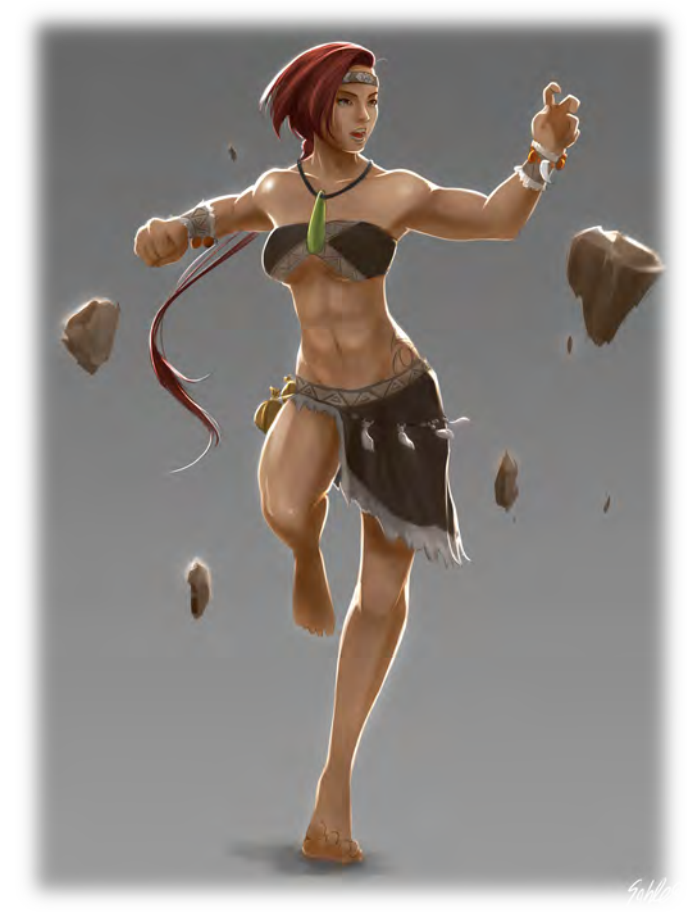
Illustration by Apipol (Sahlea) Chongjiamjit