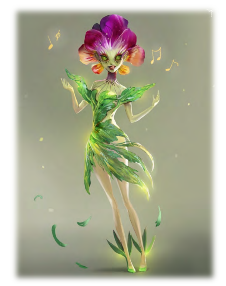
Illustration by Sandra Duchiewicz

The extra damage is 2d8 for a 1st-level spell slot, plus 1d8 for each spell level higher than 1st, to a maximum of 10d8.