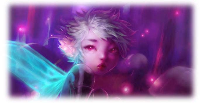
Illustration by XernonaEcho