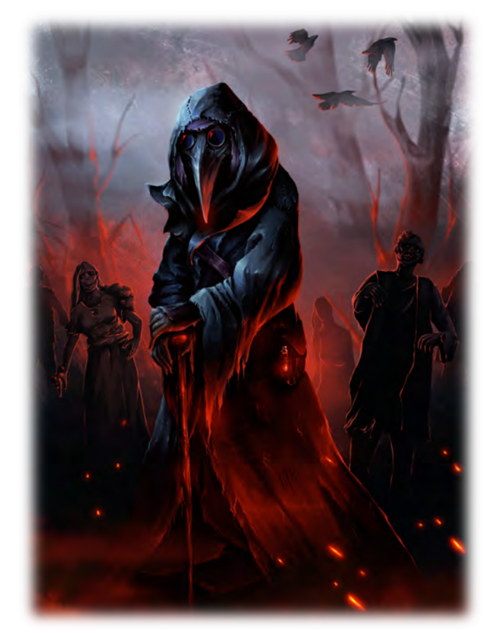
Illustration by Ilona Tsymbal

Additionally, you can use your action to activate an aura of moonlight that lasts for 1 minute or until you dismiss it using another action. For the duration, you emit bright light in a 60-foot radius and dim light for another 30 feet. Magical darkness cannot permeate the area, and your allies within the area cannot be charmed or frightened. If there are illusions present in the area, you know it and can use a bonus action on your turn to dispel one of them.