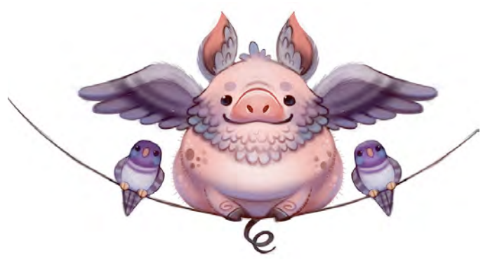
Illustration by Piper Thibodeau