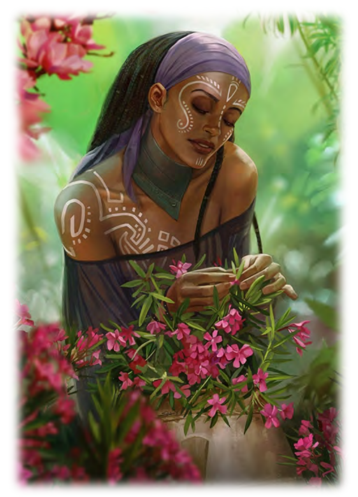
Illustration by Sam Hogg