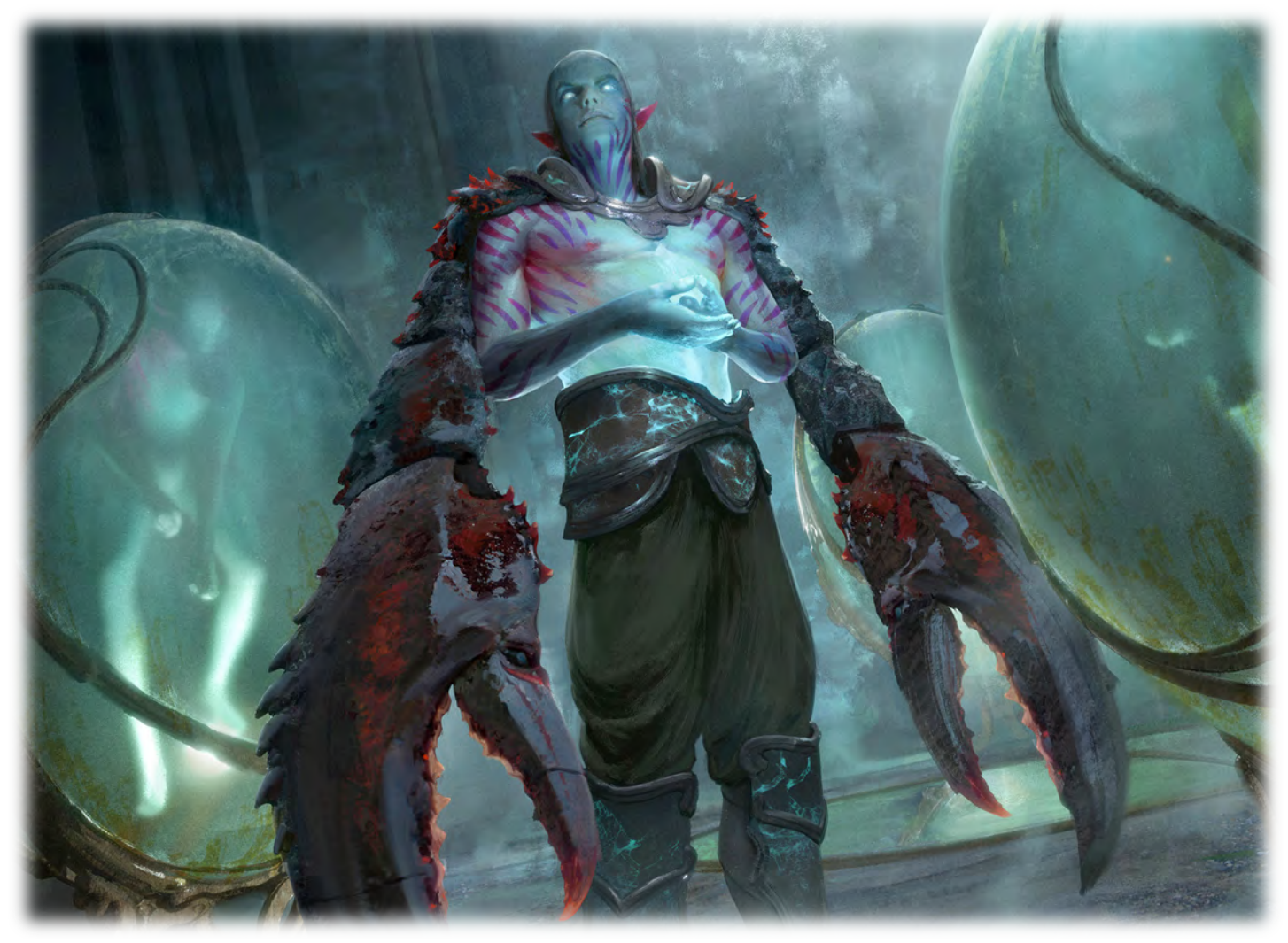
Illustration by Bram Sels