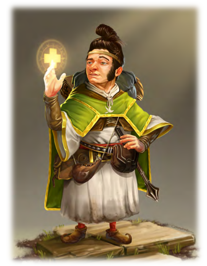
Illustration by Gabriel Cassata