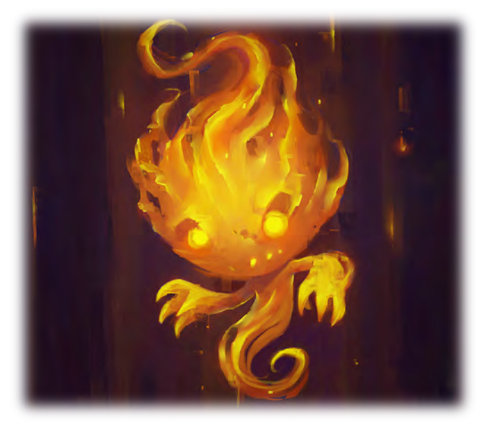
Illustration by Sephiroth Art

Touch. Melee Spell Attack: +4 to hit, reach 5 ft., one target. Hit: 5(1d_4 + 2) fire damage, and the target and catches fire; until someone takes an action to douse the fire, the creature takes 5 (1d4) fire damage at the start of each of its turns.