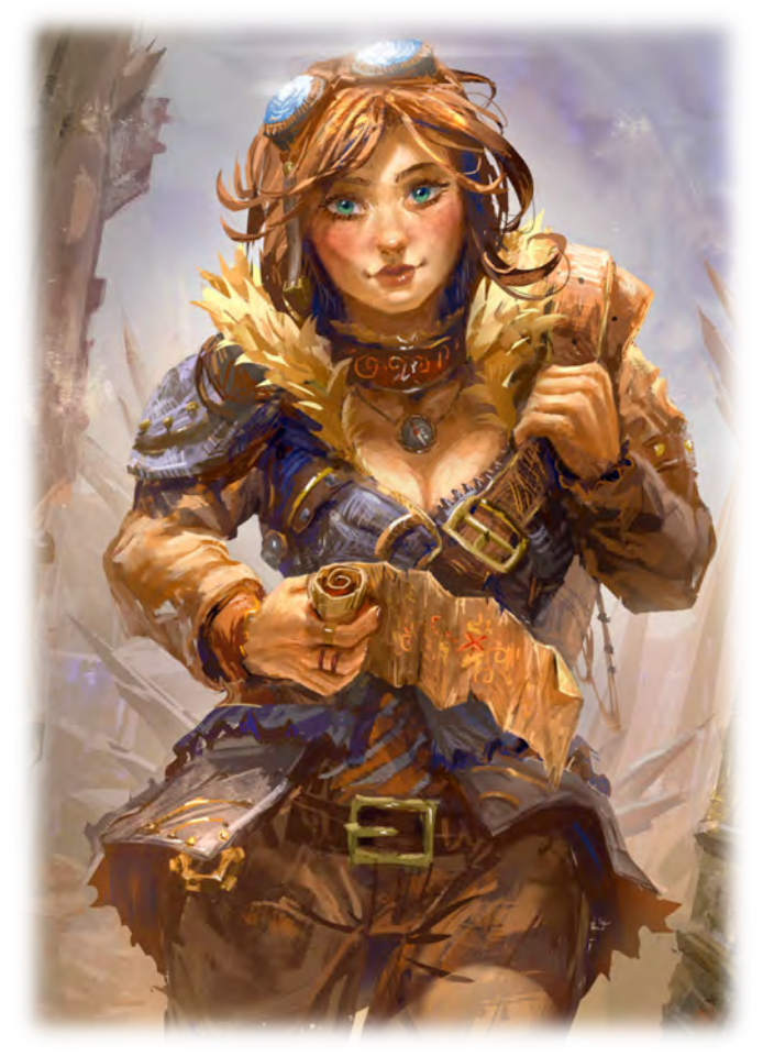
Illustration by Yan Kyohara