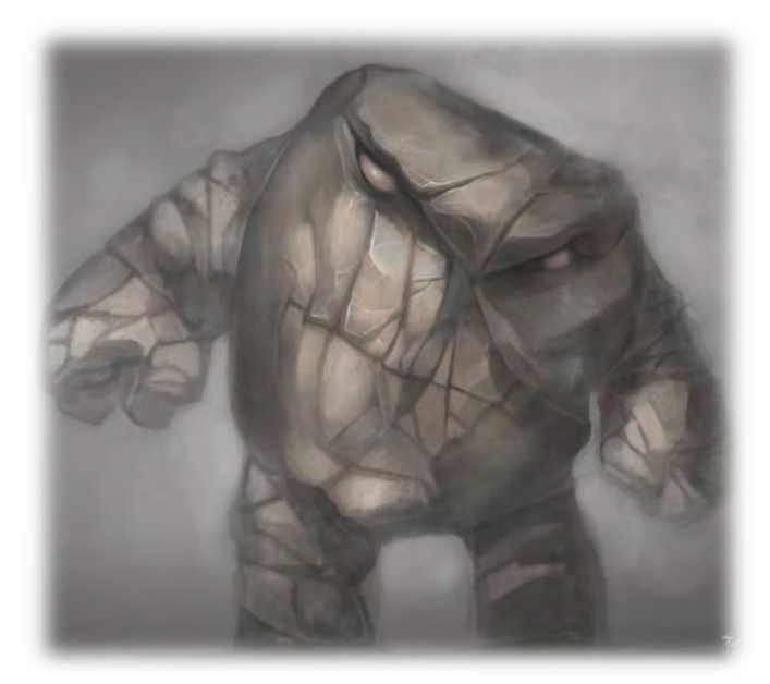
Illustration by Murdelli