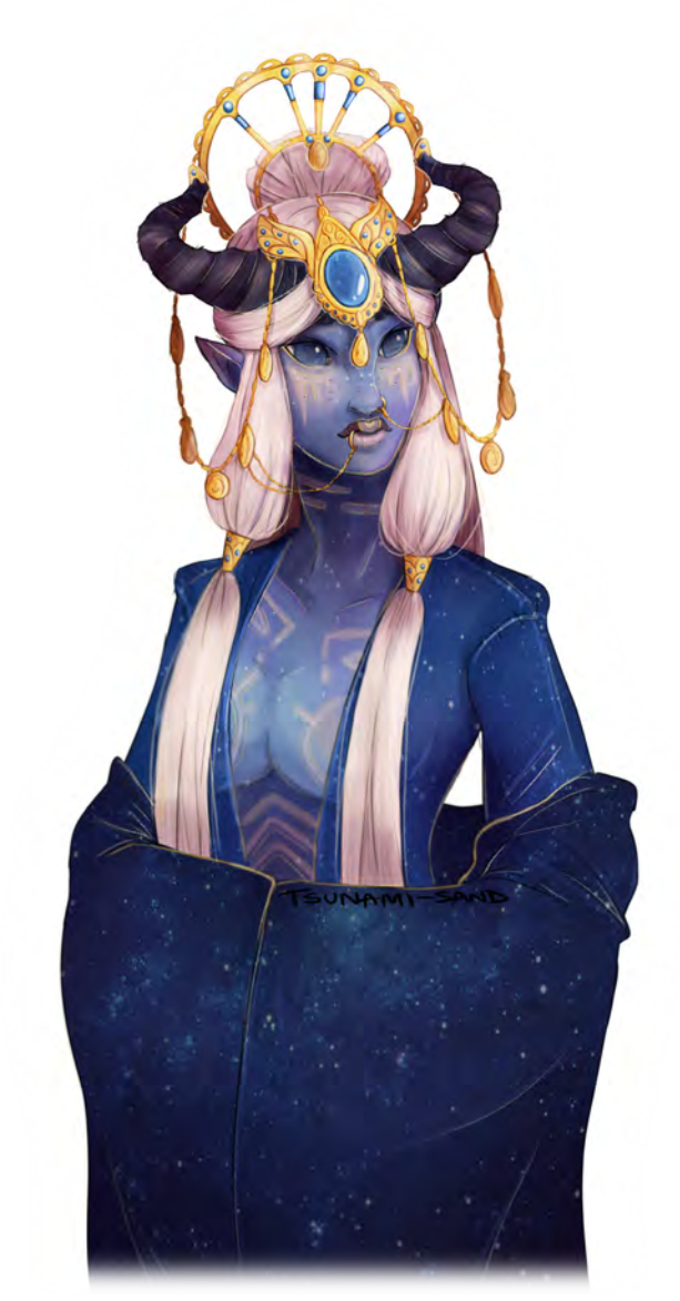
Illustration by Tsunami - Sand

Additionally, the disintegrate spell becomes a cleric domain spell for you.