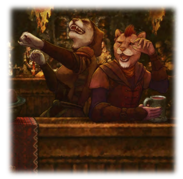
Illustration by Jenna Gangel

At Higher Levels. When you cast this spell using a spell slot of 3rd level or higher, duration increases to 1 hour. If you use a spell slot of 4th level or higher, the duration is 8 hours. If you use a spell slot of 5th level or higher, the duration is 24 hours and does not require concentration.