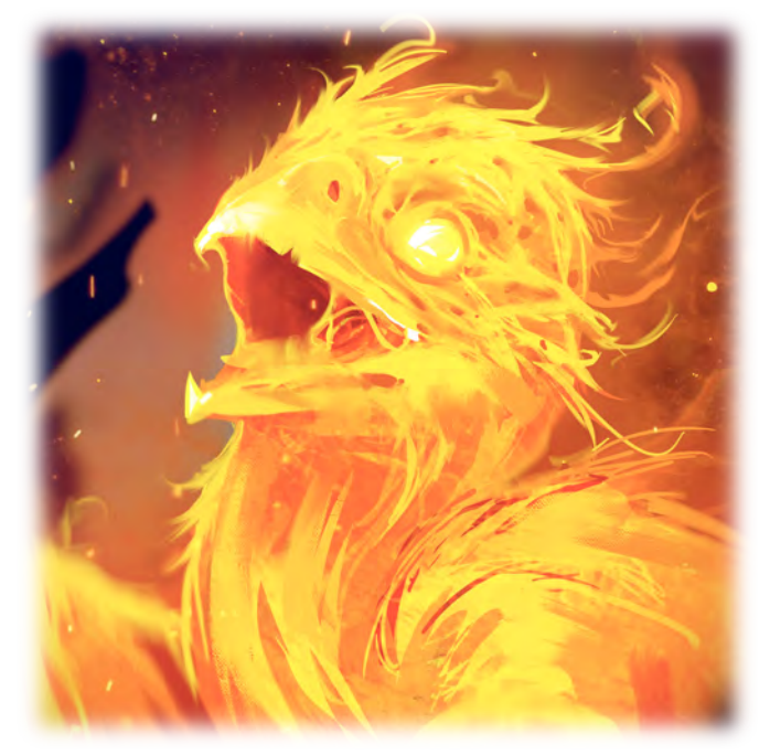
Illustration by Illia Tsiushkevich