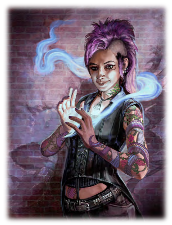
Illustration by Nicole Cardiff