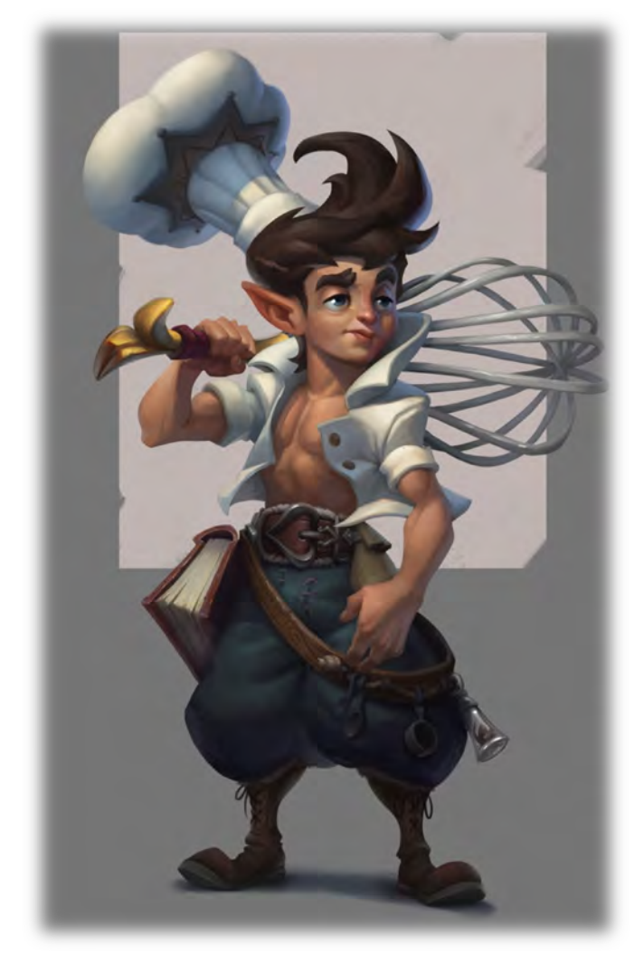
Illustration by Servando Lupini