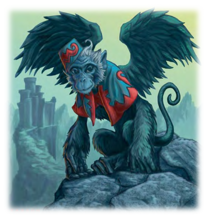
Illustration by Jim Pearson

Bite. Melee Weapon Attack: +4 to hit, reach 5 ft., one target Hit: 5 (1d6 + 2) piercing damage.