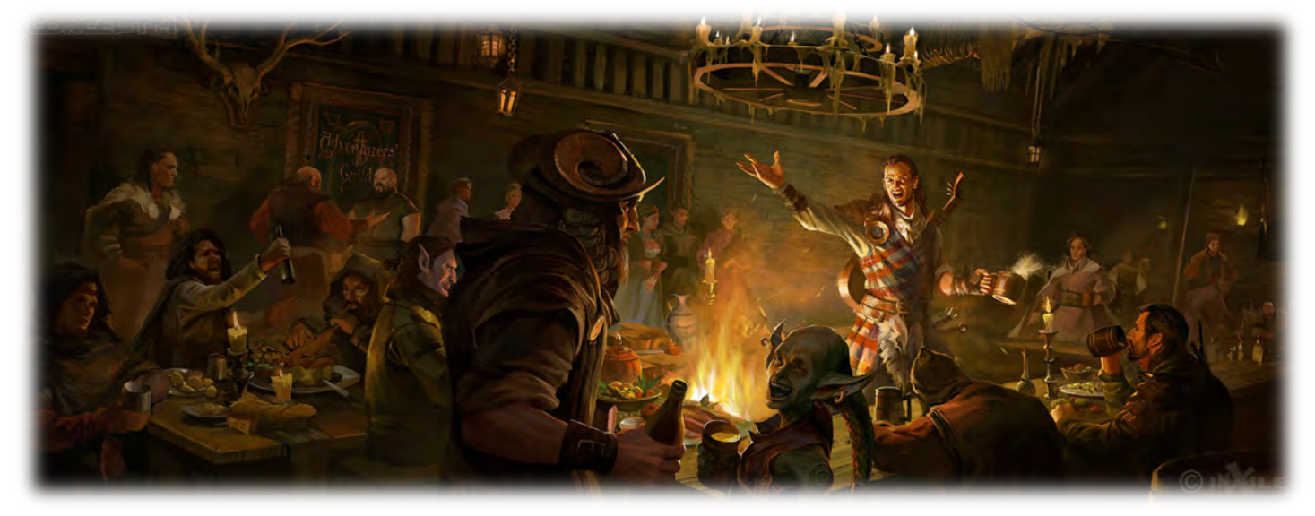
Illustration by Concept 4