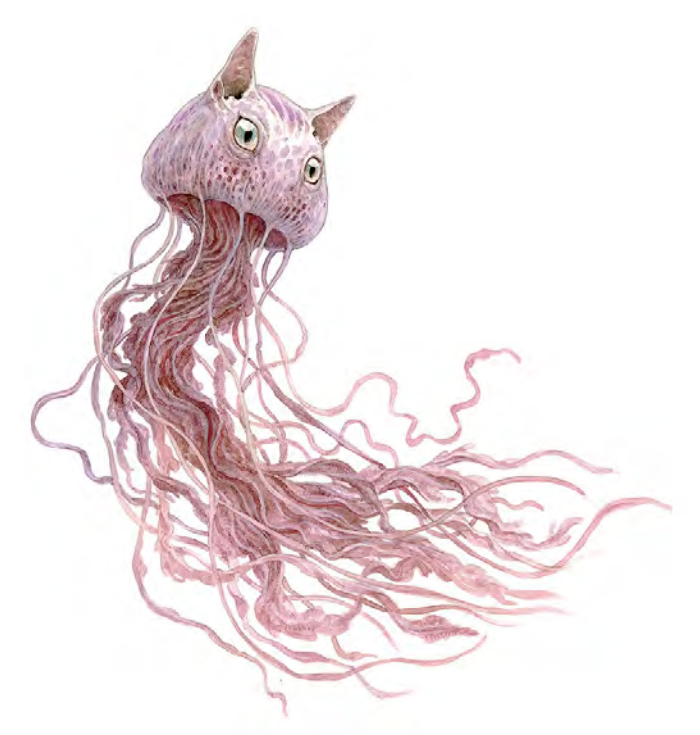
Illustration by Peter Boehme