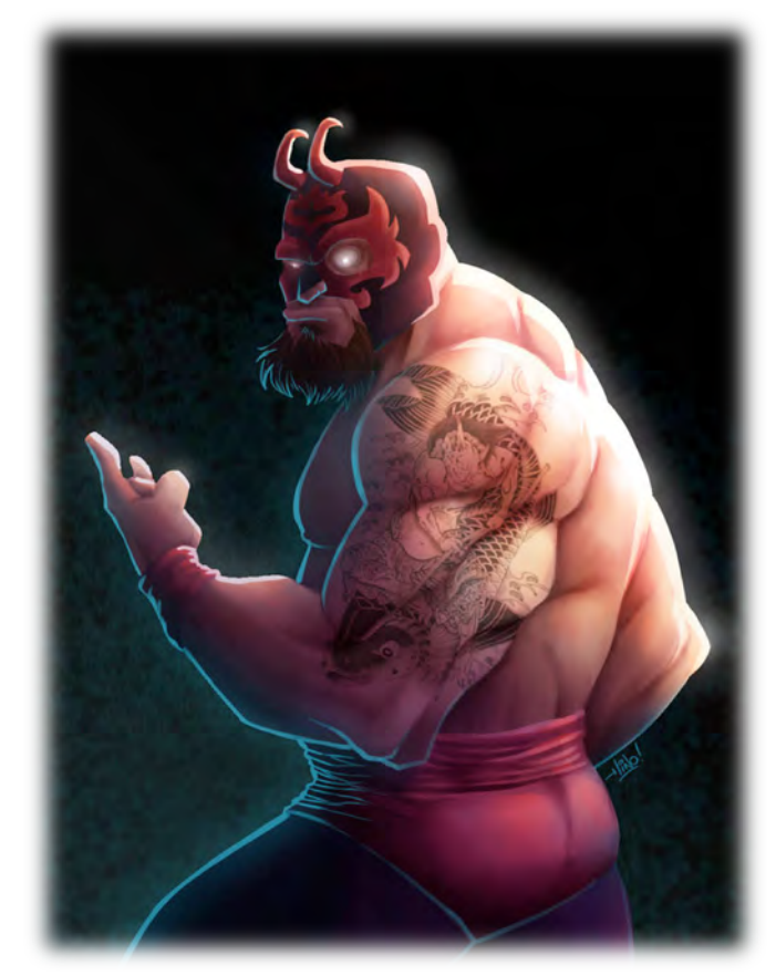
Illustration by El Hino

Also at 6th level, when you are grappling a creature, you can use your bonus action to designate an ally that can see and hear you within 15 feet of you. If they are within range to make a melee weapon attack against a creature you are grappling, they can spend their reaction to do so, or you can release your grapple and push the creature toward up to 15 feet toward them.