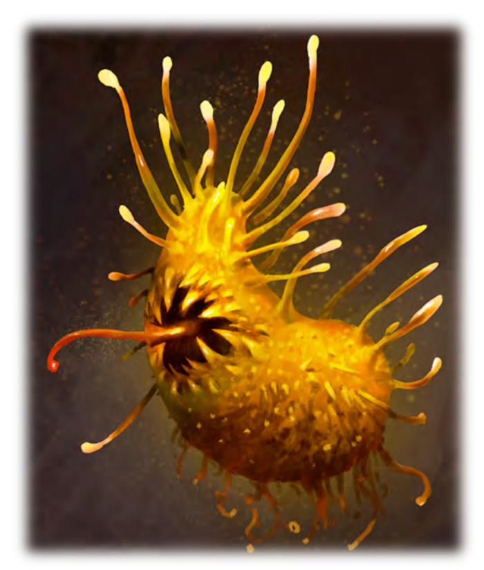
Illustration by Aaron Miller

Infect (2/Day). The protozoan expels an infectious goo onto a creature it can see within 10 feet of itself. The target makes a DC 12 Constitution saving throw. On a failed save, the creature is poisoned for 24 hours. For the duration at the start of each of its turns it rolls a d4. On a 1, it spends its action that turn coughing and retching. Creatures that are immune to poison automatically succeed their saving throw.