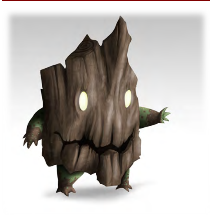
Illustration by Gage Wood

Shillelagh. Melee Spell Attack: +3 to hit, reach 5 ft., one target. Hit: 1 (1d6 + 2) bludgeoning damage.