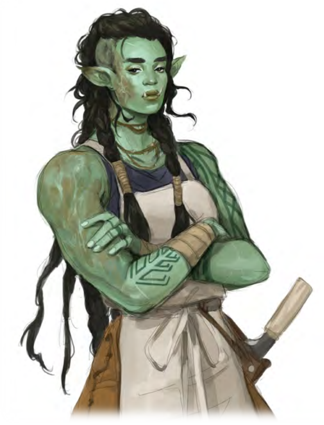
Illustration by Kii Weatherton

Additionally, you learn the heroes' feast spell. It is a Culinary Infusion spell for you, and you can cast it by expending 6 chef points, using 500g worth of edible ingredients.