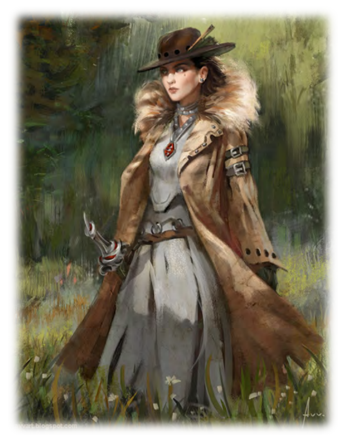
Illustration by Aleksei Vinogradov

You receive no magical indications as to whether the answer they receive is truthful in nature. If you reduce a creature to 0 hit points with this spell, they are stable, but rendered unconscious for 10 minutes.