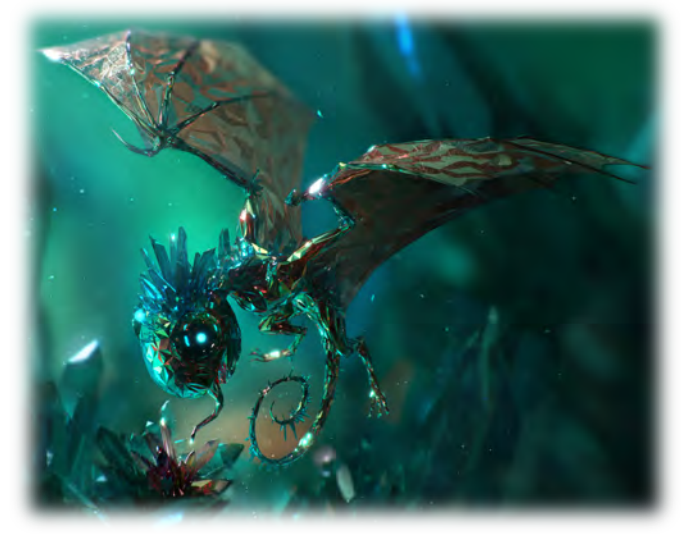
Illustration by Paolo Giandoso