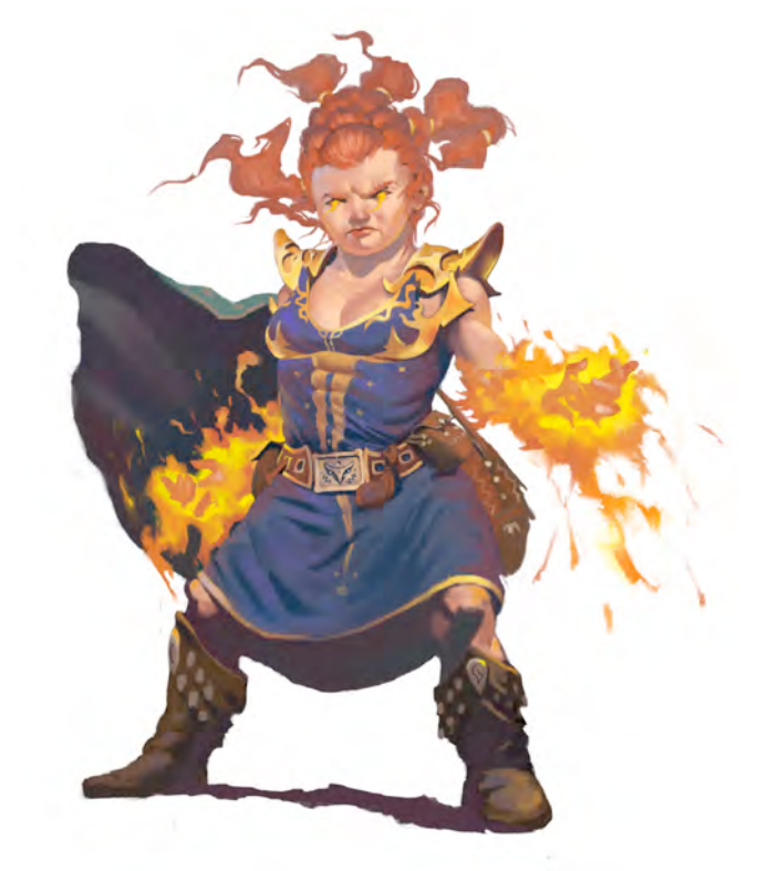
Illustration by Martin Sobr

At Higher Levels. When you cast this spell using a spell slot of 5th level or higher, the radius of the sphere increases by 10 feet for each slot level above 5th. Additionally, the zone causes spells of one level higher for each slot level above 4th to backfire for each slot level above 5th.