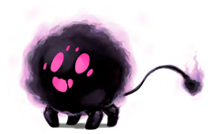
Illustration by Mataknight