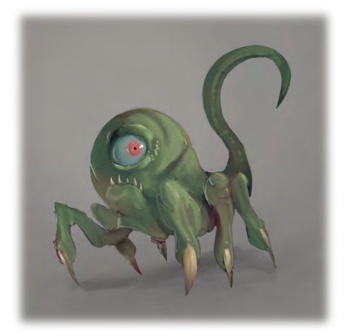
Illustration by Accie Sullivan