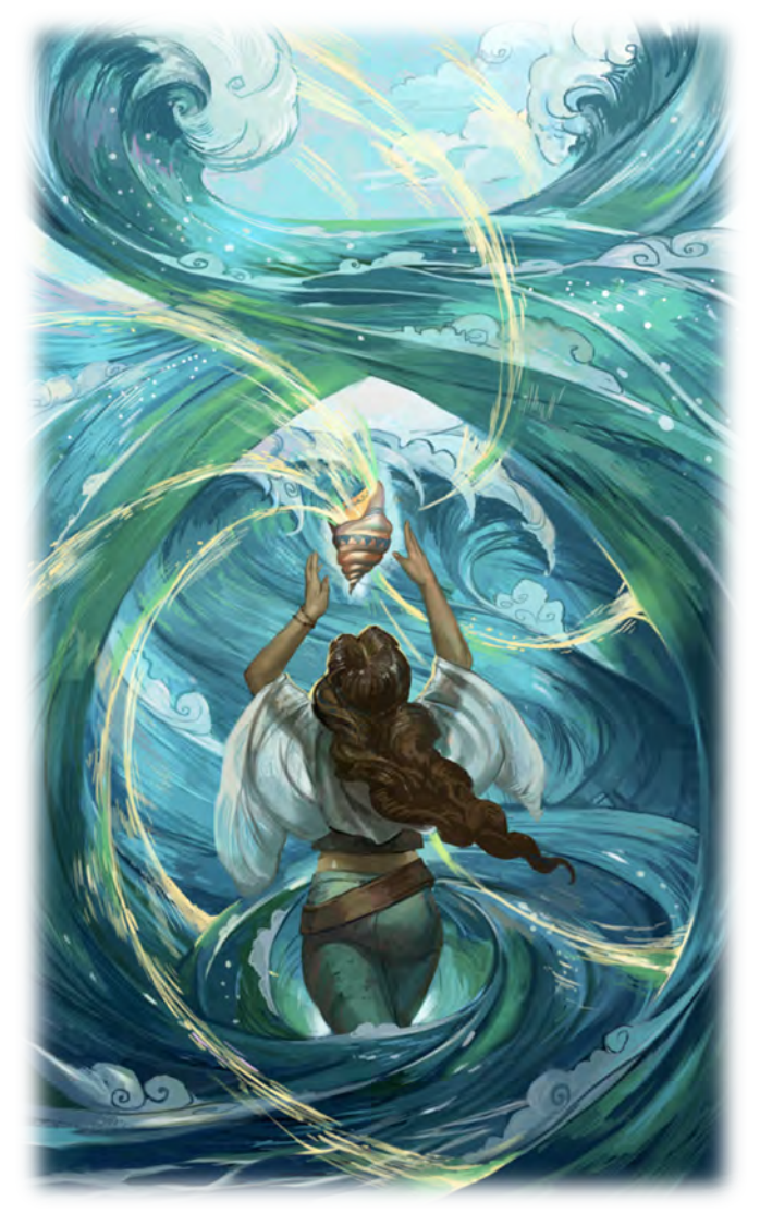
Illustration by Julie Dillon