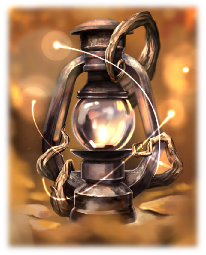
Illustration by Pavel Lapukhin

Lloyd's beacon is a useful spell for characters with a dedicated home base they regularly return to, but its lengthy casting time makes it inefficient to use in combat. It's also useful for setting up an escape for yourself and a few friends!