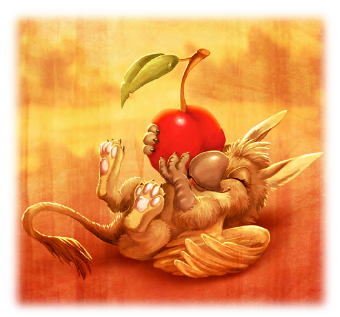
Illustration by Elisabeth Kiss

Claws. Melee Weapon Attack: +3 to hit, reach 5 ft., one target. Hit: 3 (1d4 + 1) slashing damage.