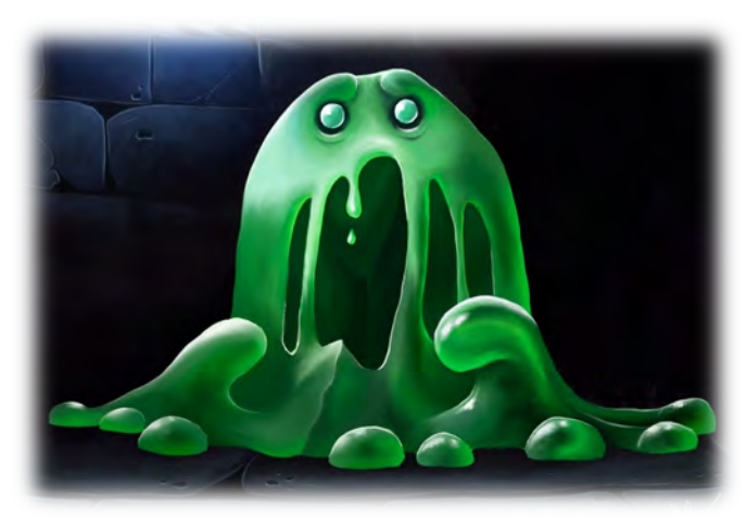
Illustration by Anastasia Ciolac

Pseudopod. Melee Weapon Attack: +1 to hit, reach 5 ft., one target. Hit: 2 (1d6-1) bludgeoning damage plus 3 (1d6) acid damage. This attack can corrode metal objects that aren't being worn or carried. If the target is nonmagical metal armor, its armor is partly corroded and takes a permanent and cumulative -1 penalty to the AC it offers. If the target is a nonmagical metal weapon, it takes a permanent and cumulative -1 penalty to damage rolls. If a weapon's penalty drops to -5, the weapon is rendered useless. The oozeling can eat a four-inch diameter hole through 1-inch-thick, nonmagical metal in 1 hour.