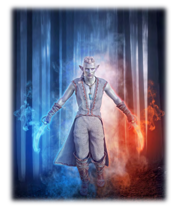
Illustration by Deanna Cathcart

At 18th level, you can boil the blood of nearby enemies, weakening them. As an action, you can spend 6 sorcery points to draw on this power and exude a debilitating aura 60 feet. For 1 minute or until you lose your concentration (as if you were casting a concentration spell), each hostile creature that starts its turn in this aura must make on a Constitution saving throw. On a failure, a creature takes 3d8 necrotic damage, falls prone, and has disadvantage on attack rolls and ability checks until the start of their next turn. On a success, a creature takes half as much damage but suffers no other effects. Constructs and undead are immune.