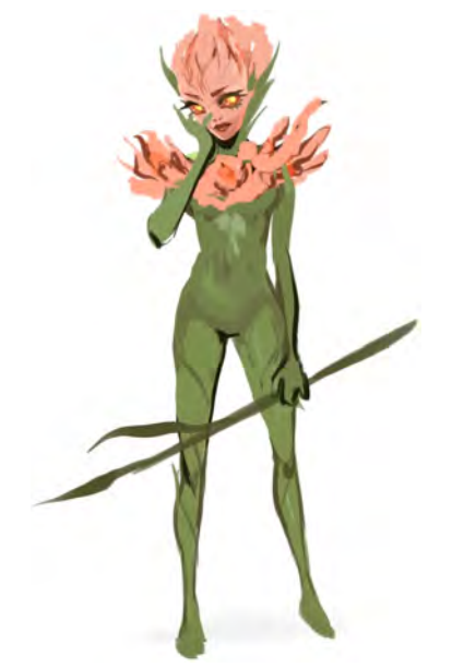
Illustration by Sandra Duchiewicz

alarm (abjuration, ritual) allergen cloud (conjuration) arcane strike (evocation) catapult <sup>XGE</sup> (transmutation) ceremony <sup>XGE</sup> (transmutation, ritual) charm person (enchantment) chaos bolt XGE (evocation) cheetah sprint (transmutation) color spray (illusion) cure wounds (evocation) detect magic (divination, ritual) drunkard's breath (conjuration) dust dash (evocation) ensnaring strike (conjuration) faerie fire (evocation) find familiar (conjuration) goodberry (transmutation) hail of thorns (conjuration) healing word (evocation) illusory script (illusion, ritual) jump (transmutation) longlimb (transmutation) mass distortion (transmutation) reorient (transmutation) silent image (illusion) shield (abjuration) sleep (enchantment) snare <sup>XGE</sup> (abjuration) snakestaff (transmutation) speak with animals (divination, ritual) sylvan vision (divination, ritual) witch bolt (evocation) water whip (conjuration) wood rot (transmutation) zephyr strike XGE (transmutation)