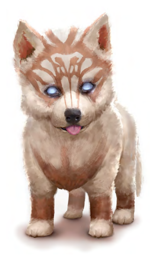
Illustration by Kyle Sewnarain

Teleport (2/Day). The pup magically teleports, along with any equipment it is wearing or carrying, up to 40 ft. to an unoccupied space it can see. Before or after teleporting, the pup can make one bite attack.