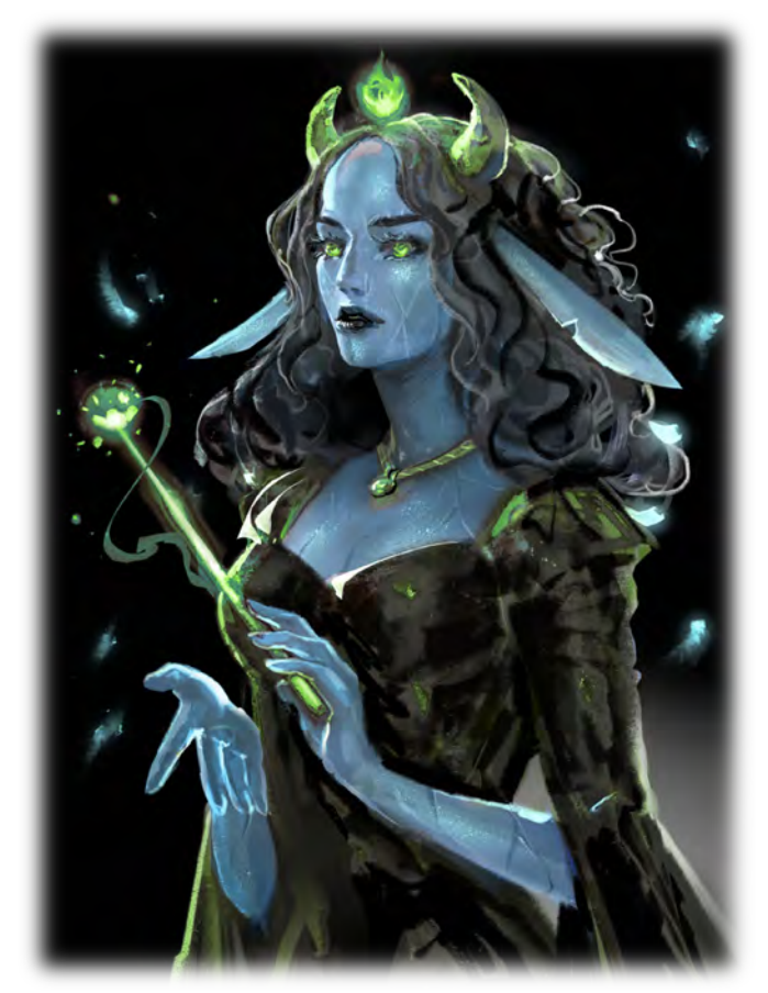
Illustration by Sandra Duchiewicz