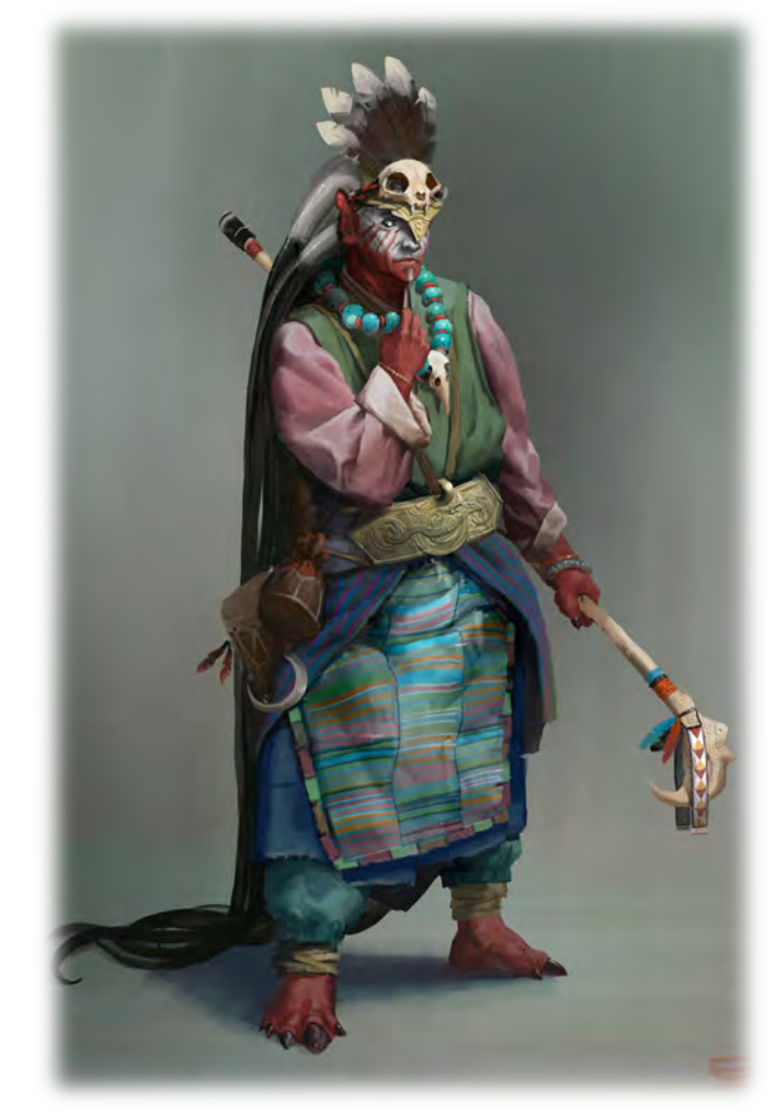
Illustration by Luc de Haan

Additionally, you can proficiency in one weapon of your choice. Usually, this is an important symbolic weapon of your people.