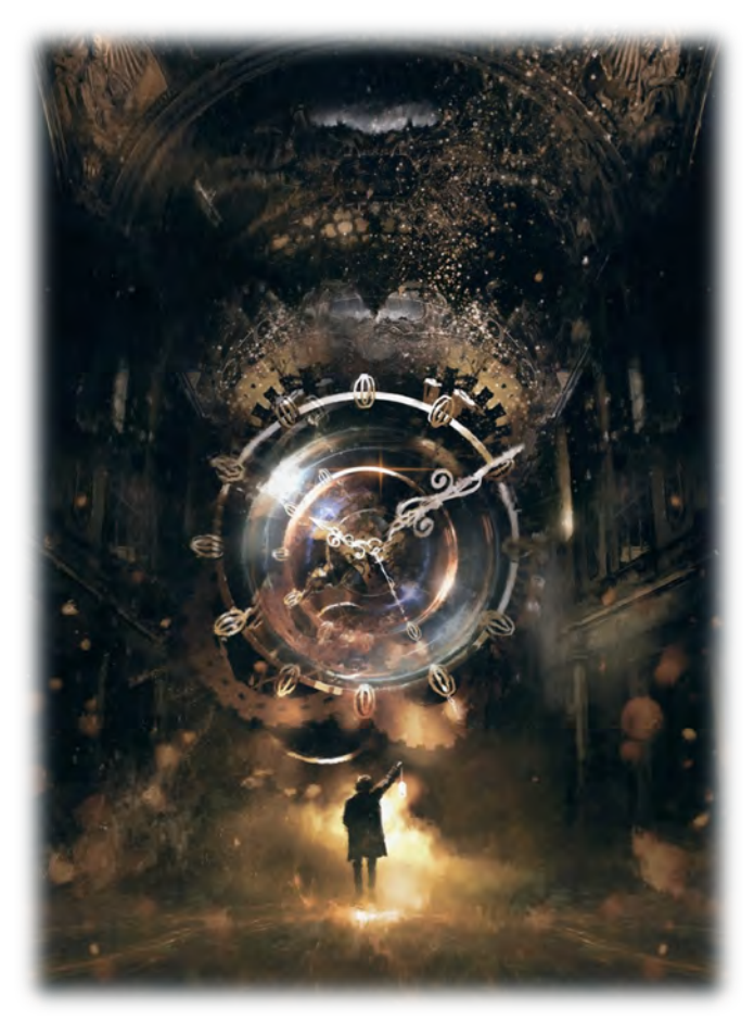
Illustration by Glenn Porter

For the duration, creatures within the area have resistance to lightning, and have advantage on saving throws against spells and other effects that would deal lightning damage to them.