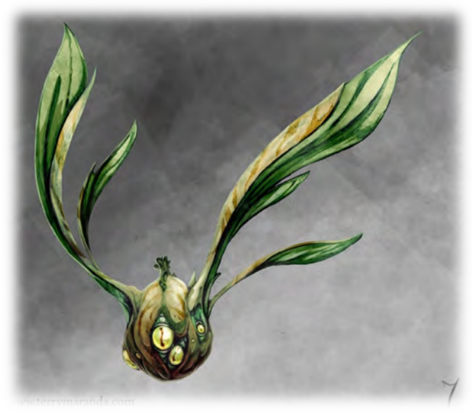
Illustration by Terry Maranda

Holograph (1/Day). The fluttering oculus scans the area around itself to a distance of 30 feet and stores the image in its memory. It can later use this ability to project the stored image as a transparent illusion. The fluttering oculus can only store one such image in its memory at a time.