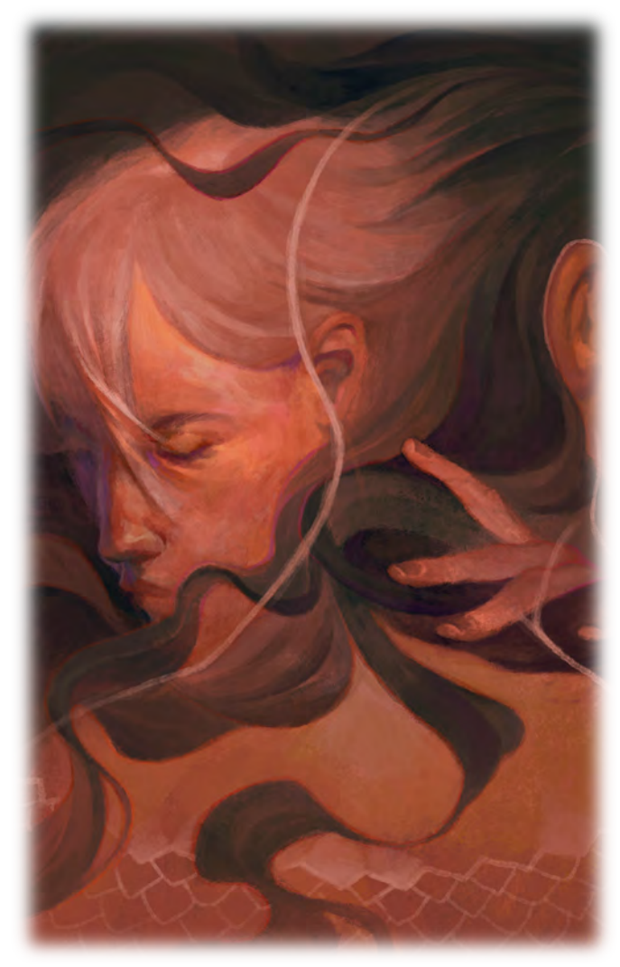
Illustration by Lada Da