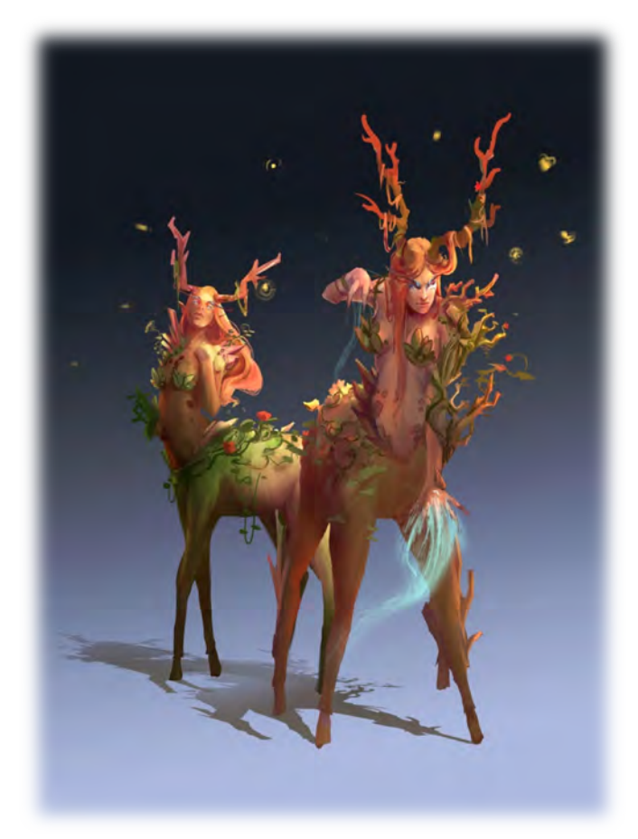
Illustration by Tomas Navikas