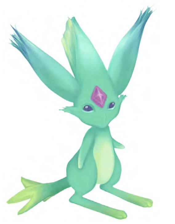
Illustration by Sofia Uhr

Bite. Melee Weapon Attack: +1 to hit, reach 5 ft., one target. Hit: 1 (1d4 - 1) piercing damage.