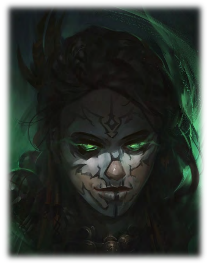
Illustration by Rafał Górniak

Once you use this ability, you can't use it again until you complete a long rest.