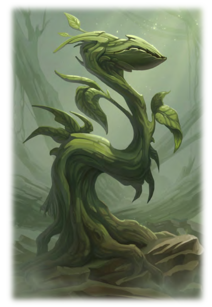
Illustration by Lee Haupt