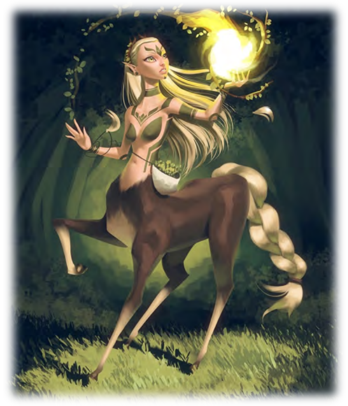
Illustration by Leandro Franci