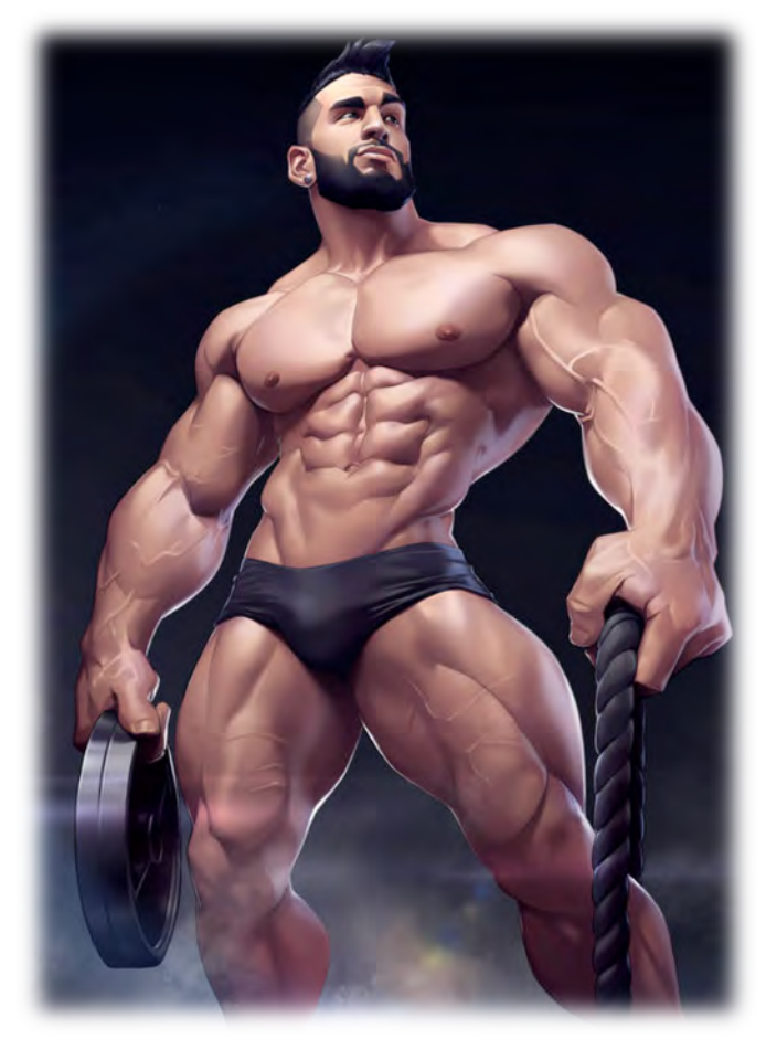
Illustration by Silverjow