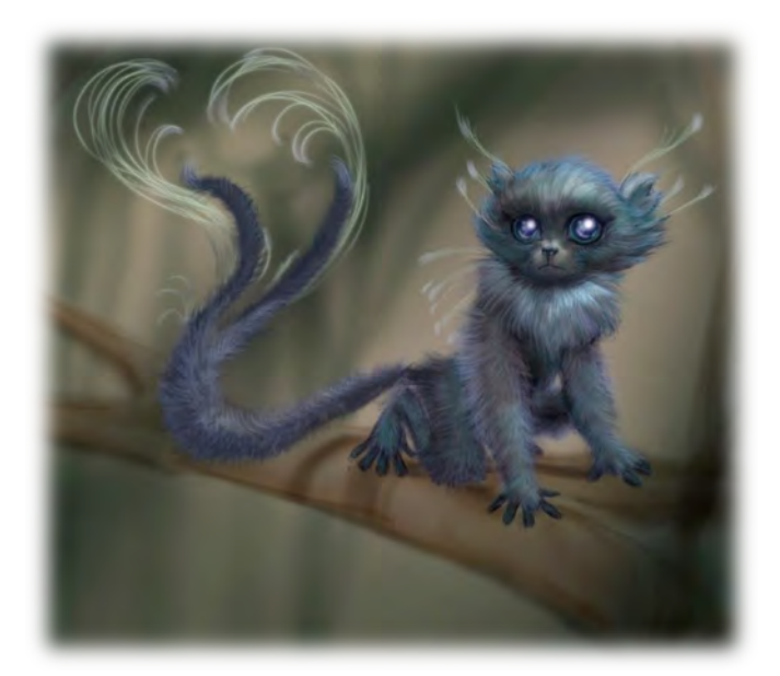
Illustration by Rita Lux