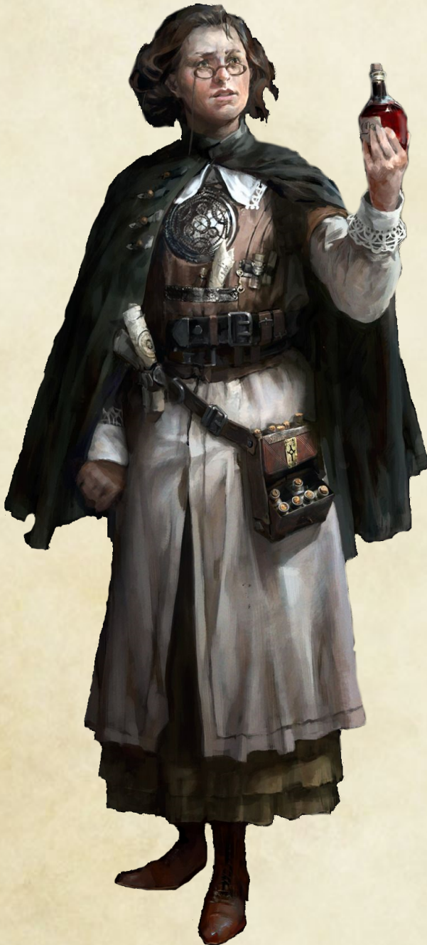
Custom Class By: IIEarlGreyII v2.0 Art Credits: Chris Cole, Stanely Lau, Bjorn Hurri

When you choose this profession at 3rd level your doctor's bag has been modified to accommodate your specialization. It functions as normal, but also replaces the need for Alchemist's Supplies, an Herbalism Kit, or a Poisoner's Kit.