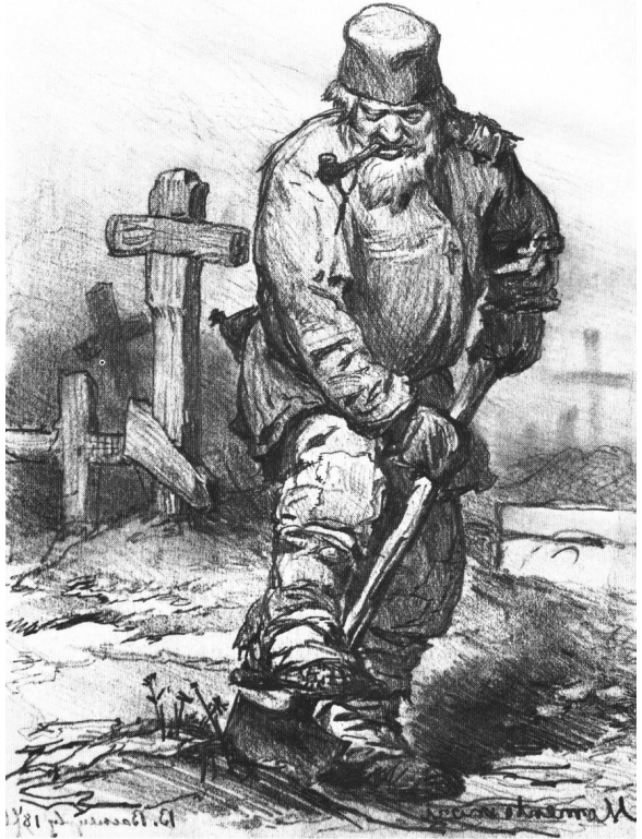
Viktor M. Vasnetsov, December 31, 1870

You are not liked. Grave diggers are considered unclean, and even in societies where they aren't a lower caste, they aren't trusted. Who knows if one will exhume the body of the loved one to steal their possessions. Being ignored and treated badly may have formed a large part of your personality.