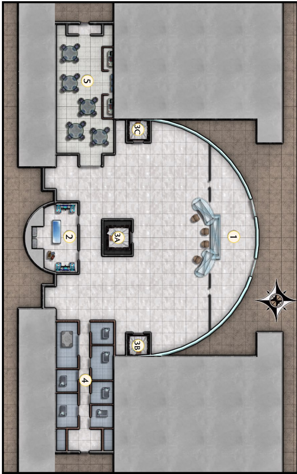
ALTAI MEDIA LOBBY