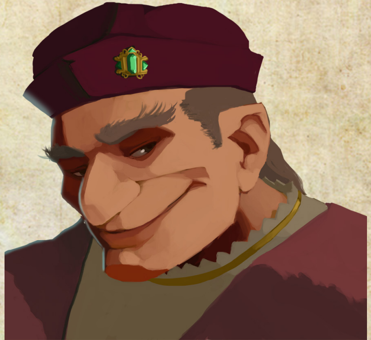
UEBEL THE MERCHANT