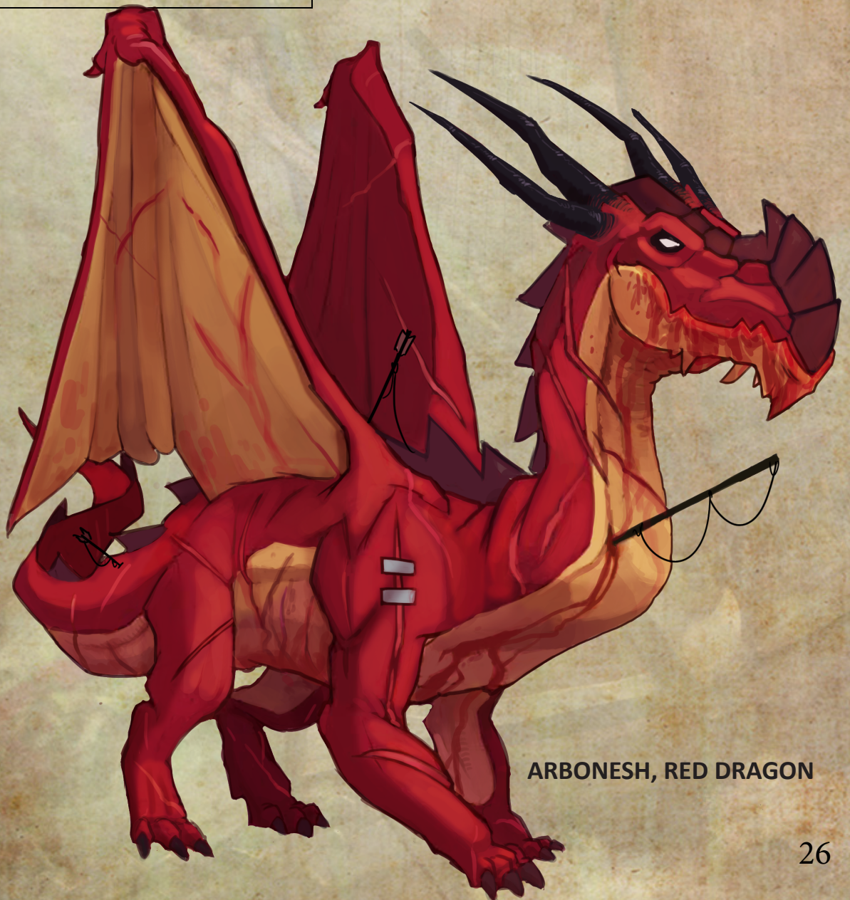
ARBONESH, RED DRAGON