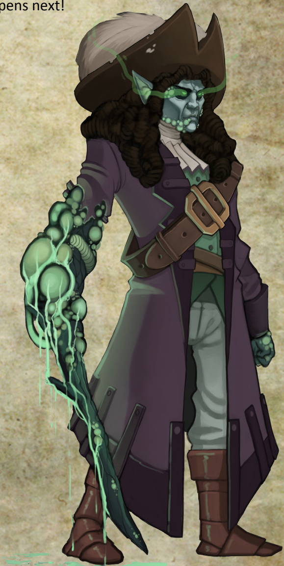
CAPTAIN VAAL, THE HEATHEN STING

When defeated, the power of Gorr releases out of Vaal in a final attempt to destroy the party and the ship itself. Turn to Chapter 2 to see what happens next!