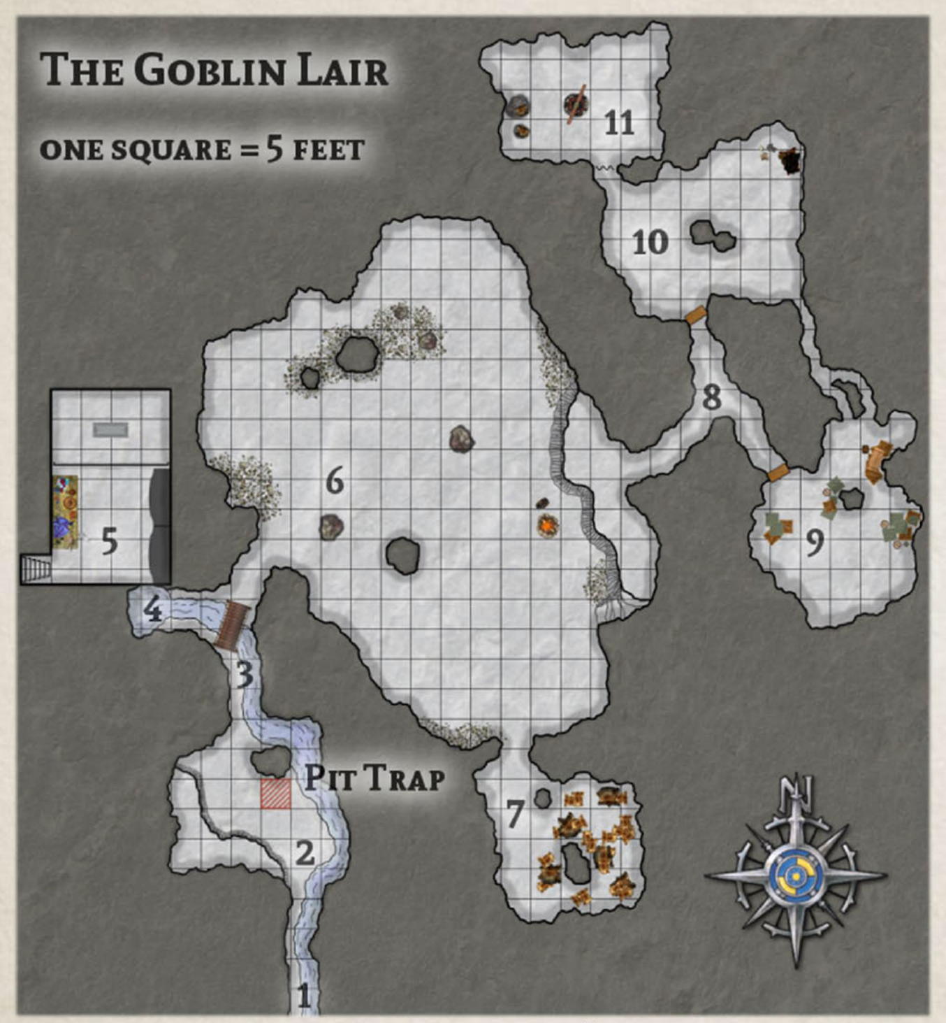
THE GOBLIN LAIR MADE WITH DUNDJINNI SOFTWARE, HTTP://WWW.DUNDJINNI.COM.

The goblins can drop prone behind the edge of the ledge and not be seen by anyone on the cave floor. However, even if the goblins are hidden, a slight shuffling from their movements can be heard by a character with a