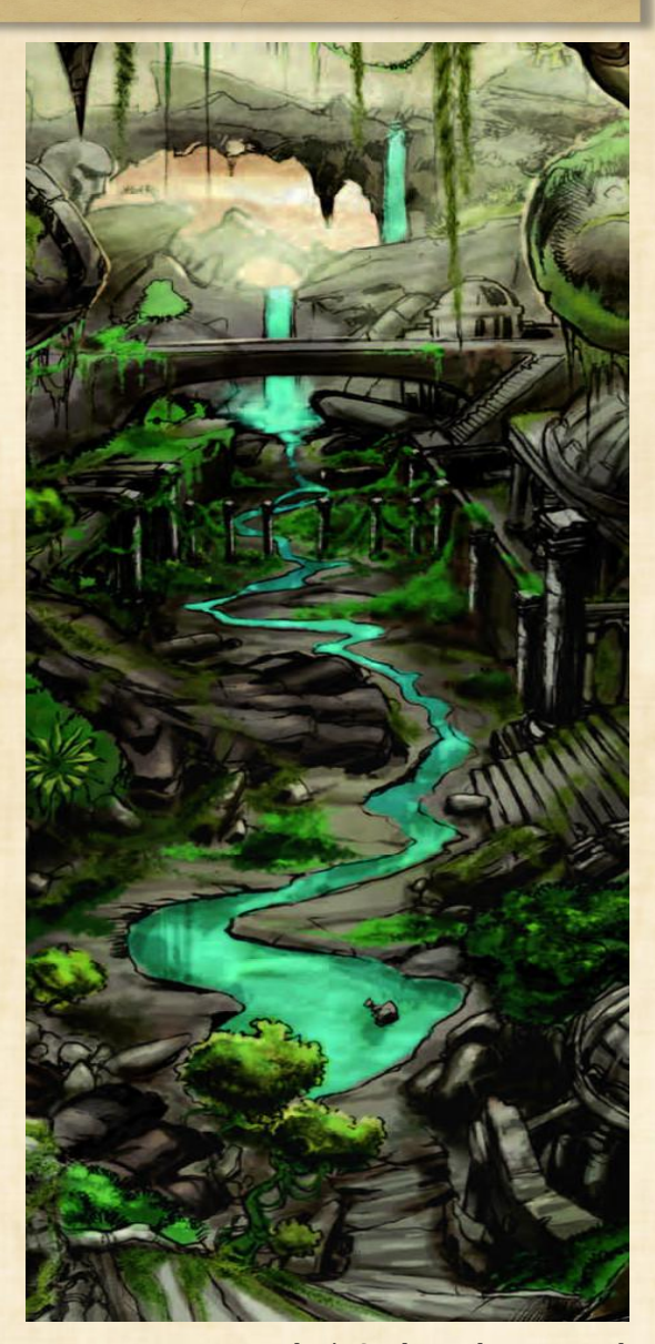
Naturalist's Guide to Eberron - Vol 1

I told you I'd get all rashy and itchy for nothing. - Ardiane